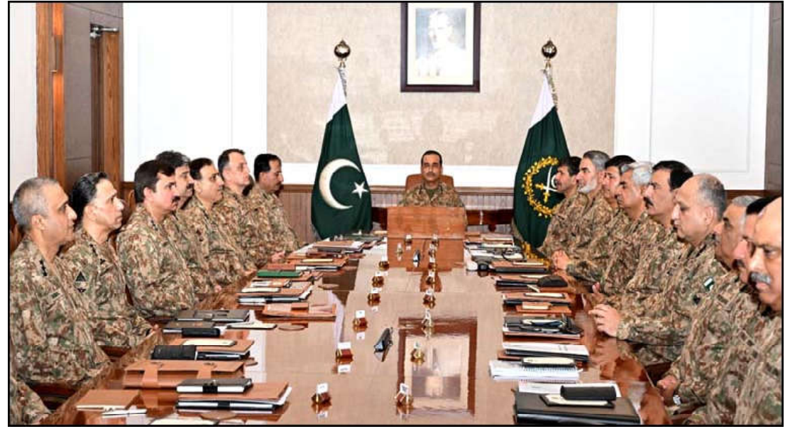
RAWALPINDI: Chief of Army Staff General Syed Asim Munir presiding over 265th Corps Commanders' Conference