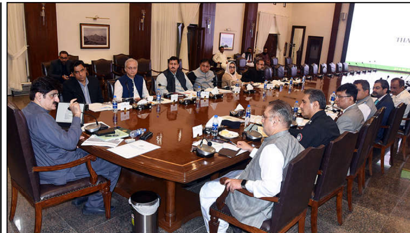
KARACHI: Sindh Chief Minister Syed Murad Ali Shah presides over a meeting of Excise, Taxation & Narcotic Control dept at CM House.

It was disclosed the department has also check-posts, three each in Karachi and Larkano, two each in Hyderabad, Sukkur and Shaheed Benazirabad divisions. Murad Ali Shah directed the Minister of Excise & Narcotics to further strengthen Narcotic police with necessary equipment, vehicles and gadgets so that they work at full capacity.