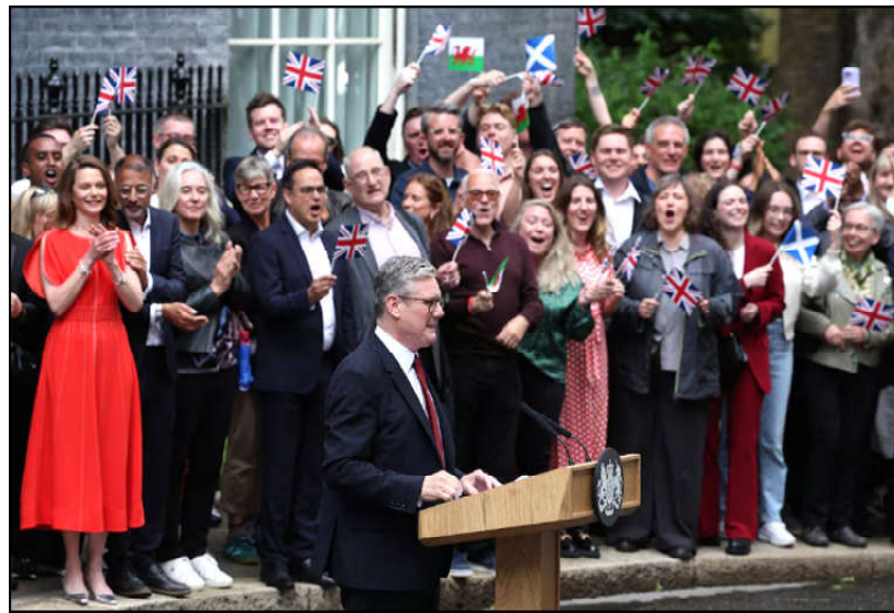
British Prime Minister Keir Starmer speaks, at Number 10 Downing Street, following the results of the election, in London, Britain.

The centre-left Labour was set to win a massive majority in the 650-seat parliament with Sunak's Conservatives poised to suffer the worst performance in the party's long history as voters punished them for a cost of living crisis, failing public services, and a series of scandals.