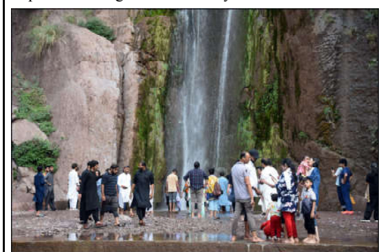
MUZAFFRABAD: Picnickers are enjoying in front of Dhani waterfall outskirts area of the city.

In this regard, in the light of the instructions issued by Chief Minister, Khyber Pakhtunkhwa, the Energy and Power department organized a