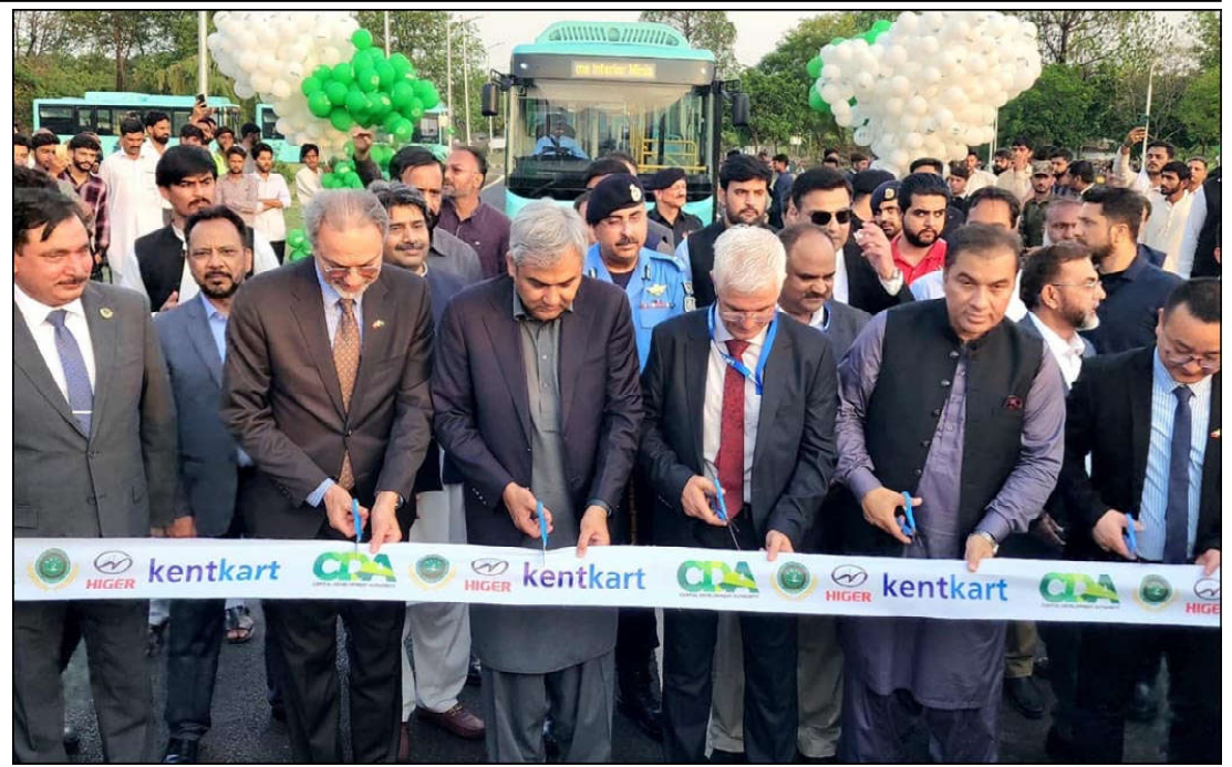
Federal Minister for Interior Mohsin Naqvi cutting ribbon during the launching Ceremony of the first ever Environment Friendly E-Buses in Islamabad

located for the Health Tower in Sector H-16. The Interior Minister congratulated CDA team, including Chairman CDA, on achieving record tax collection but warned that no organization can run solely on plot and land sales; therefore it is essential to develop the assets of the organization. In this regard, the Interior Minister directed that an investment plan be prepared and presented within seven days. The meeting also reviewed the progress on various ongoing development projects, including the Kuri Enclave, renovation of Federal Secretariat building, Diplomatic Enclave, and Smart Parking projects.