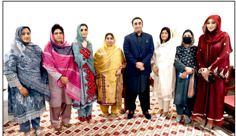
QUETTA: Female MPs of Balochistan Assembly photographed with Chairman Pakistan Peoples Party Bilawal Bhatto Zardari after a meeting.

In addition to this, they also discussed about the exports of minerals from the province.