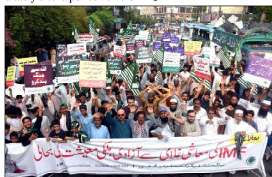
LAHORE: Activists of Pakistan Central Muslim League hold a protest against inflation in Pakistan, outside press club in the Provincial Capital.

Police have started collecting evidence from the site and initiated an investigation into the incident.