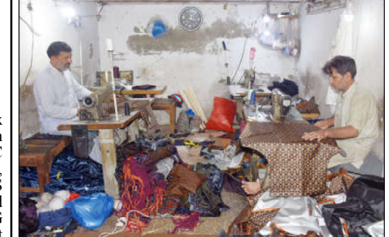
LAHORE: Tailors busy in stitching rain coats at their workplace during monsoon rainy session in the Provincial Capital.

The Ambassador emphasized the enormous potential within Pakistan, particularly in the fields of Information Technology (IT), engineering, and education. He underscored the opportunities for enhancing bilateral trade between Sweden and Pakistan. "Pakistan has the capacity to become a hub of international trade for the entire world," he remarked. "The country offers a fertile ground for expanding trade."