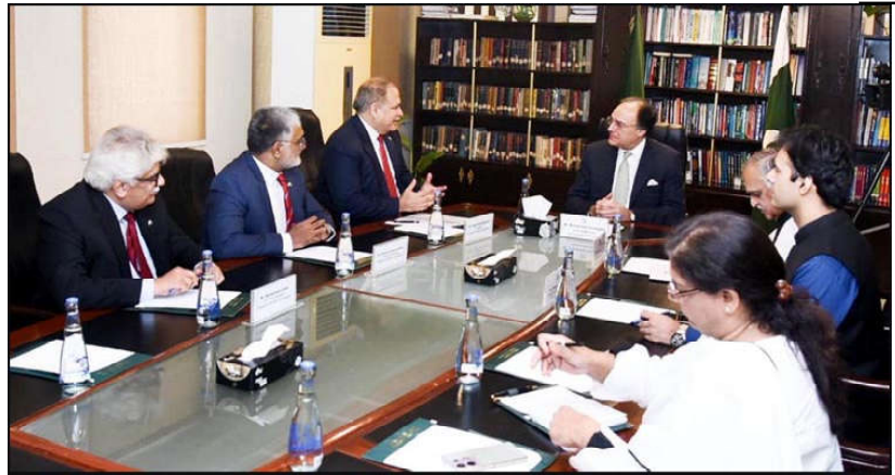
ISLAMABAD: Federal Minister for Finance & Revenue Senator Muhammad Aurangzeb in a meeting with the delegation of Pakistan Tax Bar Association.