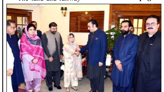
QUETTA: Chairman Pakistan Peoples Party Bilawal Bhutto Zardari giving away keys of scooter to a student who got position in matriculation examination. Chief Minister Balochistan Mir Sarfaraz Bugti and Provincial Minister are also present