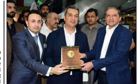
ISLAMABAD: Chairman of Senate Standing Committee Finance and Revenue Senator Saleem Mandviwalla presenting a shield to Ambassador of Azerbaijan to Pakistan Khazar Farhadov, during 8th annual Mango Festival at a local mall in the Federal Capital.

However, as per Forex Association of Pakistan (FAP), the buying and selling rates of the dollar in the open market was recorded as Rs 277.75 and Rs 280.50 respectively. The price of the Euro increased by 60 paise to close at Rs 301.43 against the last day's closing of Rs 300.83, according to the State Bank of Pakistan (SBP). The Japanese yen went up by 01 paise and closed at Rs 1.73, whereas an increase of 52 paise was witnessed in the exchange rate.