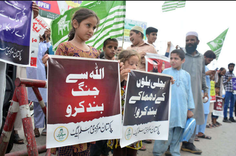
RAWALPINDI: Activists of Pakistan Central Muslim League hold placards during protest against inflation in Pakistan, at Tench Bhatta chowk.