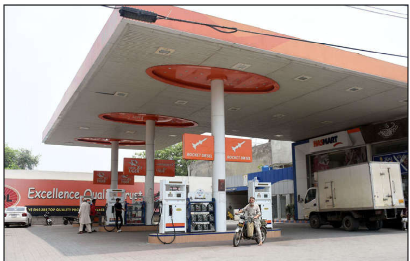
LAHORE: A view of deserted petrol pump during strike against the hike in tax in the Provincial Capital. Thousands of petrol stations shut down across Pakistan in protest against new taxes.

According to the PSDP, the government has also allocated a total of Rs. 28,929 million for the financial year for ongoing and new schemes of the Information Technology and Telecom Division.