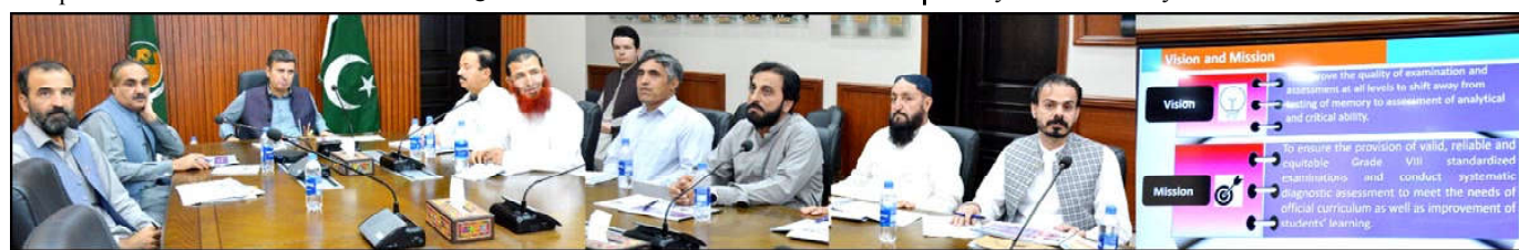
QUETTA: Balochistan Chief Secretary Shakeel Qadir Khan being briefed about Balochistan Assessment and Examination Commission.

The Assistant IGP on the occasion appreciated the standard of training of the ATF training schools and said that it is manifestation of the hard work and dedication of the training staff. The Commandant ATF Training School, Colonel (Retd) Asad Ferooz presented welcome address on the occasion.