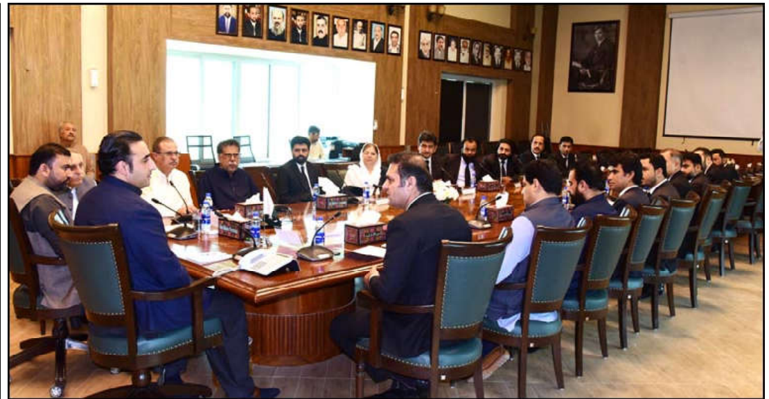
QUETTA: A representative delegation of Peoples Lawyers Forum meeting with Chairman Pakistan Peoples Party Bilawal Bhutto Zardari. Chief Minister Balochistan Mir Sarfaraz Bugti and Provincial Minister are also present

again shortly and are expected to be completed within a period of five months," Senator Tarar said. Responding to the supplementary query of Senator Humayun Mohmand, he said the transport was a devolved subject and the federal government could only operate E-Buses not other than Islamabad Capital Territory (ICT). He added that the federal government's policy was to shift over renewable energy and friendly policies for solar panels and EVs were introduced.