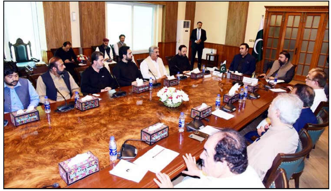
QUETTA: A delegation of Quetta Chamber of Commerce led by Senator Bilal Khan Mandokhail meeting with Chairman PPP Bilawal Bhutto Zardari. Balochistan Chief Minister Mir Sarfraz Bugti and Provincial Ministers are also present.

He emphasized that road connectivity and communications were very much necessary to increase the bilateral links between the two countries.