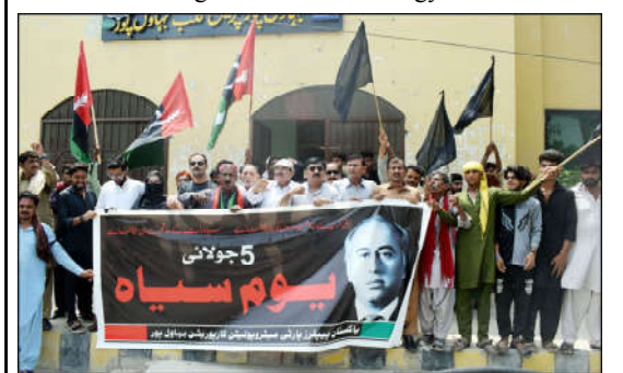
BAHAWALPUR: Activists of Pakistan People's Party hold a banner during protest on the eve of black day on 5th July, outside press club in the city.

Chairperson of NVTTC said that actions would be taken on proposals of KP Governor and steps would be taken to train youth and women in modern fields of technology.