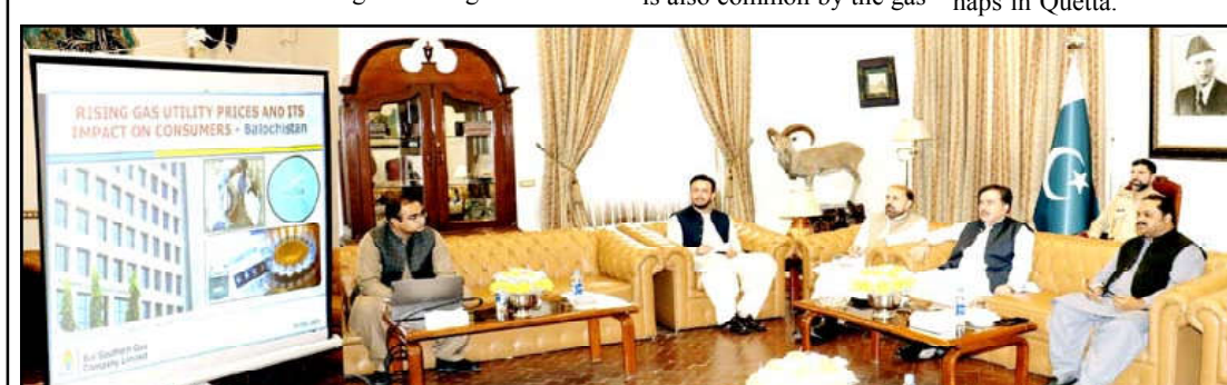
QUETTA: Governor Balochistan Sheikh Jaffar Khan Mandokhail being briefed about Sui Southern Gas Company

He also stressed the need to make special arrangements for prevention of the Sui gas related mishaps in Quetta.