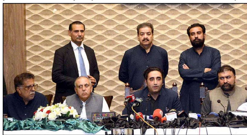
QUETTA: PPP Chairman Bilawal Bhutto-Zardari addressing a press conference.