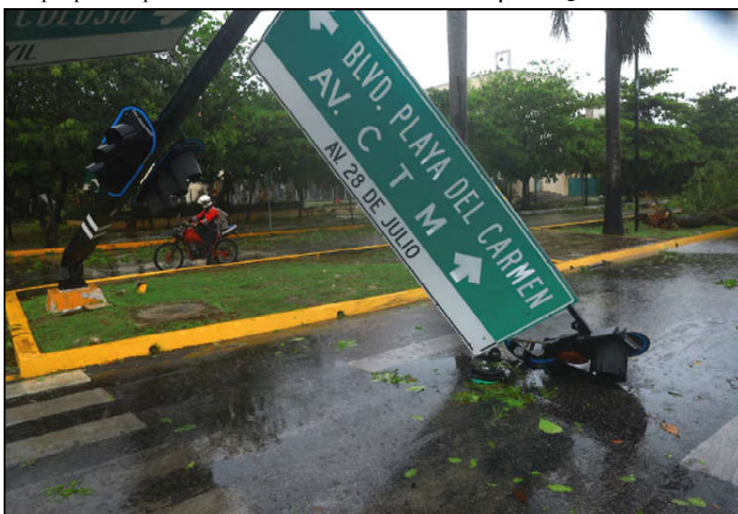
A motorist passes by a traffic signal toppled by heavy winds and rain, caused by Hurricane Beryl, a Category 2 storm, in Playa del Carmen, Mexico.

The incident occurred on Tuesday in the village of Phulrai Mughal Garhi in Hathras district where about 250,000 people had gathered to listen to preacher Suraj Pal Singh, also known as "Bhole Baba". Organisers of the event had obtained permission for a gathering of only 80,000 people.