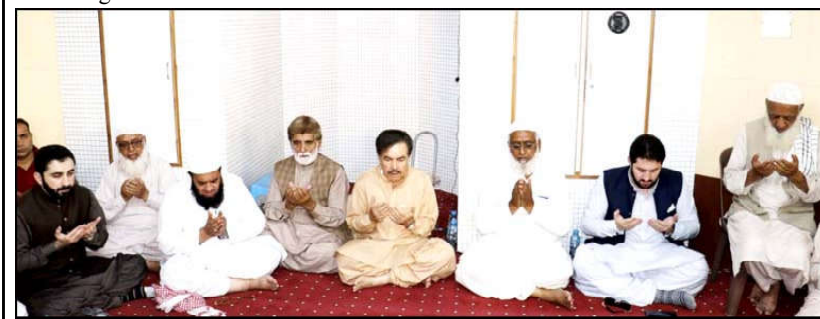
QUETTA: Governor Balochistan Sheikh Jaffar Khan Mandokhail offering fataha on sad demise of student of BUIITEMS Ali Akbar killed in bus incident

According to Rescue 1122, the ill-fated family was traveling from Swabi Meera area to Islamabad airport when it plunged into a gorge while navigating a sharp turn in the vicinity of Sadar police station Haripur. Seven people died instantly and ten others sustained critical injuries. A total of 17 family members were aboard the vehicle to receive one of their relatives at Islamabad airport. Rescue 1122 said women and children were among those killed and injured in the mishap, adding that the death toll might increase as some of the injured were in critical condition.