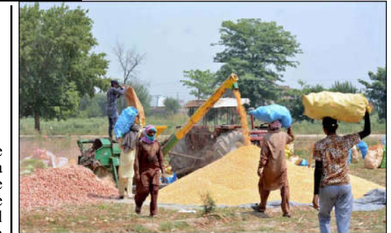
FAISALABAD: Farmers busy in thrashing corn crop at their field.

RIYADH (SPA/APP): The Kingdom of Saudi Arabia unanimously won the presidency of the Executive Council of the Arab Civil Aviation Organization (CAAO) during the 28th Ordinary General Assembly meeting in Rabat, Morocco. Minister of Transport and Logistic Services, Eng. Saleh Al-Jasser, stated that this victory reflects the Kingdom's high status in international and regional organizations and its significant role in civil aviation. Al-Jasser expressed gratitude to Custodian of the Two Holy Mosques King Salman bin Abdulaziz Al Saud and Saudi Prince Mohammed bin Salman bin Abdulaziz Al Saud.