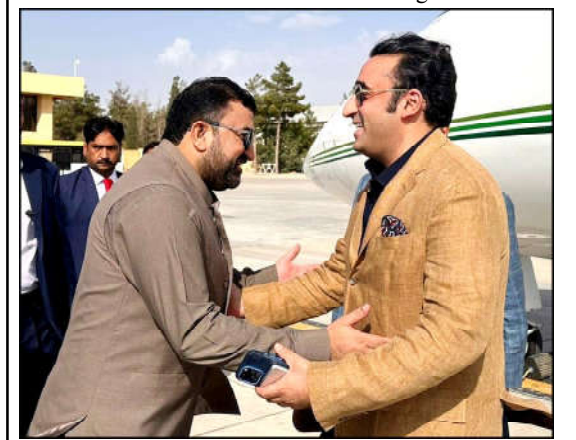
Chief Minister Balochistan Mir Sarfaraz Bugti receiving Chairman PPP Bilawal Bhutto Zardari on upon at Quetta Airport

The prime minister shared Pakistan's efforts and desire for a peaceful and stable region.