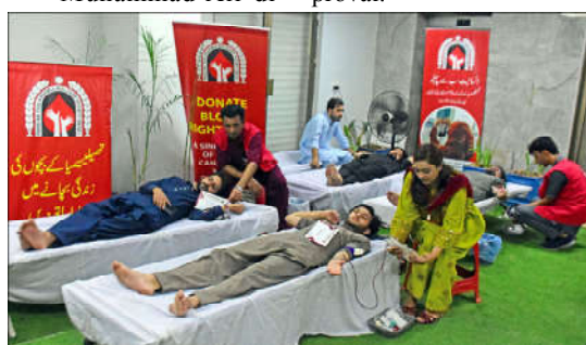
ISLAMABAD: Volunteers donating blood for Thalassemia patients at Sector I-8 in the Federal Capital.