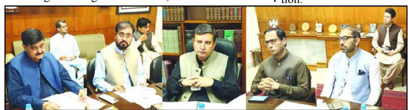
QUETTA: Chief Secretary Balochistan Shakeel Qadir Khan presiding over a meeting regarding prevention of smuggling of sugar in the province

Moreover, NEOC has predicted moderate to heavy rainfall in Gilgit-Baltistan until July 8th, which may trigger flash flooding in local nullahs. Areas such as Chigar and Khaplu are at risk of flash flooding during heavy rains," it said.