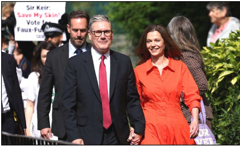
Britain's opposition Labour Party leader Keir Starmer and his wife Victoria Starmer walk outside a polling station during the general election in London, Britain.

Devotees from across the state, which with over 200 million people is India's most populous, traveled to the village, with rows of parked vehicles stretching three kilometers.