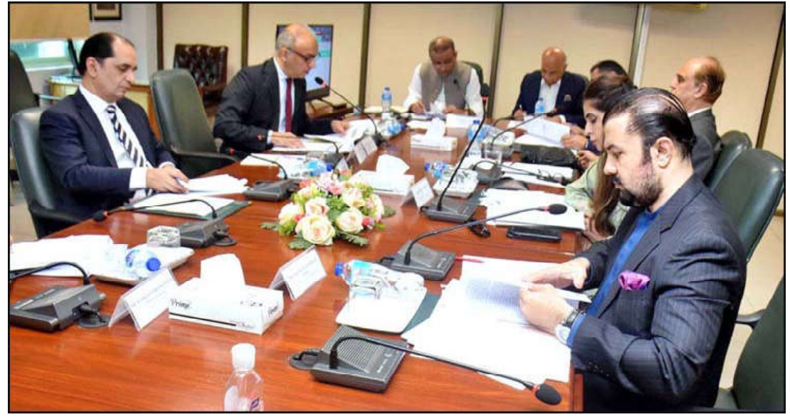
ISLAMABAD: Federal Minister for Privatization / Chairman Privatization Commission, Abdul Aleem Khan chairing 220th meeting of the Privatization Commission Board.

Privatization Abdul Aleem Khan, Minister of Finance Muhammad Aurangzeb and Minister of Law Azam Nazir Tarrar held a meeting to review the progress on privatization of House Building Finance Corporation. In this meeting, it was agreed that the protection of the employees of the institution will be kept in view during its privatization. The technical and legal aspects of the privatization of the House Building Finance Corporation (HBFC) were also discussed in the