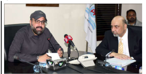
ISLAMABAD: Federal Minister for Overseas Pakistanis Ch Salik Hussain addressing a press conference at OPF head office in the Federal Capital.