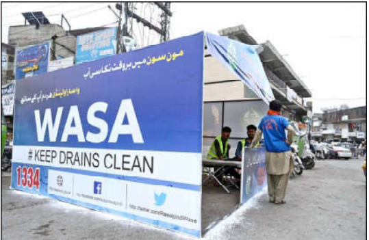
RAWALPINDI: Water and Sanitation Agency (WASA) establish Flood Response Unit at Gawalmandi near Nullah Lai as pre-monsoon spell is expected to start from Thursday to Sunday and assured that all necessary arrangements have been made in this regard by Rawalpindi Development Authority (RDA).

He said that oil and gas are produced at 16 places in the southern districts of the province, Kohat, Karak, Hangu and Lakki Marwat, which is earning receipts to the tune of billions of rupees.