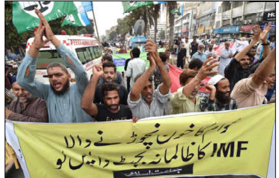
KARACHI: Activates of Jamate islami hold protest against K-Electric at Saddar locality.

need to be a top priority. Training at not only the government level, but also non-governmental and corporate levels should be included in the entire system, due to the cross-border connections are the key to the success of the entire digital economy revolution." Moreover, Pakistani partners are very eager to form a CPEC digital economy park, in which Beijing has very rich experience. We hope that through our step-by-step construction, the China-Pakistan Digital Corridor will become an important leader in the global digital economy. Regarding the digitalized CPEC.