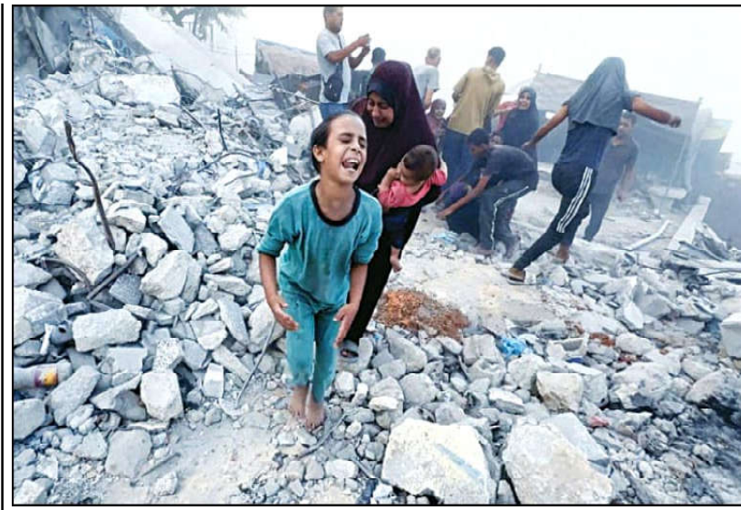
Palestinians react, following an Israeli strike near a UN-run school sheltering displaced people, in Khan Younis.

Images on social media showed people of all ages wading across the Blue Nile. Activists in both states say there is little shelter or food aid for the incomers. In Gedaref, they faced an onslaught of heavy rain while stranded in the state capital's main market with no tents or blankets after schools that had served as displacement centres were emptied by the government.