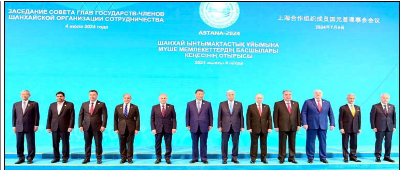
ASTANA: Prime Minister, Muhammad Shehbaz in a group photo with member states during Shanghai Cooperation Organization Summit, held in Astana.

He stressed that we have to fight the war of state against terrorism with political responsibility and joint strategy.