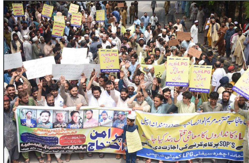
LAHORE: All Punjab LPG Distributors Association and shopkeepers hold a protest demonstration in front of press club of the provincial capital.

funding for agricultural universities and research institutions to develop new farming techniques and seed varieties. Collaborations with international agricultural research organizations were also discussed. The Committee stressed the need for training programs to educate farmers on modern agricultural practices. Extension services and farmer field schools were suggested as effective means to disseminate knowledge and improve farmers' skills. Recognizing the pivotal role of farmers in agriculture, the Committee underscored the importance of farmer-friendly policies. It also recommended to provide adequate support mechanisms, including access to affordable