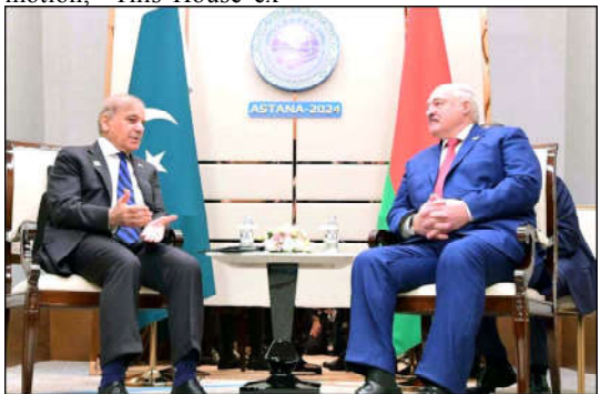
ASTANA: Prime Minister Muhammad Shehbaz Sharif meets with President of the Republic of Belarus H.E. Aleksandr Lukashenko on the sidelines of Shanghai Cooperation Organization Summit.

The late Senator always took active part in debates on important legislation and other issues of national and public importance. The services rendered by him would be long remembered and his loss will be deeply mourned.