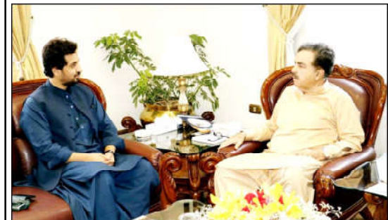
QUETTA: Provincial Finance Minister Mir Shoaib Nausherwani meeting with Governor Balochistan Sheikh Jaffar Khan Mandokhail

Independent Report QUETTA: The Governor Balochistan, Sheikh Jaffar Khan Mandokhail has underlined the need to increase the gross national product, build capacity and strengthen tax recovery system further. The Governor pointed out that our natural resources are less, but social issues are more than them. He said that it is a challenge for the government to maintain balance between the limited resources and issues being faced by the people. However, the economic experts can provide guidance to meet the requirements of increasing population in the limited resources. The Governor was speaking to the Provincial Minister for Finance and Mines & Mineral Development, Mir Shoaib Nausherwani who called on him here at the Governor's House on Thursday. During the course of meeting, the overall political situation of the country and province as well as transfer of fruits of development and government's initiatives at the lower level and other matters of mutual interests were discussed. Speaking on the occasion, Governor stressed that we have to make serious decisions for stabilizing the country's economic system besides benefitting the general public from the fruits of development in the province. He was of the strong view that financial matters would be improved by reducing the non-development expenditures. He also said that we can secure our future with mutual consultation and combined efforts.