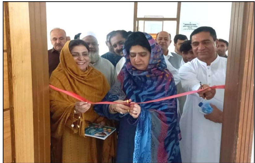
QUETTA: Provincial Education Minister Raheela Hameed Khan Durrani inaugurating anti-harassment cell at Directorate of Education