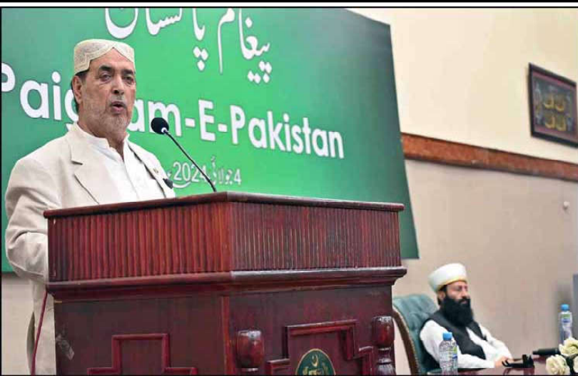
GILGIT: Governor Gilgit-Baltistan Syed Mehdi Shah addressing during the Paigham-e-Pakistan Conference, an initiative to maintain peace and harmony in Gilgit-Baltistan organized by Govt of Gilgit-Baltistan.

He said that repair schemes for broken streets and drains should be completed on a priority basis and all the projects should be designed following the following demands of future.