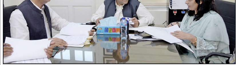
LAHORE: Punjab Local Government Minister Zeeshan Rafiq chairs meeting to review ongoing development schemes under the Punjab Local Government Department.

The state council told during the hearing data of geo fencing was obtained on Monday under the orders of the court. Geo fencing data is being analyzed. Justice Amjad Rafiq inquired do the numbers of agencies not come to fore or they come.