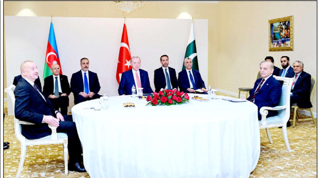
ASTANA: Prime Minister Muhammad Shehbaz Sharif in an inaugural session of Pakistan-Turkiye-Azerbaijan Trilateral Summit along with President of Turkiye H.E. Recep Tayyip Erdogan and President of Azerbaijan H.E. Ilham Aliyev, on the sidelines of Shanghai Cooperation Organisation Summit

While noting excellent trilateral cooperation in political, parliamentary and defence domains since the First Trilateral Meeting of Foreign Ministers of the three countries held in Baku in 2017, he affirmed Pakistan's commitment to working together with Turkiye and Azerbaijan to elevate the tripartite cooperation into a strong multifaceted partnership across all areas of mutual interest including economic, energy, tourism, cultural, educational, technology and innovation, healthcare and environmental cooperation. Emphasizing strong bonds of friendship and robust people-to-people contacts amongst the three countries, the prime minister also outlined significant potential for collaboration in the areas of culture, tourism, academia as well as science and technology.