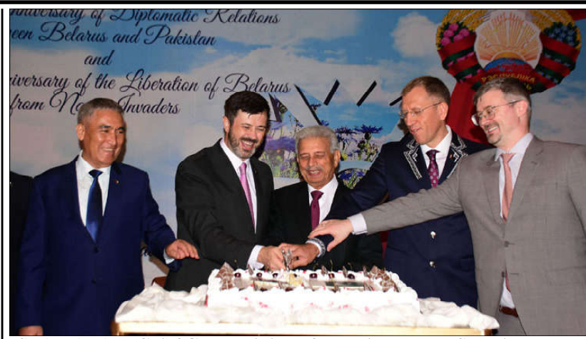
ISLAMABAD: Chief Guest Minister for National Food Security and Research Rana Tanveer Hussain and Ambassador of the Republic of Belarus to Pakistan, Andrei Metelitsa cutting the cake on the occasion of the Independence Day of the Republic of Belarus and the 30th anniversary of Diplomatic Relations between Belarus and Pakistan at a local hotel in Federal Capital.

She emphasized the goal of creating a plastic-free Punjab, where rivers, parks, and cities are free from plastic pollution.