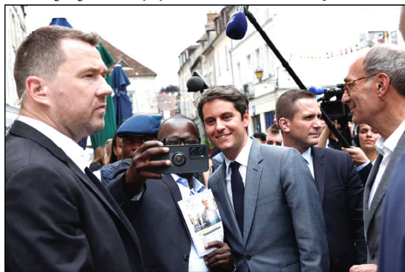
French Prime Minister Gabriel Attal and Eric Woerth, Renaissance candidate for the fourth constituency of Oise, campaign before the second round of the early French parliamentary elections, in Senlis, north of Paris, France.

Tuesday, Interior Minister Kithure Kindike blamed violence on "hordes of marauding criminal gangs" and said there was an attempt to "politicise crime". The initial protests last month against proposed tax hikes were overwhelmingly peaceful, although the police fired tear gas and water cannon at demonstrators. The mobilisation of Kenyans from across ethnic lines around common economic demands marked a notable break with previous protest movements, which have typically been organised by political figures with ethnic grievances often at the fore. The protests have taken a violent turn in the past week. Some demonstrators briefly stormed parliament last week and the police opened fire, killing dozens. The next day, President William Ruto withdrew the tax increase. But protesters vowed to carry on, issuing a range of demands, from anti-corruption measures to Ruto's resignation.