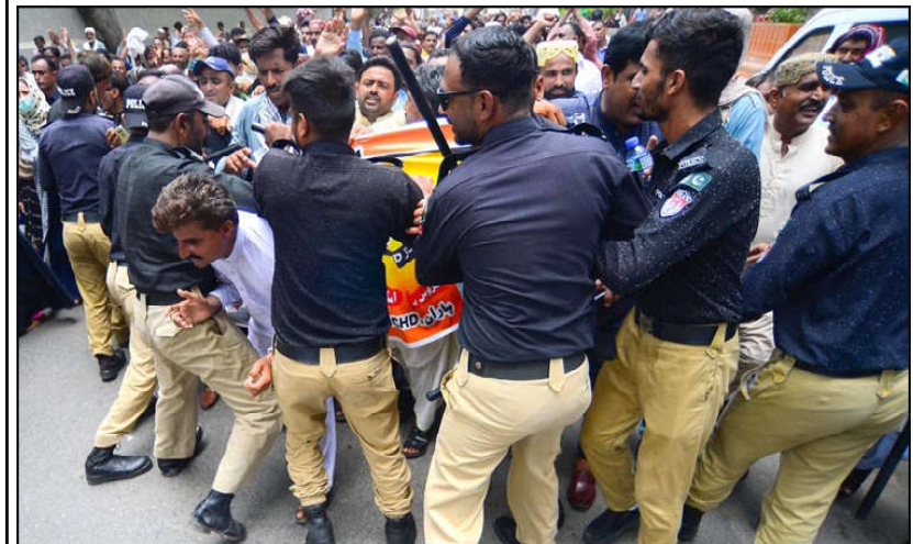
KARACHI: Police personnel's trying to stop teachers going toward red zone area during a protest.

The court has directed to submit records from both the ACB.