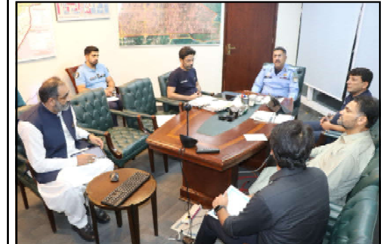
ISLAMABAD: The Inspector General Police (IGP) Islamabad reviewed various on going initiatives including the new recruitment process with merit and transparency, to include educated youth in the police force, and to take further steps for the welfare of police officers. Additionally, IG Islamabad chaired a meeting consisting of senior police officers to ensure effective security arrangements in the federal capital during Muharram-ul-Haram. FC will assist Islamabad Police in fulfilling its duties during Muharram, he added. In the meeting, new targets were assigned to the IT and Technical teams regarding the installation of more cameras for better functionality.

ment process with merit and transparency, to include educated youth in the police force, and to take further steps for the welfare of police officers. Additionally, IG Islamabad chaired a meeting consisting of senior police officers to ensure effective security arrangements in the federal capital during Muharram-ul-Haram. FC will assist Islamabad Police in fulfilling its duties during Muharram, he added. In the meeting, new targets were assigned to the IT and Technical teams regarding the installation of more cameras for better functionality.