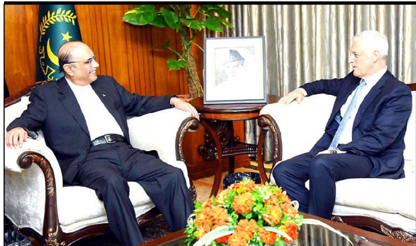
ISLAMABAD: Group Chief Executive of the Standard Chartered Bank Bill Winters, called on President Asif Ali Zardari, at Aiwan-e-Sadr.