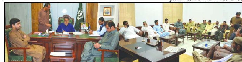
QUETTA: Different delegations meeting with Provincial Minister for Irrigation Mir Muhammad Sadiq Umrai

The DC directed the heads of relevant departments to take precautionary measures and take all necessary steps to deal with the monsoon emergency and the possible flood situation. It was also decided in the meeting that cleaning of other drains including the main drain passing through Hub city would be ensured before the monsoon. She said that under the Disaster Action Plan, the District Health Officer (DHO) would set up health camps for health emergencies saying that low-lying areas and drains.