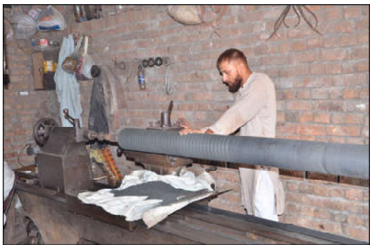
FAISALABAD: A craftsman works in a local factory on Maqbool Road in the city.

ISLAMABAD (APP): The Senate Standing Committee on Finance and Revenue on Wednesday unanimously approved the amendments to the State-Owned Enterprises Governance and Operations ordinance, 2024. The committee met here with Senator Saleem Mandviwalla in chair and discussed the amendments on State-Owned Enterprises (Governance and Operations) (Amendment) ordinance, 2024, said a press release.