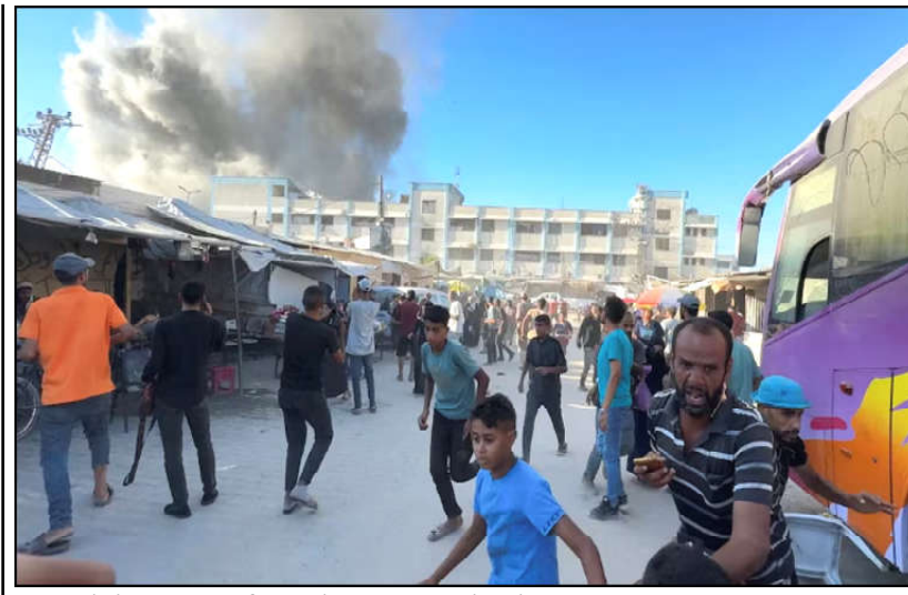
Palestinians react, following an Israeli strike near a UN-run school sheltering displaced people, amid the Israel-Hamas conflict, in Khan Younis, in the southern Gaza Strip.