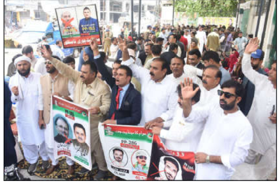
LAHORE: After the symbolic session members of Form 45 protesting, in front of the Punjab Assembly of the provincial capital.

During his visit, he discussed potential technical collaborations with Tajik energy officials.