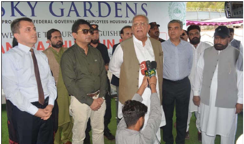
ISLAMABAD: Federal Minister for Housing and Works, Mian Riaz Hussain Pirzada, talking to media after visiting Federal Government Employees Housing Authority Bhara Kahu Sky Garden scheme.

She also commended the role of media for supporting climate cause and demonstrating its commitment to it at every forum.