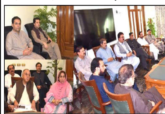
QUETTA: Provincial Ministers, Senators, MPAs and leaders belong to PPP meeting with Chief Minister Balochistan Mir Sarfraz Ahmed Bugti

The tribunal also set aside the ECP's decision of recounting in the said constituency.