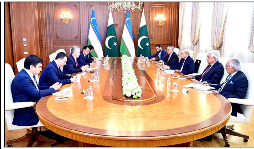
ASTANA: Prime Minister Muhammad Shehbaz Sharif meets with President of Uzbekistan H.E. Shavkat Mirziyoyev on the sidelines of Shanghai Cooperation Organisation Summit.

The early realization of Uzbekistan-Afghanistan-Pakistan Railway Project was also discussed.