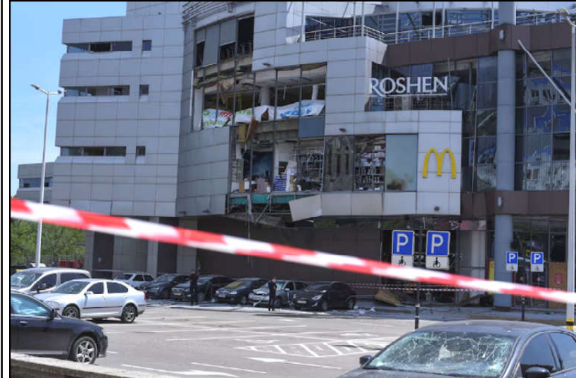
Police officers work at a site of a shopping mall damaged during Russian missile and drone strikes, amid Russia's attack on Ukraine.

Monitoring Desk MOSCOW: Authorities in Russia's mostly-Muslim North Caucasus region of Dagestan on Wednesday temporarily banned women from wearing the niqab, after simultaneous attacks targeting churches and synagogues killed 22 last month. In a statement posted on the Telegram messenger app, the Dagestan Muftiate said it was introducing a "temporary" ban on the niqab after an appeal from Russia's ministry of nationality policy and religious affairs. Reports following the attacks on June 23 said one of the gunmen had planned to escape wearing a niqab. The muftiate, a religious organisation representing Dagestani Muslims, said that the ban would remain in place "until the identified threats are eliminated and a new theological conclusion is reached". The niqab gained some popularity in Dagestan amid an Islamic revival in the region that followed the collapse of the Soviet Union in 1991.