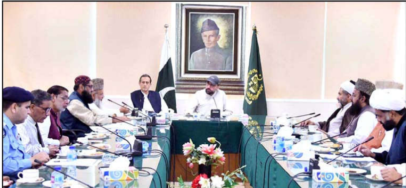
ISLAMABAD: Federal Minister of Religious Affairs and Interfaith Harmony, Chaudhry Salik Hussain chairing a meeting regarding inter-religious harmony during Muharram-ul-Haram.