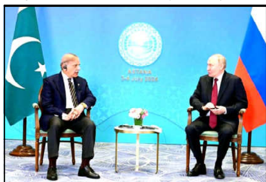
ASTANA: Prime Minister Muhammad Shehbaz Sharif meets with the President of Russia H.E. Vladimir Putin.