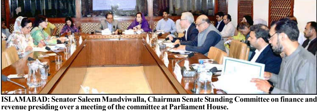
ISLAMABAD: Senator Saleem Mandviwalla, Chairman Senate Standing Committee on finance and revenue presiding over a meeting of the committee at Parliament House.

He added that throughout the world, the developing economies are struggling for the better progress and advancement of the education sector for rational economic growth and substantial development. In poverty stricken array, Pakistan and the Ministry of Education (MoE) can reinvigorate policies to meet the educational challenges.