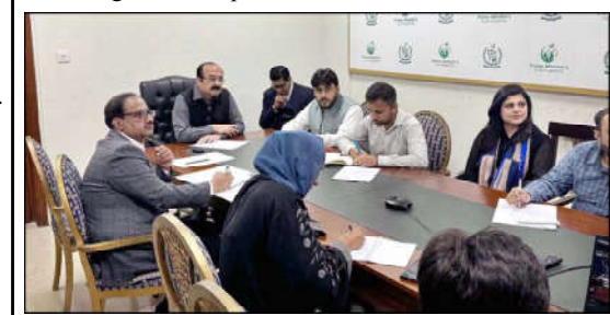
ISLAMABAD: Chairman Prime Minister's Youth Programme Rana Mashood Ahmed Khan in a meeting with state bank officials.

The hospital management had pledged to rectify the issues and implement proper waste management protocols. Moreover, Pak-EPA and IHRA would continue monitoring health facilities in Islamabad to ensure compliance with the Hospital Waste Management Rules 2005, taking necessary actions to safeguard public health and the environment.