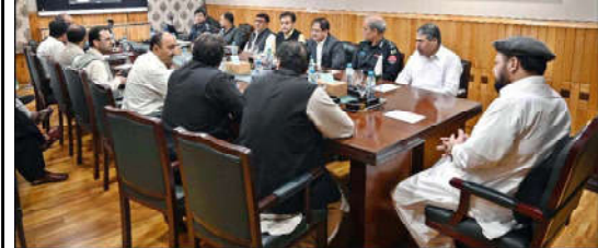
GILGIT: Chief Minister Gilgit-Baltistan Haji Gulbar Khan presiding over the meeting regarding the security arrangements in the coming month of Muharram ul Haram.

The meeting was attended by high-ranking officials, including the Home Secretary, Secretary of Health, and Inspector General of Police Gilgit-Baltistan. District commissioners and other officials joined the meeting via video link.