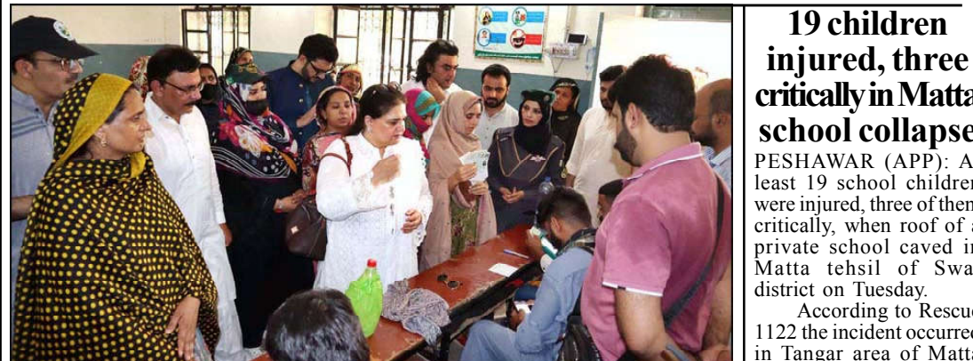
LAHORE: Chairperson of the Benazir Income Support Programme (BISP), Senator Rubina Khalid, inspects the payment disbursement mechanism at a payment campsite.

Senator Pervaiz Rashid and Senior Provincial Minister Marriyum Aurangzeb attended the meeting. Chief Secretary, Additional Chief Secretary, Finance Secretary, Secretary I&C and other relevant officers were also present.