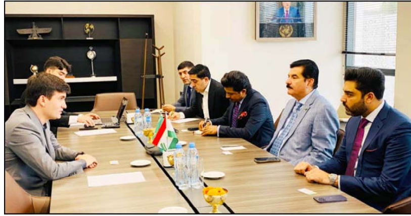
TAJIKISTAN: Governor Khyber Pakhtunkhwa Faisal Karim Kundi meeting with renowned Industrial Group of Tajikistan.

According to a spokesman for the agriculture department, sesame is an oil-seed crop which would not only play a pivotal role in catering to domestic food requirements but its production would also help fetch precious foreign exchange for the country.