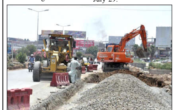
ISLAMABAD: Heavy machinery being utilized for expansion work of Club Road during development work in Federal Capital.