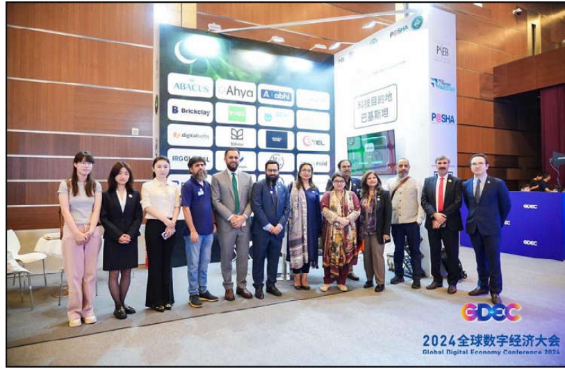
Minister of State for IT and Telecommunication Ms. Shaza Fatima Khawaja in a group photo following visiting booths of different tech companies on the occasion of Global Digital Economy Conference 2024 in Beijing.

On the occasion, Azerbaijan minister Deputy Minister, Sharifov highlighted the ease of travel between the two countries, noting that Azerbaijan received 55,000 Pakistani visitors last year due to its favourable visa policy.