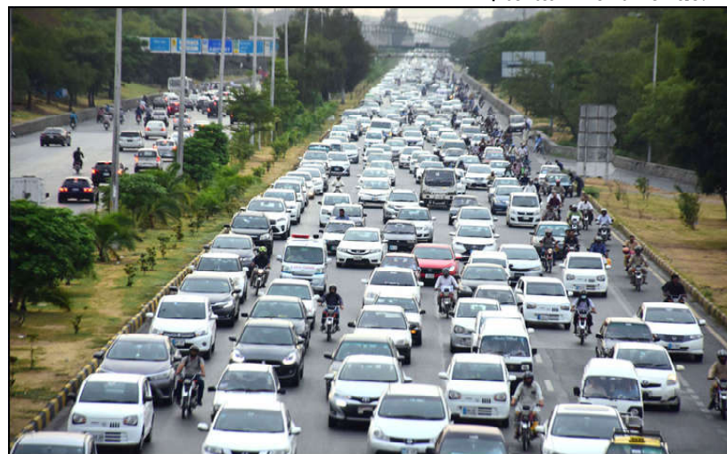
ISLAMABAD: A view of traffic jam at Islamabad Expressway in the Federal Capital.