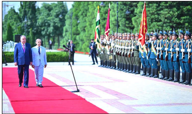
DUSHANBE: Prime Minister Muhammad Shehbaz Sharif receives guard of honor at the Qasr-e-Millat.