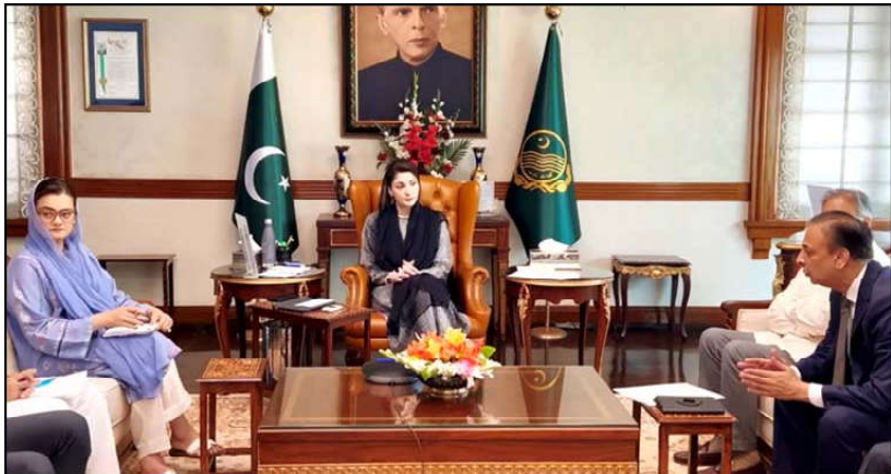
LAHORE: Chief Minister Punjab Maryam Nawaz chairing a special meeting to review amendments to the proposed laws and rules for establishment of the Punjab Enforcement Regulatory Authority

ISLAMABAD (INP): Rana Sanaullah, leader of Pakistan Muslim League (N) and advisor for inter-provincial coordination, emphasized the pivotal role of political parties in steering the country forward. He underscored that political dynamics shape national discourse and governance, urging a shift away from negative narratives surrounding politics. Addressing the audi- ence at an event in Islamabad, Sanaullah called for a cultural re-assessment, applauding positive traditions while advocating accountability for negative attitudes. Reflecting on his extensive experience in law and provincial governance, he highlighted his current role in inter-provincial relations and advocated for enhancing political engagement in sports administration.