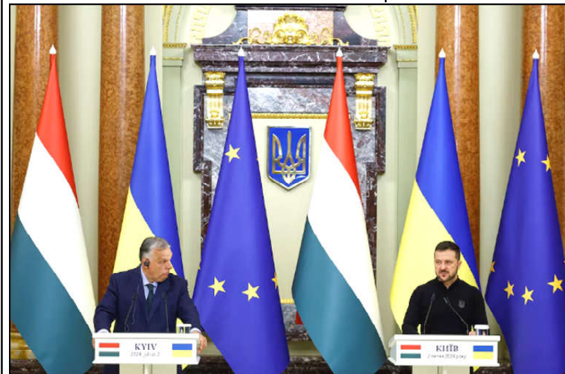
Hungary's Prime Minister Viktor Orbán and Ukrainian President Volodymyr Zelenskyy attend a joint news briefing, amid Russia's attack on Ukraine, in Kyiv.