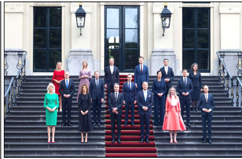
Dutch King Willem-Alexander and Prime Minister Dick Schoof pose with the new members of the Dutch Government at Palace Huis ten Bosch in The Hague, Netherlands.