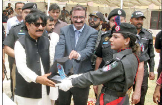
HYDERABAD: Sindh Minister for Prisons, Ali Hassan Zardari, presented shields to the position holders during the passing out parade ceremony of the 18th basic training course for prison constables and lady prison constables at the Sindh Prisons Staff Training Institute.

The CM stated that the Sindh Assembly was in a budget session and that in the next session, he would pass the resolution for sister cities from the assembly.