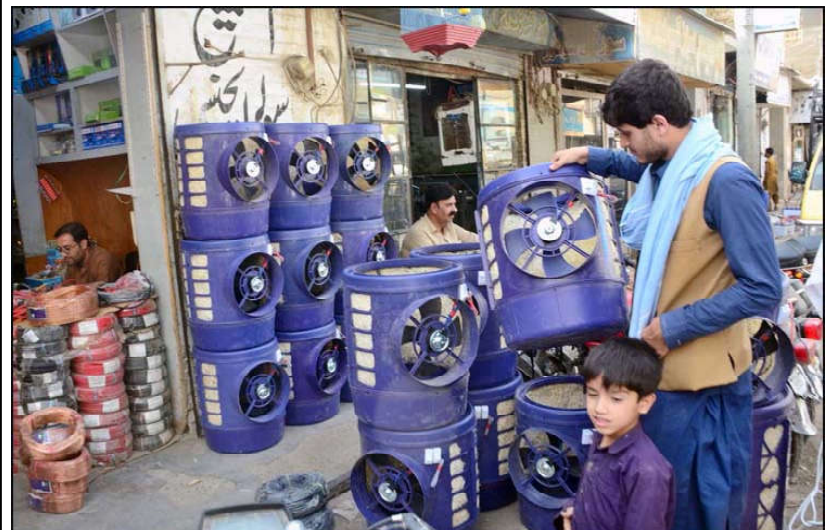
QUETTA: People in Quetta are busy buying solar air coolers as demand has surged due to the extreme heat wave hit the city.

Moreover, the leaders discussed the inclusion of Khalton in the CASA-1000 project, a major initiative for electricity supply among Pakistan, Afghanistan, Tajikistan, and Kyrgyzstan, highlighting its potential to enhance regional connectivity and economic stability.