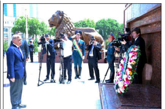
DUSHANBE: Prime Minister, Muhammad Shehbaz Sharif lays a floral wreath at the monument of Ismail Samani in Dushanbe.

The further hearing of the case was adjourned till July 05. The defence counsel completed cross examination of three witnesses of prosecution during the hearing. Cross questioning in respect of 27 witnesses has been completed in the reference.