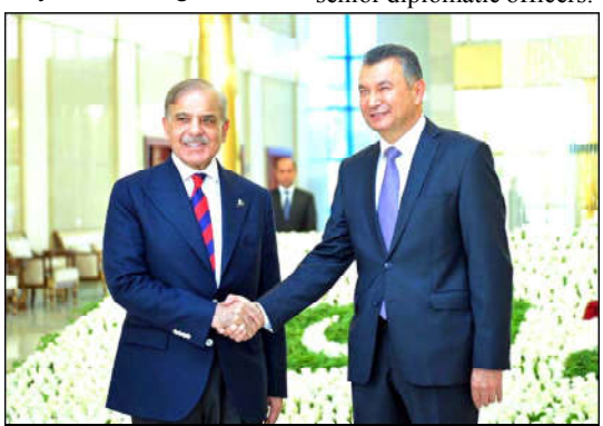
DUSHANBE: Prime Minister Muhammad Shehbaz Sharif meets Prime Minister of Tajikistan H.E. Qahir Rasulzoda at the airport in Tajikistan.