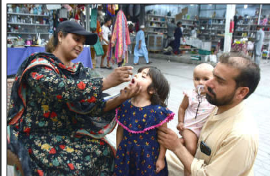
ISLAMABAD: A lady health worker administer polio drops to young children during the year's fifth anti-polio campaign in the Federal Capital.