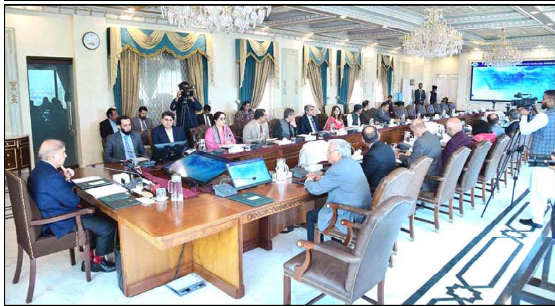
ISLAMABAD: Prime Minister Muhammad Shehbaz Sharif chairs a meeting regarding national preparedness for the monsoon.