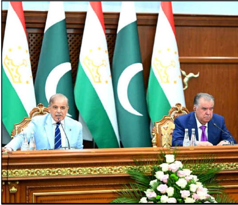
Prime Minister Muhammad Shehbaz Sharif addresses the media in a press conference in Qasr-e-Millat, Dushanbe.

Ph: 2841470/2841473 REG: No. BC-116 B/ID-445 Vol XXV No. 311, Zil Hajj 26, 1445 AH Wednesday July 03, 2024 Pages 08, Price Rs.15