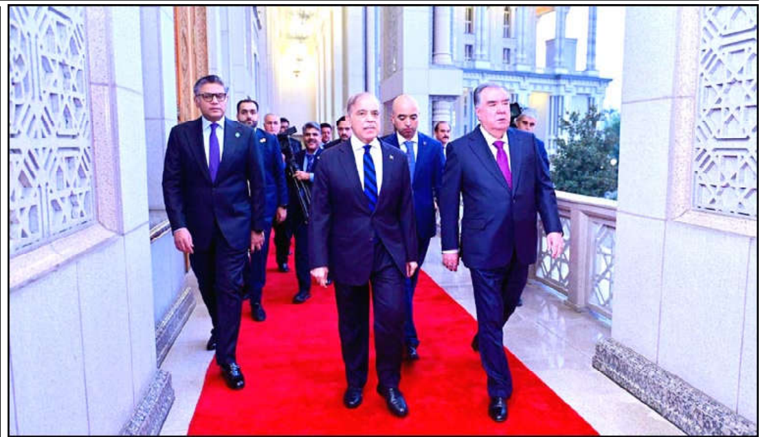
Prime Minister Muhammad Shehbaz Sharif visits the Navruz Palace in Dushanbe.

CJ IHC remarked what such disinformation had come to PEMRA that on the basis of which this happened.