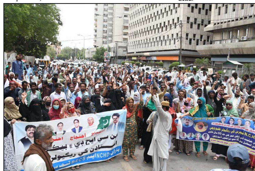
KARACHI: Teachers of Sanghar protesting for the regularization of their jobs at Karachi Press Club in the Provincial Capital.