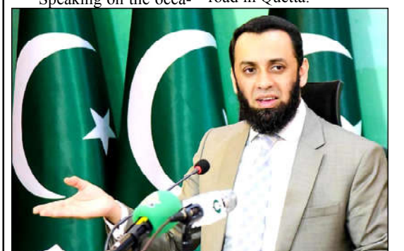
ISLAMABAD: Federal Minister for Information and Broadcasting Attaullah Tarar addressing a press conference.

ISLAMABAD (APP): Federal Minister for Information and Broadcasting Attaullah Tarar addressing a press conference. He said that there is no tax on solar panels, text books, pensioners' income, fertilizers, charitable hospitals and health equipment, and it is all due to the prime minister who wants the nation to be prosperous and self-empowered," he said. The minister said there were multiple sectors on which the tax rates were reduced to 35% from 45%. PM Shehbaz also ensured that the petroleum development levy to be maintained at Rs 60 in the current fiscal year. However, only Rs 10 margin had to