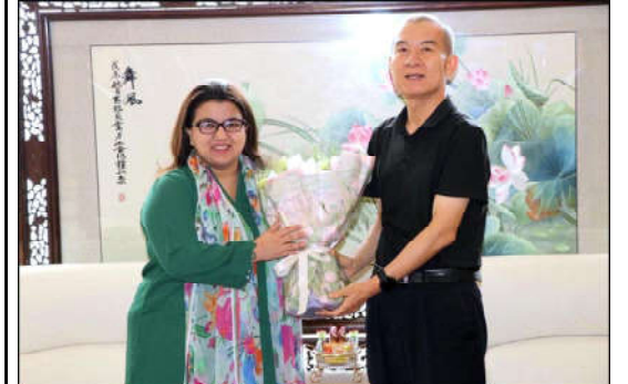
BEIJING: Minister of State for IT and Telecommunication Ms. Shaza Fatima Khawaja arrives in China to participate in Global Digital Economy Conference 2024 being held from July 2-5 in Beijing.

LAHORE (APP): Punjab Food Minister Bilal Yaseen has said that business segments should cooperate with the government for providing relief to people. According to official sources here on Monday, he said that facilitators of profiteers and hoarders deserved no leniency. He said that during the last 24 hours, 629 flour mills, flour dealers and retail shops had been checked. Bilal Yaseen said that 128 places had been checked in Lahore division, 64 in Faisalabad, 30 in Sahiwal, 80 in Rawalpindi division, 74 in Sargodha, 40 in Multan division, 38 in Bahawalpur, 88 in DG Khan, 42 in Gujrat and 45 in Gujranwala. He said that supply of flour was strictly monitored during Sunday holiday. A sufficient stock was available at retail shops and in wholesale markets in Lahore and other big cities of Punjab, he added. He said that due to increase of transportation of wheat in markets it helped to reduce prices. People should lodge their complaint on toll free number 080002345 against those who were illegally selling flour and 'Roti' at higher rates. The Punjab food department had imposed a fine of Rs 470,000 besides issuing warning notices to profiteers and law violators, he said.