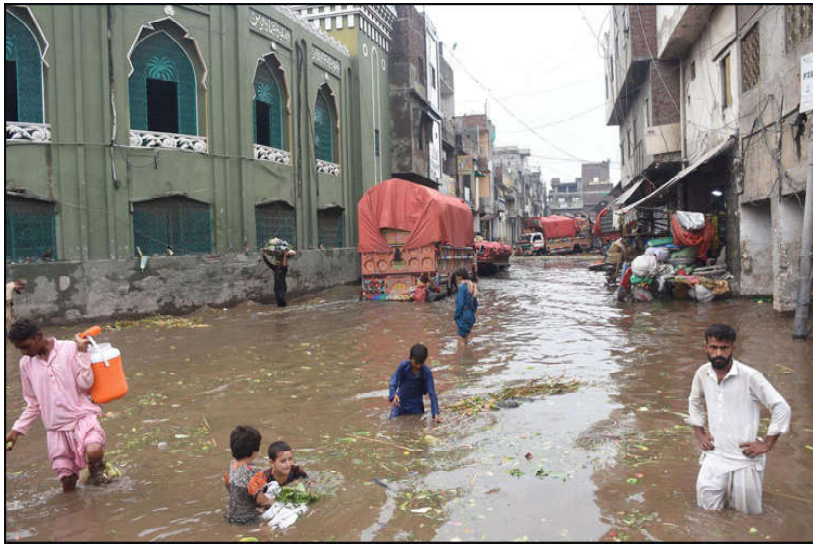
LAHORE: Citizens busy in their routine works and heading towards their destinations in the first rain of monsoon since morning in the provincial capital.