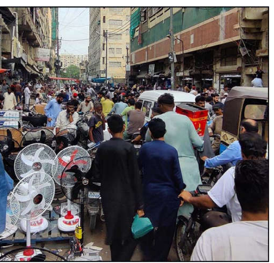
KARACHI: Shopkeeper displaying chargeable fan after demands' increase due to shortage to electric city supply in provincial capital.