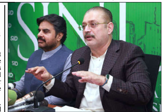
KARACHI: Sindh Minister for Information, Transport, Excise Dept Sharjeel Inam Memon, Minister Syed Nasir Hussain Shah addressing a press conference in the provincial capital.

PESHAWAR (APP): At least two people were killed and three others injured when a vehicle fell into a deep gorge in Upper Kohistan area, police informed on Monday. According to police, five people were onboard the vehicle when it plunged into a deep gorge after its driver lost control over the vehicle in Lotar area of Upper Kohistan. The rescue teams shifted the victims to District Headquarters Hospital Dasu, where doctors pronounced two as dead.