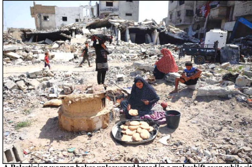
A Palestinian woman bakes unleavened bread in a makeshift oven while sitting on the rubble of buildings destroyed in the Israeli bombardment, as some residents return to the city of Khan Yunis.

medics at Nasser Hospital where the bodies were taken. Artillery shelling also rocked parts of the city, witnesses said. The Israeli military launched a ground operation in Rafah in early May, leading to the closure of a key aid crossing. The United Nations and other relief agencies have voiced alarm over the dire humanitarian crisis and the threat of starvation the Israeli siege has brought for Gaza's 2.4 million people. "Everything is rubble," said Louise Wateridge from UNRWA, the UN agency supporting Palestinian refugees, speaking from the city of Khan Yunis. "There's no water there, there's no sanitation, there's no food. And now, people are living back in these buildings that are empty shells." In Israel, thousands of protesters again took to the streets of Tel Aviv on Saturday, demanding greater efforts to return the remaining prisoners, and calling for early elections.