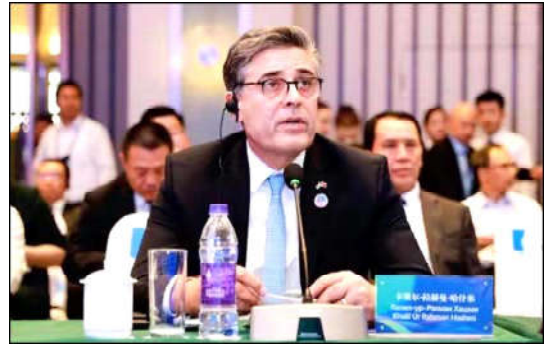
CHINA: Ambassador of Pakistan to China, Khalil Hashmi spoke at China-SCO round table on Digital Connectivity on the sidelines of China-Eurasia Expo. The Ambassador underscored the importance of digital connectivity in the Eurasian region, & Pakistan's potential as a burgeoning digital economy.