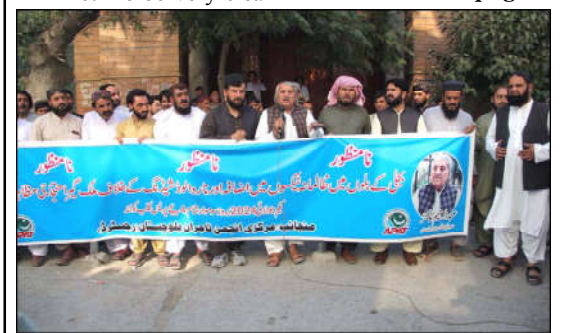
QUETTA: Members of Central Anjuman Tajran Balochistan are holding protest demonstration against taxes and prolong electricity load shedding during summer season, at Quetta press club.