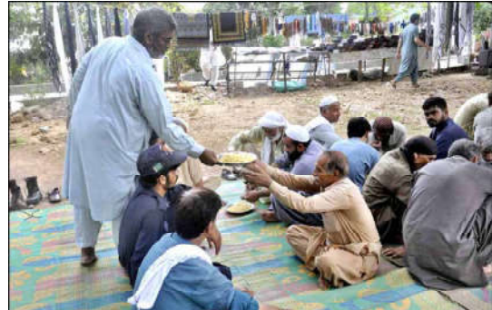
ISLAMABAD: Volunteers distribute free meals to laborers and those in need, ensuring no one goes hungry during challenging times at Aabpara in Federal Capital.