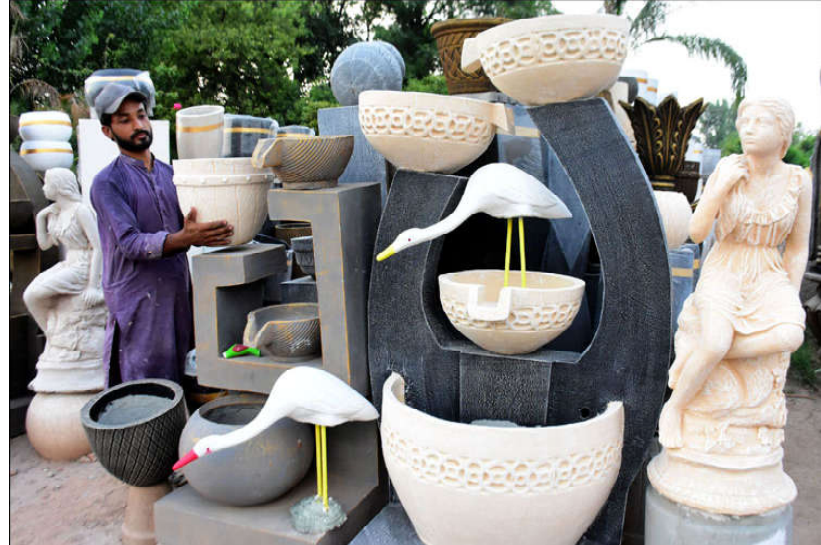
ISLAMABAD: An artisan displaying model and sculptures of different things at Rawal Chowk in the Federal Capital.