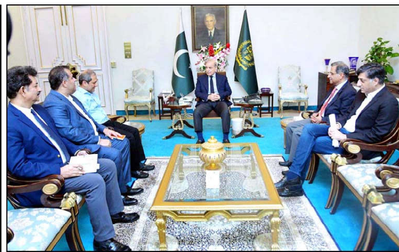
ISLAMABAD: A delegation of leading businessmen calls on Prime Minister Muhammad Shehbaz Sharif.

Hussain further stated that the team on the ground has focused its efforts on repairing the pipeline as soon as possible, with the aim of restoring the gas supply by the next evening.