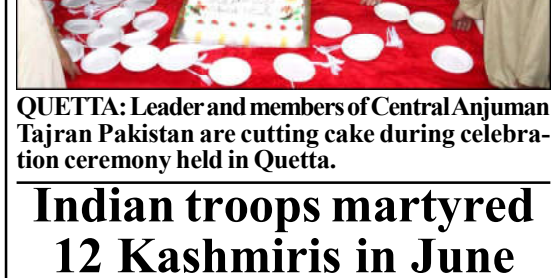
QUETTA: Leader and members of Central Anjuman Tajran Pakistan are cutting cake during celebration ceremony held in Quetta.