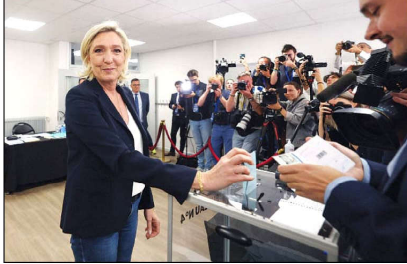
Marine Le Pen, head of the French far-right Rassemblement National parliamentary group in the National Assembly, casts her ballot in the first round of elections in Henin-Beaumont.