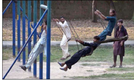
ISLAMABAD: Citizens of the Federal Capital enjoying a moment of leisure on the swings at a public park.