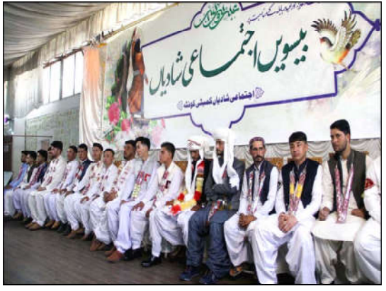
QUETTA: Group photo of grooms during mass marriage ceremony organized by Mass Marriages Committee held in Quetta.