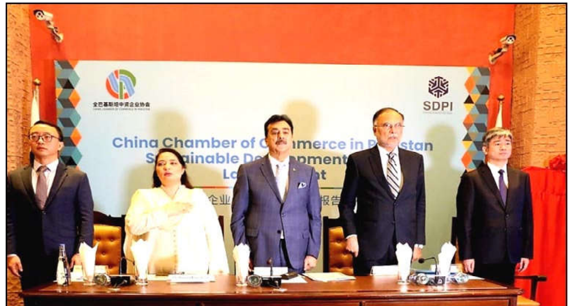
ISLAMABAD: Chairman Senate, Syed Yousaf Raza Gillani attending launching ceremony of the "China Chamber of Commerce Sustainable Development Report 2023" of CCCPK (formerly "All-Pakistan Chinese Enterprises" Association APCEA), co-organized by the Sustainable Development Policy Institute (SDPI) here at the Pakistan Institute for Parliamentary Services (PIPS) Hall.

inclusivity. "Pakistan lauds President Xi Jinping's commitment and funding of $100 billion for Greening BRI for eco-friendly development. Chinese banks play a fundamental part in greening of the CPEC projects, pivotal for development and environmental protection. Both countries are eager for collaborative green initiatives such as green bonds, concessional financing, and Just Energy Transition Partnerships (JETPS). I urge Chinese to work out solutions to improve access to these financing tools and initiate all economic transactions in Chinese RMB instead of USD," Gillani said.