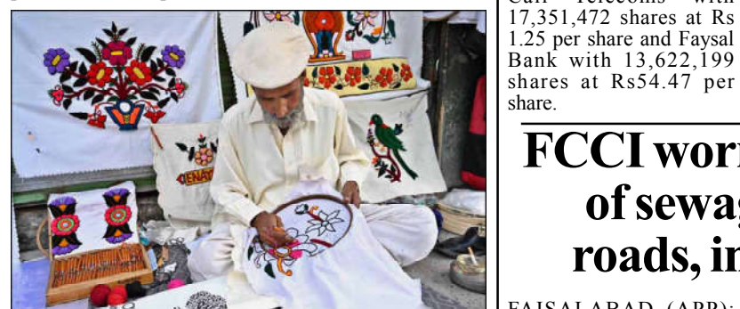
GILGIT: A worker busy in embroidery work on pillow and bed sheet at his setup.