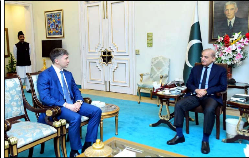
Ambassador of Kazakhstan to Pakistan H.E. Yerzhan Kistafin calls on Prime Minister Muhammad Shehbaz Sharif in Islamabad