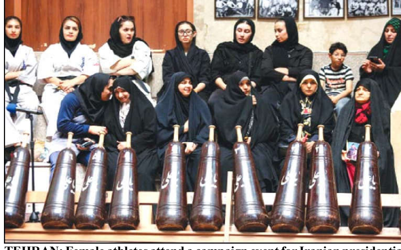
TEHRAN: Female athletes attend a campaign event for Iranian presidential candidate Saeed Jalili at a Zurkhaneh, a traditional gymnasium, during a campaign event.