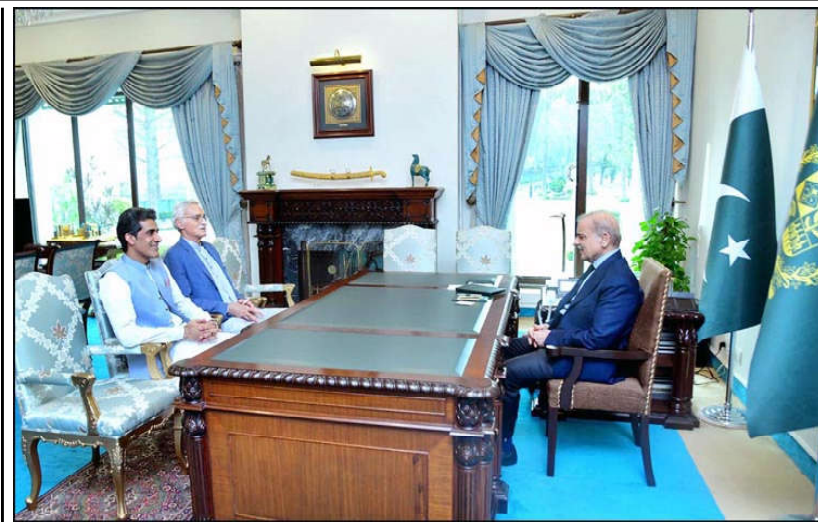
ISLAMABAD: Businessman and member of Economic Advisory Council Jahangir Khan Tareen along with MNA Aoun Chaudhary called on Prime Minister Muhammad Shehbaz Sharif.