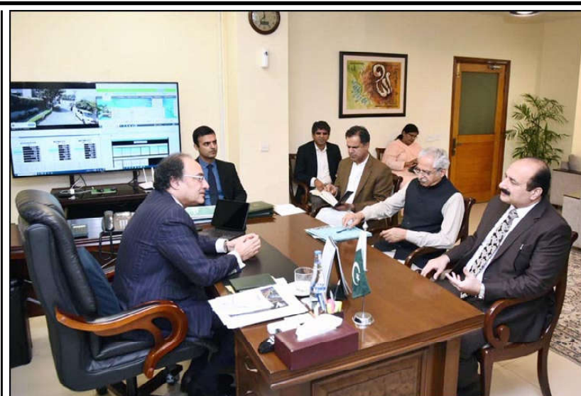
ISLAMABAD: Federal Minister for Finance and Revenue Senator Muhammad Aurangzeb in a meeting with the Chairman Prime Minister's Youth Programme Rana Mashhood Ahmad Khan.

According to the official spokesperson for Zong 4G, "Keeping the evolving demands of our customers, Zong's new Online Booking Portal and Home Delivery Service innovates the customers experience.