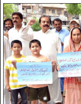
HYDERABAD: Members of Human Rights Commission of Pakistan (HRCP) are holding protest demonstration against arrest of Asad Butt, Chairman HRCP at Hyderabad press club.

the Commissioner on various city improvement measures in their respective districts. Other Deputy Commissioners shared their efforts via video link. Food department officials also attended the meeting and briefed the commissioner on the measures to check the quality of milk and other food items and prevent the sale of adulterated or unhealthy food. The meeting reviewed and decided that Food department officials would check the food quality with the concerned district administration officials. In the meeting, it was decided that Deputy Commissioners will take action to solve the problems of encroachments, parking, billboards.