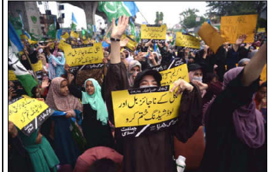
RAWALPINDI: Leaders and activists of Jamat-e-Islami (JI) are holding protest demonstration against massive unemployment, increasing price of daily use products and inflation price hiking of electricity and petrol, at Liaquat Bagh in Rawalpindi.

Almighty to elevate the ranks of the departed soul in Jannah and to grant patience to the family members of the martyr to bear this loss with courage. The joint operation of the security forces proved that the terrorists cannot escape from the officers and soldiers who are determined to defend their homeland, the prime minister added. He said the nation stood by its security forces until the menace of terrorism was completely uprooted from the country. The prime minister said the entire nation, including me, pays tribute to the security forces for their unwavering determination to defend the country, he added.