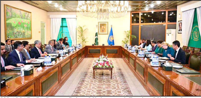
ISLAMABAD: Deputy Prime Minister and Foreign Minister Senator Mohammad Ishaq Dar holds meeting with Secretary General of the Commonwealth Patricia Scotland at the Ministry of Foreign Affairs.

He further observed that these ties were further strengthened by Pakistani diaspora, which was acting as a bridge between Pakistan and UK, thus providing solid foundation for a dynamic and prosperous partnership. He said that our historic legacy, shared values and mutual goodwill were the ingredients for a strong partnership between Pakistan and UK.