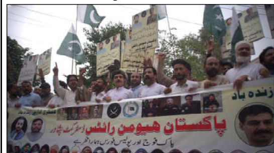
PESHAWAR: Activists of Human Rights Association hold protest outside PPC.

also having adverse effect on the agricultural sector of the country. Sardar Saleem Haider Khan said federal and provincial governments are working on various projects to deal with the issue of climate change. He said Pakistan has plenty of renewable energy resources. He said that there is a need to bring people towards solar energy to deal with the energy crisis. The Governor informed the British High Commissioner about the efforts to solarize the Governor House Lahore and universities of Punjab. He hailed the British government for the water management program started in different districts of Punjab. British High Commissioner Jane Marriott, speaking on the occasion.