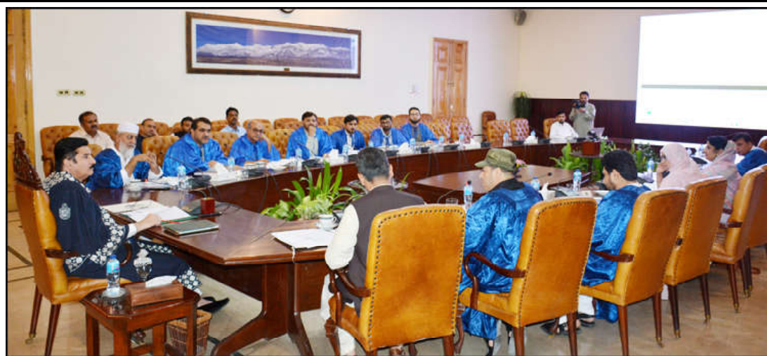
PESHAWAR: Governor Khyber Pakhtunkhwa Faisal Karim Kundli presides over the 4th senate meeting of the University of Agriculture D.I.Khan at Governor House.

corruption complaints from citizens. The KP Zakat and Ushr (Amendment) Bill 2024 facilitates the collection of Ushr from landowners, lessees, or occupants. The Assembly Secretariat Employees Terms and Conditions of Service Bill 2024 was referred to the Select Committee, chaired by Law Minister Aftab Alam, with the Deputy Speaker and Advocate General as members. The government proposed amendments to the Police Act 2017, including changes in the recruitment process for Assistant Sub-Inspectors and increasing the quota for police martyrs' families from 5% to 12.5%. The Assembly also adopted several resolutions. PPP Parliamentary Leader Ahmad Kundli highlighted the deteriorating law and order situation.