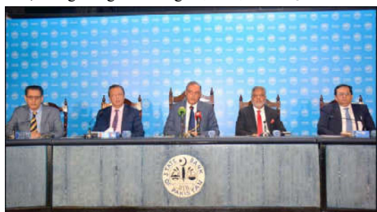
KARACHI: Governor State Bank of Pakistan (SBP) Jameel Ahmed announce Monetary Policy during press conference at State Bank of Pakistan.

lic-private partnership and their renewable electricity supplied through Sindh Transmission and Dispatch Company (STDC) were two key pillars of the plan of the Sindh government being executed to reduce the consumer-end tariff. He said the solar parks were being built in Sindh to deliver on the poll manifesto promise of the Pakistan Peoples Party of providing 300 units of free electricity to the destitute consumers.