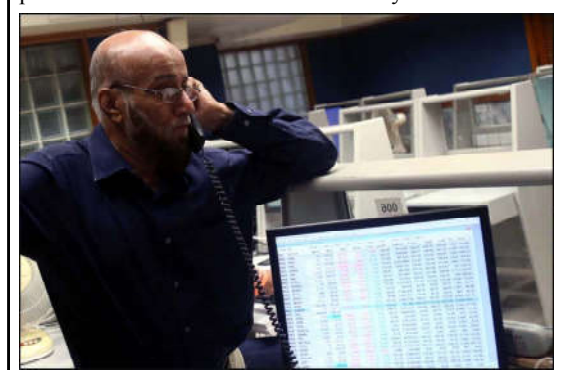
KARACHI: Brokers are busy in trading at Pakistan Stock Exchange (PSX) in Karachi.

The discussion covered the current structure of the scheme, including its three operational tiers, and explored the potential benefits and logistics of introducing additional tiers. They underscored the government's commitment to enhancing opportunities for the youth and promoting sustainable business development across the country.