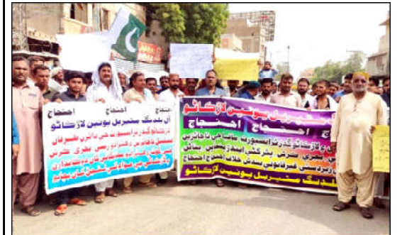
LARKANA: Members of All Building Material Union are holding protest demonstration against the high handedness of Goods Transport, at Jinnah Bagh in Larkana.