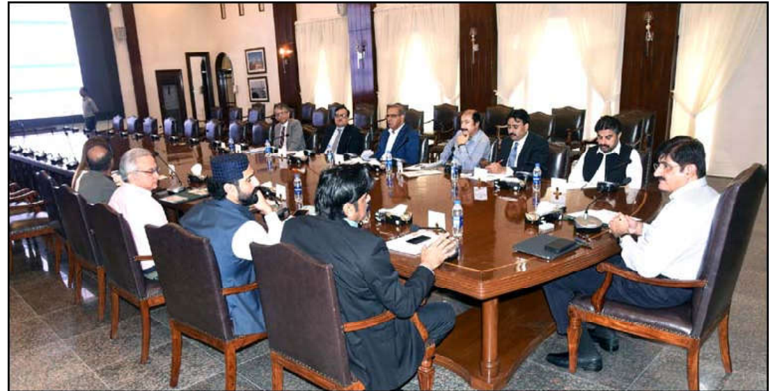
KARACHI: Sindh Chief Minister, Syed Murad Ali Shah presides over a joint Agriculture and Irrigation department meeting, held at CM House in Karachi.