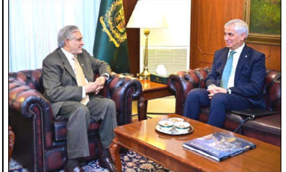
Secretary General ECO, Ambassador Khusrav Noziri called on Deputy Prime Minister and Foreign Minister Senator Mohammad Ishaq Dar at the Ministry of Foreign Affairs Islamabad.

He emphasized that both countries have a longstanding partnership.