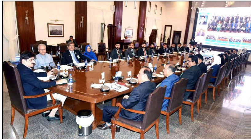
KARACHI: Sindh Chief Minister, Syed Murad Ali Shah in a meeting with a 31-member delegation of Probationers 7th Civil Service Training Program (CSTP) of the Training Management and Research Wing (TMR) held at CM House in Karachi.

in which climate-resilient development, economy and policies were being developed. "We are going to launch a massive stormwater drain system to combat urban flooding in the city," he said and added he has also restored old waterways discharging into the LBOD system. Syed Murad Ali Shah said that he was working to improve the agro-economy of the province by introducing new climate-resilient crops, developing tourism in PPP mode, and promoting the industrial sector. The CM extended his best wishes to the newly inducted and trained officers.