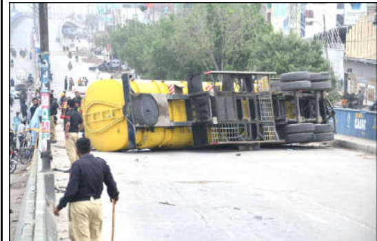
KARACHI: An oil tanker overturned at the Baloch Colony flyover, rescue workers and other officials are seen standing at the spot.