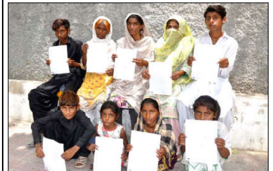
HYDERABAD: Residents of Badin are holding protest demonstration against kidnapping of a girl and demanding recovery of her as soon as possible, at Hyderabad press club.