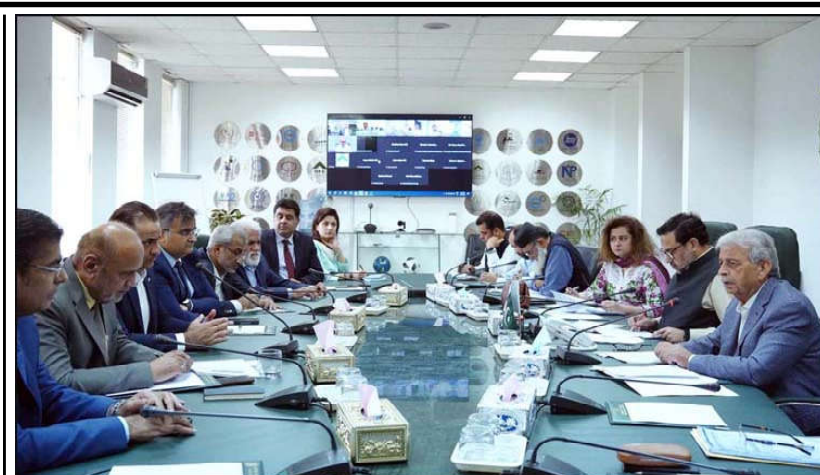
ISLAMABAD: Federal Minister for Industries and Production, Rana Tanveer Hussain presided over a meeting of the Sugar Advisory Board (SAB).

Meanwhile two more ships, Gulf Diamond and Epic Sunter scheduled to load/offload Rice and LPG are also arrived at outer-anchorage of the Port Qasim on today early morning. A total of seven ships were engaged at POA berths during the last 24 hours, out of them three ships, EF Emma, Hafnia Seine and Al-Thakira left the port on today morning while another ship "Fisher" is expected to sail on today afternoon. Cargo volume of 53,395 tonnes, comprising 42,570 tonnes imports cargo and 10,825 tonnes export cargo carried in 315 Containers (315 TEUs Imports).