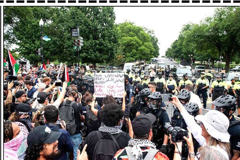
Riot police confront pro-Palestinian demonstrators as they protest near the US Capitol as Israeli Prime Minister Benjamin Netanyahu addresses a joint meeting of Congress.

who formed a circle around several people who were arrested. One person grabbed at a police officer's riot shield and then raised his fists in a fighting stance. An officer was seen grabbing a Palestinian flag from a woman and tossing it aside. At least one protester appeared to be overcome from the effects of pepper spray. Cheers rang out as a fire burned what appeared to be a papier-mache likeness of Netanyahu. Protesters spray painted graffiti on a monument to Christopher Columbus, including the words, "Hamas is coming" in large red letters. "Free Gaza" was scrawled in green. Among the protesters was a group of artists from Baltimore displaying a massive papier-mache sculpture meant to depict President Joe Biden with blood on his hands and devil horns.