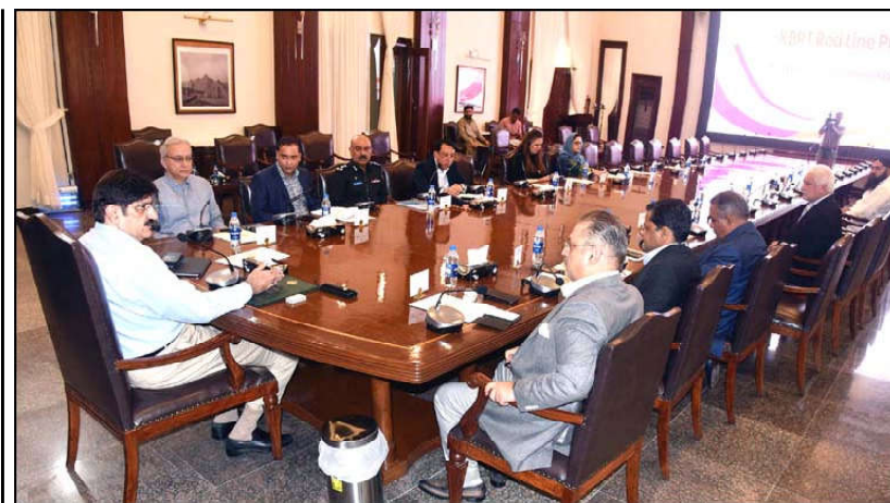
KARACHI: Sindh Chief Minister, Syed Murad Ali Shah presides over a meeting to review progress on the BRT Red Line Project held at CM House in Karachi.

Also, Mehboob Shah, Junaid Akbar, Ali Khan Jadoon, Asad Qaiser, Shahram Khan, Mujahid Ali, Anwar Taj, Fazal Mehmood Khan, Arbab Ameer Ayub have been declared as successful candidates of PTI.