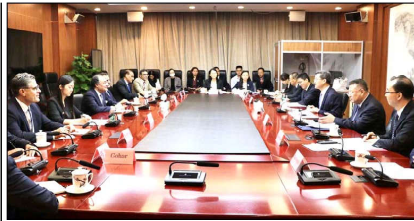
BEIJING: Senator Muhammad Aurangzeb, Federal Minister for Finance & Revenue and Sardar Awais Ahmad Khan Leghari, Minister for Energy (Power Division) in a bilateral meeting with Chinese Minister of Finance Lan Fo'an.

He has further said that the district administration has been told that it is difficult to remove the oil tanker from the site until and unless it is completely emptied. "As long as the tanker is there, the fire brigade staff will remain at the site," he has informed.