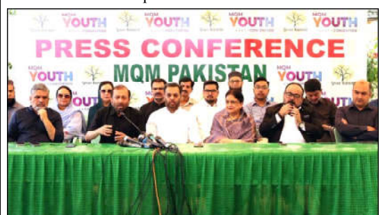
KARACHI: Muttahida Qaumi Movement (MQM-P) Leaders, Farooq Sattar, Mustafa Kamal and others addressing to media persons during press conference held at Pakistan House in Karachi.