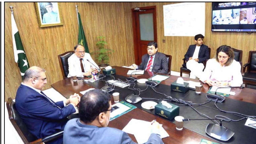
ISLAMABAD: Federal Minister for Planning, Development, and Special Initiatives, Ahsan Iqbal chaired a high-level meeting with provincial planning ministers.