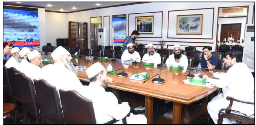
KARACHI: A delegation of Bohra Jamaat meeting with Sindh Governor Kamran Khan Tessori at governor house.