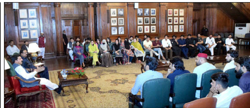
LAHORE: The students of various universities called on Chancellor/Punjab Governor Sardar Saleem Haider Khan here at Governor House.

Responsibility (CSR) funds to provide solar systems, these communities can gain access to sustainable and cost-effective energy solutions. This move is expected to promote sustainable energy practices, reduce dependency on conventional power sources, and alleviate financial burdens on underprivileged families, while also supporting environmental conservation efforts in the region, he added. Special attention was directed towards the communities in Karak, a district noted for its significant natural gas extraction activities. The Governor emphasized that Karak, being a major contributor to the province's natural gas output, should see targeted development initiatives.