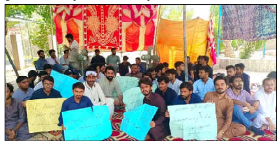
LARKANA: Students of Chandka Medical College are holding protest demonstration for acceptance of their demands held at college premises in Larkana.

The DS Pakistan Railways informed that they were facing issue of shortage of sanitary staff amid heavy work load at the station as all the trains arriving at the station used to