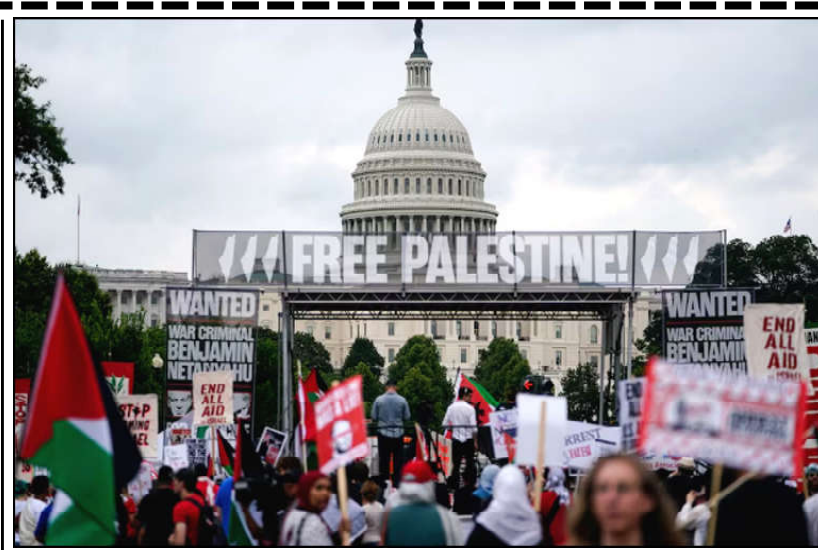
Pro-Palestinian demonstrators gather on the day of Israeli Prime Minister Benjamin Netanyahu's address to a joint meeting of Congress, on Capitol Hill in Washington, U.S.

Only 22pc of voters assessed Biden that way. Biden, 81, ended his reelection effort after a debate with Trump in which he often stammered and failed to aggressively challenge attacks by Trump that included falsehoods.