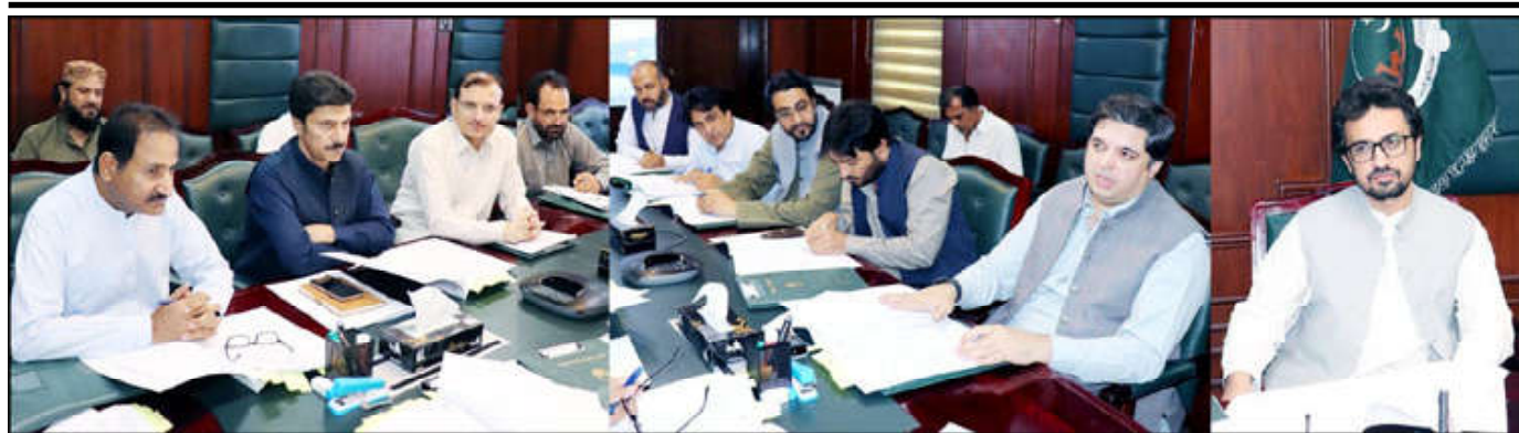
QUETTA: Provincial Minister for Finance Mir Shoaib Noshervani presides over the 7th meeting of Local Councils Finance Commission.