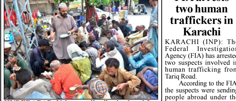
HYDERABAD: Volunteer distributing breakfast among the deserving people at Fort Road.