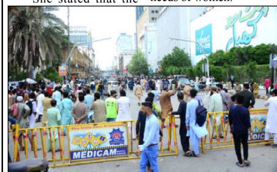
KARACHI: Residents of City Railway Colony protest for their demands on II Chandegar Road, in the Provincial Capital.