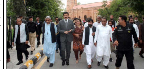
PESHAWAR: Khyber Pakhtunkhwa Governor Faisal Karim Kundi visiting the Saint Jan Cathedral Church at Cantt area.

the PTI leader manipulated the RTS system to rig the 2018 elections, thereby imposing his leadership on the country. She also accused him of engaging in digital terrorism, damaging the nation's reputation through foreign conspiracies, and advising the IMF against providing financial assistance to Pakistan in 2022, pushing the country towards economic hardship. The minister labeled May 9 as a dark day in the country's history, accusing the PTI of inciting violence and targeting government properties.