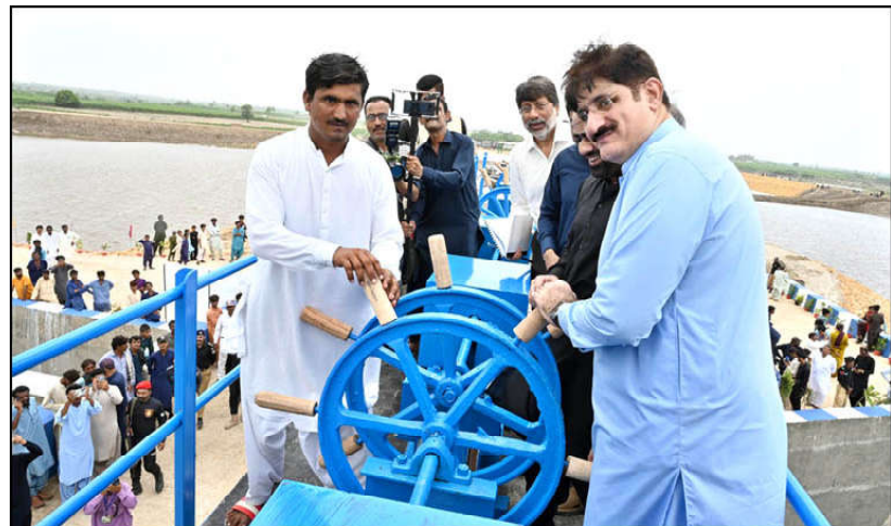
BADIN: Chief Minister Sindh Syed Murad Ali Shah starting newly constructed regulator of spinal drain of LBOD at RD210 near Shadi Large.

Chairman PMYP said that the steps taken to empower the youth under the Sindh Governor's Initiative are commendable. He further said that by providing funds for IT courses and business, the talents of the youth can be utilized.