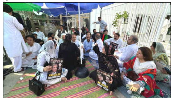
ISLAMABAD: Member Parliament from Opposition benches stage hunger strike camp outside Parliament House in the Federal Capital.

I wish the courts were open on 5 July 1977, when Ziaul Haq removed the elected prime minister," he said.