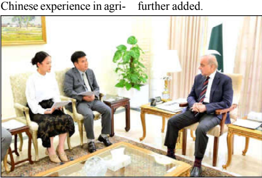
ISLAMABAD: A delegation of Hangeng Trade Company calls on Prime Minister Muhammad

The company was also exporting pharmaceutical products to China after processing them at Gwadar Free Zone, it was