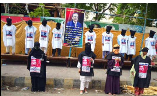
KARACHI: Members of Jamshoro Sujag Forum are holding protest demonstration to mark the 5th July 1977 as Black Day, at Karachi press club.

In its response to the appeal, HEC cited Section 7(g) of the Right of Access to Information (RTI) Act, 2017, asserting that the sought information is exempt from disclosure as it could potentially lead to the harassment of individuals, particularly female scholars.