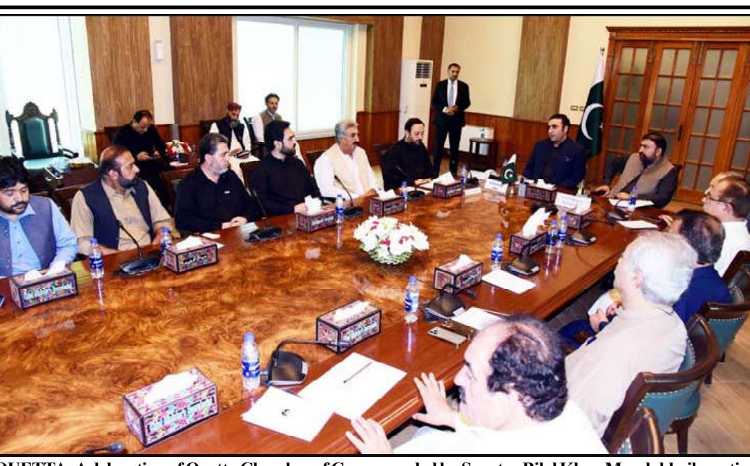
QUETTA: A delegation of Quetta Chamber of Commerce led by Senator Bilal Khan Mandokhail meeting with Chairman PPP Bilawal Bhutto Zardari. Balochistan Chief Minister Mir Sarfraz Bugti and Provincial Ministers are also present.