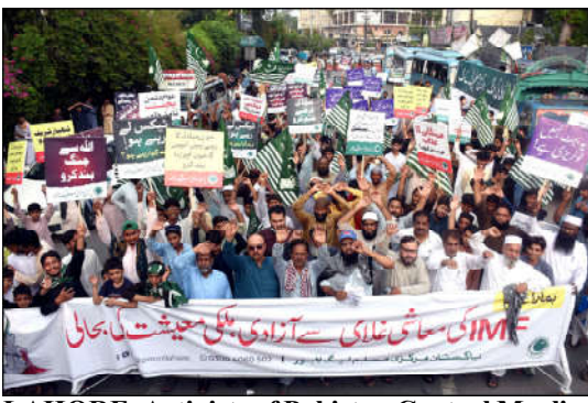
LAHORE: Activists of Pakistan Central Muslim League hold a protest against inflation in Pakistan, outside press club in the Provincial Capital.

approved setting up a support unit with two-year tenure to increase the efficiency of electricity distri-