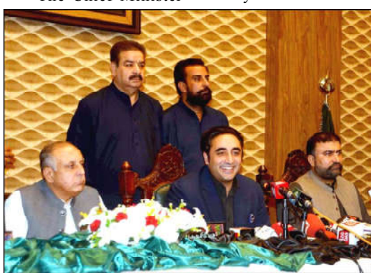
QUETTA: PPP Chairman Bilawal Bhutto Zardari along with Balochistan Chief Minister Mir Sarfraz Bugti addressing a press conference at CM House.

ers of the party. The PPP Chairman while addressing news con-ference emphasized the need for developing consensus on the national issues terming it crucial for continuity of the democratic process and stability of the