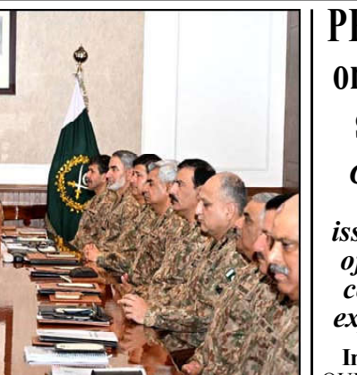
RAWALPINDI: Chief of Army Staff General Syed Asim Munir presiding

scarcity and drought. The project would also increase resilience to floods and disasters. The decarbonisation of the economy aims to provide access to cleaner and more sustainable energy while reducing air pollution from sources such as trans