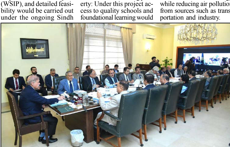
Prime Minister Muhammad Shehbaz Sharif chairs a meeting of Cabinet Committee on Energy in Islamabad.

expressed support for the project, which is estimated to cost around $300 million. Additionally, the Pre-feasibility of modernisation of right bank canals of Sukkur Barrage was carried out under the Sindh Water Sector Improvement Project (WSIP), and detailed feasibility would be carried out