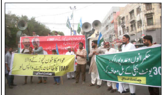
KARACHI: Jamaat-e-Islami workers protesting against the budget and electricity prices at Regal Chowk, in the Provincial Capital.

society. He directed officers concerned to ensure all arrangements ahead of Muharam ul Haram including cleanliness drive, availability of lights and other arrangements so that people particularly mourners do not feel any inconvenience. He appealed ulema and religious leaders belonging to different sects to show tolerance, cohesion, interfaith harmony and peace during the sacred month and keep a vigilant eye on miscreants and extremists to avert an untoward incident during Ashura days.