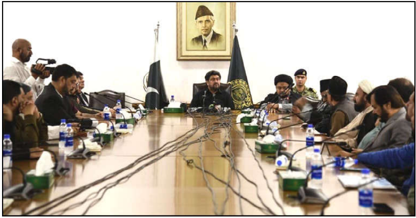
KARACHI: Governor Sindh Kamran Khan Tessori addressing a Press conference after a meeting held in connection with Muharamul Haram at Governor House.