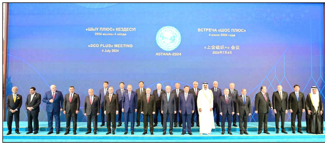
ASTANA: Prime Minister, Muhammad Shehbaz in a group photo with the Shanghai Cooperation Organization Plus Summit, held in Astana.

It was agreed that, following the provincial government's directives, full compliance with existing laws and codes of conduct would be ensured, with strict action against violators. The meeting participants also pledged their cooperation in identifying individuals spreading religious hatred and violence. They expressed their satisfaction with the security arrangements for Muharram-ul-Haram.