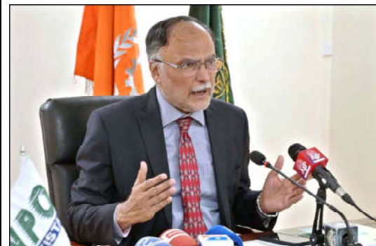
ISLAMABAD: Federal Minister for Planning Development & Special Initiatives, Ahsan Iqbal addressing to media during his visit at National Productivity Organization (NPO) Office.

During the weekly media briefing, the spokesperson emphasized that the report overlooks Pakistan's efforts to ensure religious freedom and does not aid in promoting human rights.