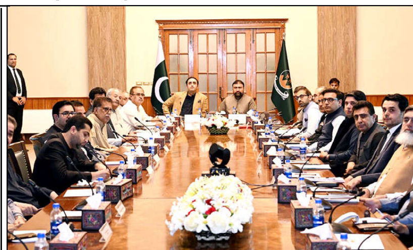
QUETTA: Chairman PPP Bilawal Bhutto Zardari presiding over a meeting at Chief Minister's House. Chief Minister Balochistan Mir Sarfaraz Bugti, Provincial Ministers, and senior officials provided briefings on health, education, law and order, and other flagship programs.

He said that in order to prevent drug and human trafficking, the two countries will have to strengthen mutual cooperation and there will be no compromise on human trafficking and all possible steps are being taken to control it.