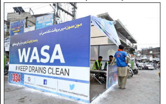
RAWALPINDI: Water and Sanitation Agency (WASA) establish Flood Response Unit at Guwalmandi near Nullah Lai as pre-monsoon spell is expected to start from Thursday to Sunday and assured that all necessary arrangements have been made in this regard by Rawalpindi Development Authority (RDA).