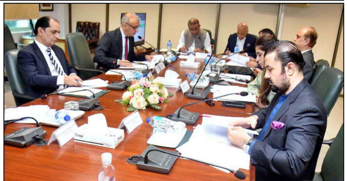
ISLAMABAD: Federal Minister for Privatisation / Chairman Privatisation Commission, Abdul Aleem Khan chairing 220th meeting of the Privatisation Commission Board.

meeting and a negotiation session was held with business group interested in purchase of the HBFC along with the officers of the Privatization Commission. Minister for Privatization Abdul Aleem Khan directed that all proposals for privatization should be opened in front of cameras in the presence of the media so that there should be no question on its transparency. Finance Minister Muhammad Aurangzeb and Law Minister Azam Nazir Tarrar also emphasized on the privatization.