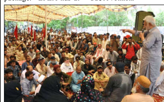
HYDERABAD: Members of All Pakistan Wapda Hydro Electric Workers Union are holding protest demonstration for acceptance of their demands, in Hyderabad.

Underlining the vital role of EPZs in export expansion he mentioned that a total of 9 EPZs were operational in Pakistan and contributing 3 to 4 % in exports. He hoped that the new concept for Private and Public Participated EPZs would encourage many potential investors to establish SEZs in any area of Pakistan. Saifuddin Junejo stressed the need of expansion of Karachi Export Processing Zone from its current area of 300 acres to the area of 3000 acres as per the original plan and said the present area is very small as compared to other such zones in the region. Referring to free zone of Jabal-e-Ali in UAE he said that it spreads over 15,000 acres and its trading volume last year was recorded as US$104 billion.