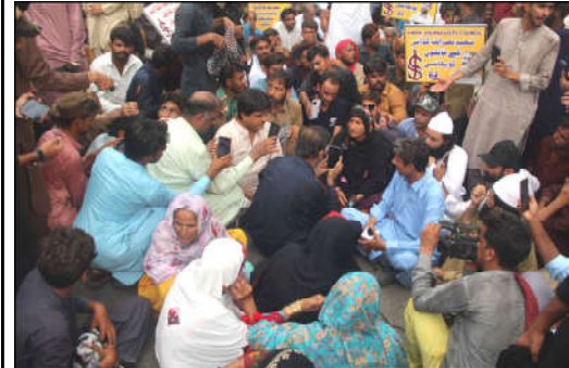
KARACHI: Teachers from Interior Sindh protest in front of Sindh Assembly in the Provincial.

KMC and other stakeholders would ensure the availability of dewatering pumps and machinery.