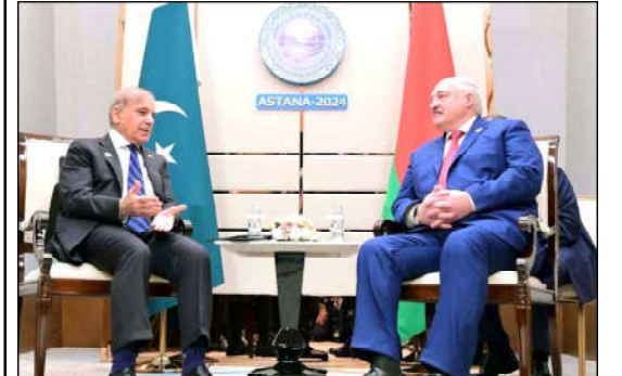
ASTANA: Prime Minister Muhammad Shehbaz Sharif meets with President of the Republic of Belarus H.E. Aleksandr Lukashenko on the sidelines of Shanghai Cooperation Organisation Summit.

Prime Minister Shehbaz congratulated President Lukashenko on Belarus' membership of the SCO underlining that this would further strengthen the organization. He highlighted Pakistan's policy of economic revival through export-led growth, strengthening of public finances, and attracting investment from friendly countries. The two leaders also discussed global and regional developments and reviewed progress on various aspects of work under the Shanghai Cooperation Organization (SCO). The prime minister shared Pakistan's efforts and desire for a peaceful and stable region.