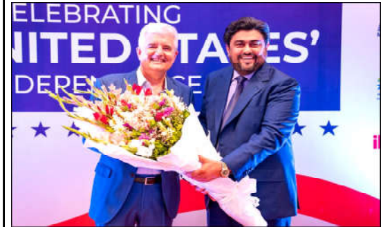
KARACHI: Governor Sindh Kamran Khan Tessori presenting a bouquet to Consul General Conrad Tribble during a ceremony at US Consulate in connection with Independent Day of America.

The CM also mentioned that the ongoing projects, including Coal to Gas fertilizer, Keti Bandar Park of 10,000 MW, and Dhabaji Special Economic Zones, would help ensure the economic security of the country once they are commissioned.