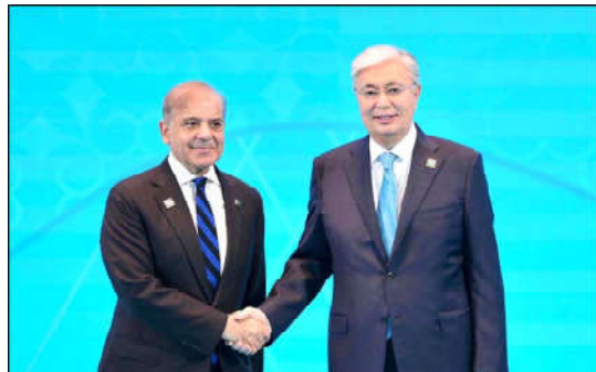
ASTANA: Prime Minister Muhammad Shehbaz Sharif is being received by President of Kazakhstan H.E. Kassym-Jomart Tokayev as he arrives at the Independence Palace of Astana to attend Shanghai Cooperation Organisation Summit.

The prime minister said that Astana held significance for Pakistan where the country had formally joined the SCO in 2017 and congratulated Belarus for being the newest member.