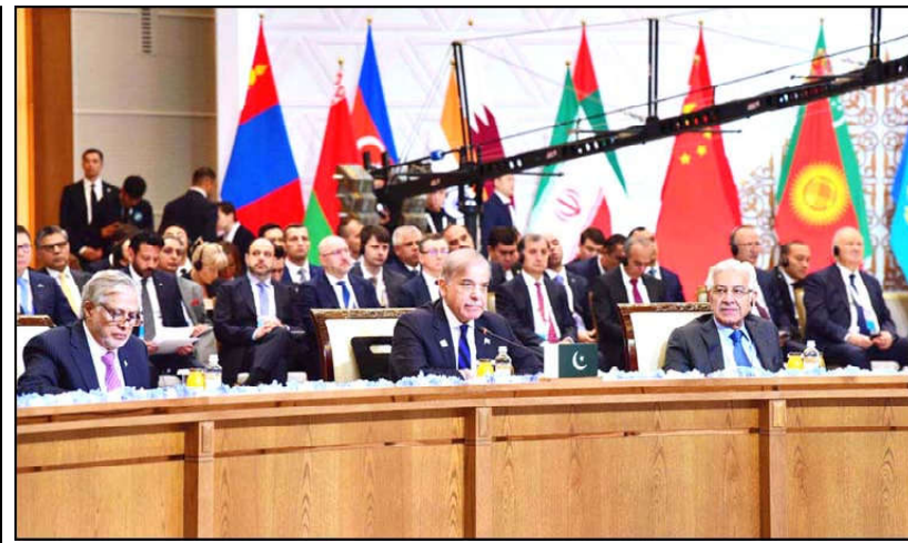
ASTANA: Prime Minister Muhammad Shehbaz Sharif delivers a National Statement at Shanghai Cooperation Organisation Summit.

of the under privileged people of tribal areas. He remained an active member of the Senate of Pakistan and also served as the Chairman of the Senate Standing Committees on Aviation, Communications, Industries and Production and also as member of various other Standing Committees. He was well respected and widely liked by amongst all members. The late Senator always took active part in debates on important legislation and other issues of national and public importance. The services rendered by him would be long remembered and his loss will be deeply mourned. The House resolves that the Federal and Provincial Governments take urgent and effective measures to combat the resurgent threat of terrorism in the country. We all share the loss sustained by his family and friends and expresses the deepest sympathies with the bereaved family.