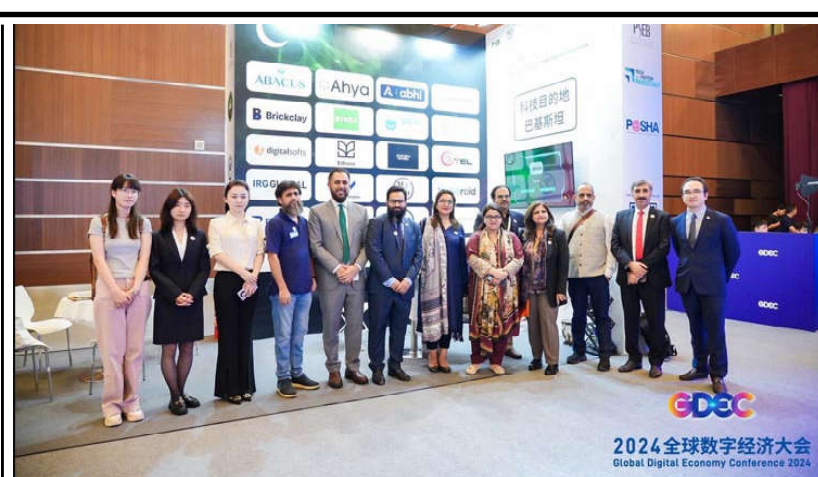
Minister of State for IT and Telecommunication Ms. Shaza Fatima Khawaja in a group photo following visiting booths of different tech companies on the occasion of Global Digital Economy Conference 2024 in Beijing.