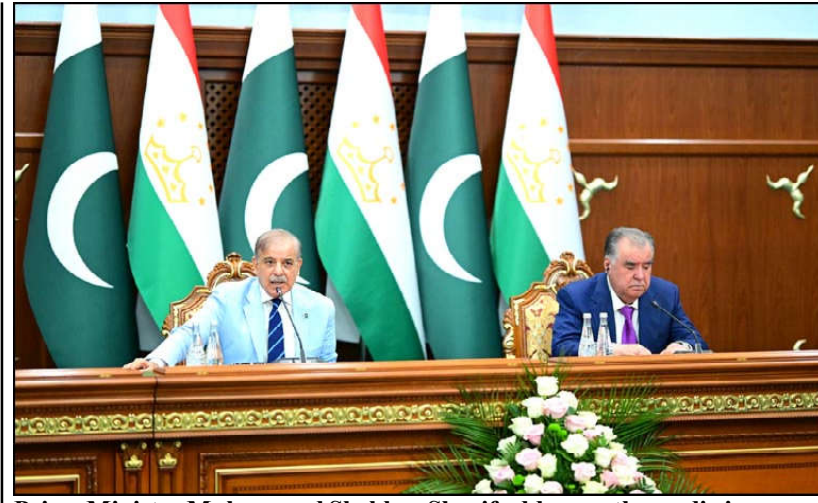
Prime Minister Muhammad Shehbaz Sharif addresses the media in a press conference in Qasr-e-Millat, Dushanbe.

Prime Minister Shehbaz Sharif also referred to another MoU pertaining to relaxation of visas requirements and said that it would be very helpful for both countries in further achieving their goals. The prime minister said the two brotherly countries had been the victims of terrorism; Pakistan faced this menace for years and paid a huge price in terms of human lives and of course, suffered from colossal economic losses to the tune of billions of dollars.