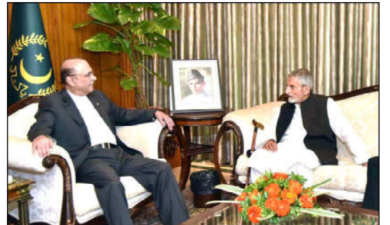
ISLAMABAD: Former Federal Minister and senior leader of the Awami National Party, Mr Ghulam Ahmed Bilour, called on President Asif Ali Zardari, at Aiwan-e-Sadr.

Justice Athar Minallah remarked Attorney General it is not simple appeal. It is case of rights of people. You want we declare the misinterpretation of EC correct.