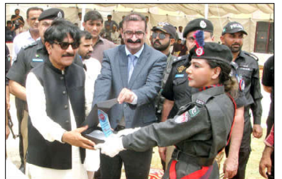
HYDERABAD: Sindh Minister for Prisons, Ali Hassan Zardari, presented shields to the position holders during the passing out parade ceremony of the 18th basic training course for prison constables and lady prison constables at the Sindh Prisons Staff Training Institute.

The IG directed to arrange a contingency plan to maintain law and order during the holy month.