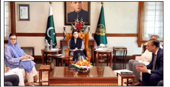
LAHORE: Chief Minister Punjab Maryam Nawaz chairing a special meeting to review amendments to the proposed laws and rules for establishment of the Punjab Enforcement Regulatory Authority