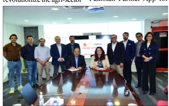
payment ecosystem. This collaboration aims to drive financial inclusion and economic empowerment for farmers, who are predominantly unbanked, enabling them to actively participate in the formal economy. Furthermore, by leveraging Fatima Fertilizer's extensive dealer network, this initiative will provide farmers with a seamless and accessible platform to manage their finances, receive payments.