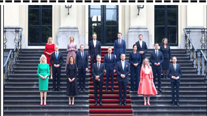
Dutch King Willem-Alexander and Prime Minister Dick Schoof pose with the new members of the Dutch Government at Palace Huis ten Bosch in The Hague, Netherlands.

position leaders expressed outrage and insisted Abu Salmia played a role in Hamas' alleged use of the hospital — though Israeli security services rarely unilaterally free prisoners if they have a suspicion of militant links. Prime Minister Benjamin Netanyahu's office called the release "a grave mistake." Monday's evacuation call covered the entire eastern half of Khan Younis and a large swath of the Gaza Strip's southeast corner. Earlier in the day, the army said a barrage of rockets out of Gaza was fired from Khan Younis. The order suggested a new assault into the city was imminent. Israeli forces fought for weeks in Khan Younis earlier this year and withdrew, claiming to have destroyed Hamas battalions in the city.