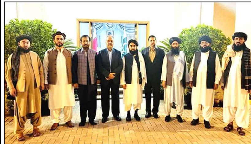
Afghan Taliban delegation, Pakistani diplomats pose for a group photo on sidelines of Doha-III conference.