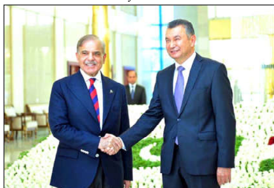
DUSHANBE: Prime Minister Muhammad Shehbaz Sharif meets Prime Minister of Tajikistan H.E. Qahir Rasulzoda at the airport in Tajikistan.

He further said that creating awareness of sports for healthy activities was a commendable act.