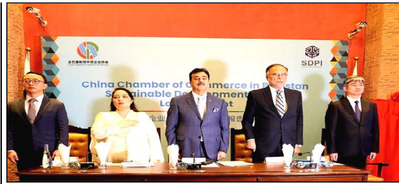
ISLAMABAD: Chairman Senate, Syed Yousaf Raza Gillani attending launch ceremony of the "China Chamber of Commerce Sustainable Development Report 2023" of CCCPK (formerly "All-Pakistan Chinese Enterprises' Association APCEA"), co-organized by the Sustainable Development Policy Institute (SDPI) here at the Pakistan Institute for Parliamentary Services (PIPS) Hall.