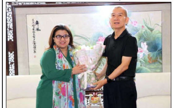
BEIJING: Minister of State for IT and Telecommunication Ms. Shaza Fatima Khawaja arrives in China to participate in Global Digital Economy Conference 2024 being held from July 2-5 in Beijing.

of Rs 470,000 besides issuing warning notices to profiteers and law violators, he said.