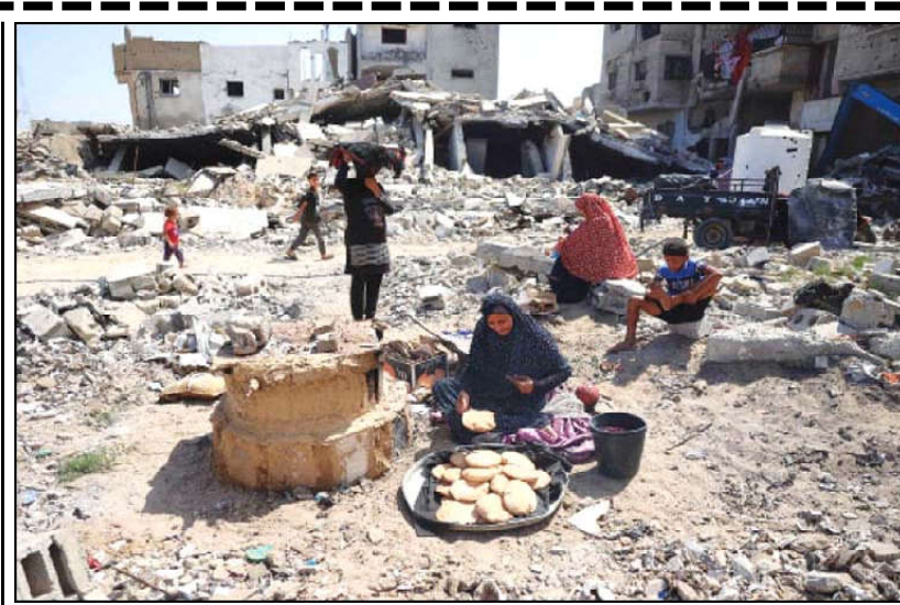
A Palestinian woman bakes unleavened bread in a makeshift oven while sitting on the rubble of buildings destroyed in the Israeli bombardment, as some residents return to the city of Khan Yunis.

The Israeli military said ground and air forces had carried out raids on compounds used by fighters and "eliminated several terrorists" over the past 24 hours. It also reported clashes in central Gaza and the southern Rafah area, a week after Prime Minister Benjamin Netanyahu declared that the "intense phase" of the offensive that started on October 7 was nearing an end. The United Nations humanitarian agency OCHA estimated that "60,000 to 80,000 people were displaced" from Shujaiya since new fighting broke out there on Thursday and the army issued evacuation orders.