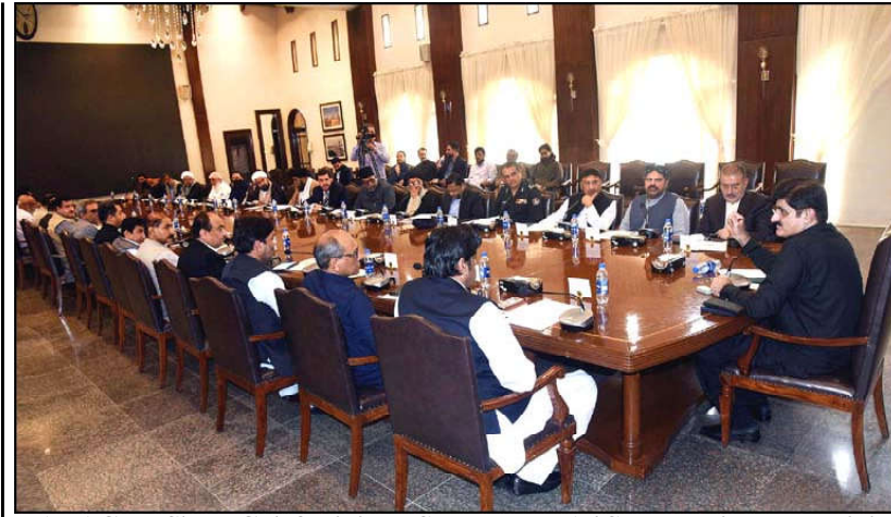
KARACHI: Sindh Chief Minister, Syed Murad Ali Shah presides over a joint meeting with administration and religious scholars to finalise arrangements for Muharram-ul-Haram held at CM House in Karachi.

The Ulema pointed out the problem of load-shedding in their areas and requested the CM to direct K-Electric not to resort to load-shedding during the month of Muharram, particularly from Muharram 1 to 12. On this, the CM directed KE representatives to ensure an uninterrupted power supply to the masjid, and majaalis.