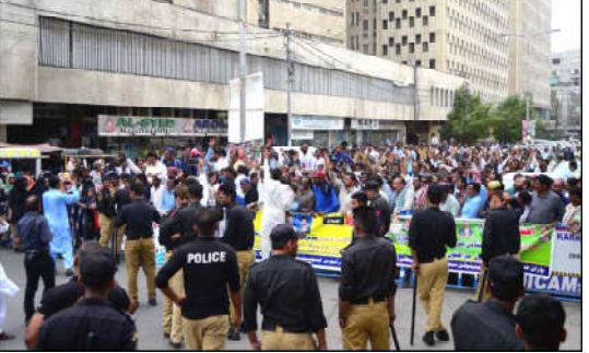
KARACHI: Police officials barricade protesters when they tried to move towards red zone area during the protest demonstration of Basic NCHD Teachers Committee Sindh for acceptance of their demands, nearby Karachi press club.