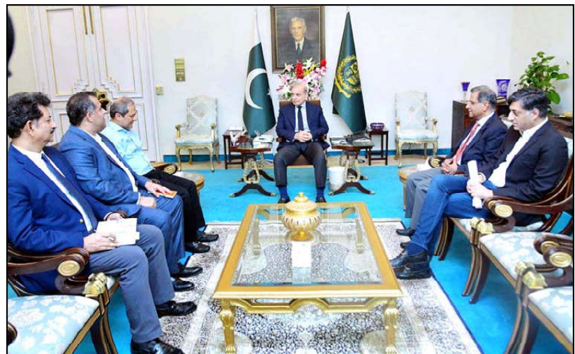
ISLAMABAD: A delegation of leading businessmen calls on Prime Minister Muhammad Shehbaz Sharif.

He said he was looking forward to his meeting with President Tokayev during his upcoming visit to Astana for the Shanghai Cooperation Organization (SCO) Council of Heads of State meeting on July 3-4.