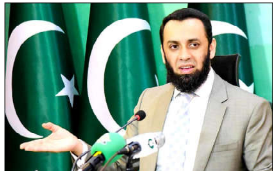
ISLAMABAD: Federal Minister for Information and Broadcasting Attaullah Tarar addressing a press conference.

The minister said the provision of Rs 38 per unit electricity to exporters was a major relief for industry, clarifying that the exports dividends were only taxed in the budget.