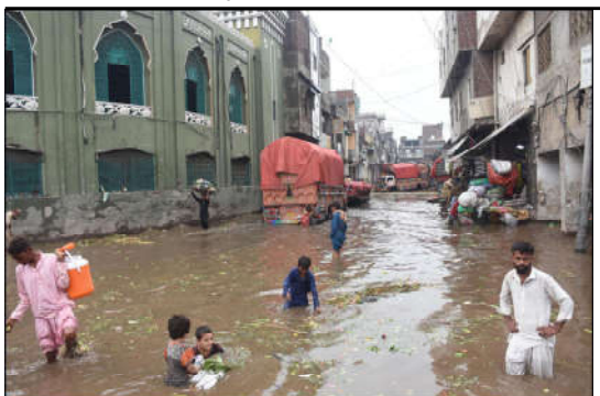
LAHORE: Citizens busy in their routine works and heading towards their destinations in the first rain of monsoon since morning in the provincial capital.