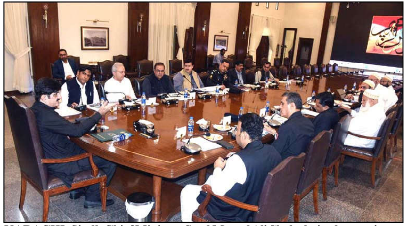
KARACHI: Sindh Chief Minister, Syed Murad Ali Shah chaired a meeting to review the arrangement for the arrival of Bohra Jamat Spiritual Leader Syedna Mufaddal Saifuddin held at CM House in Karachi.