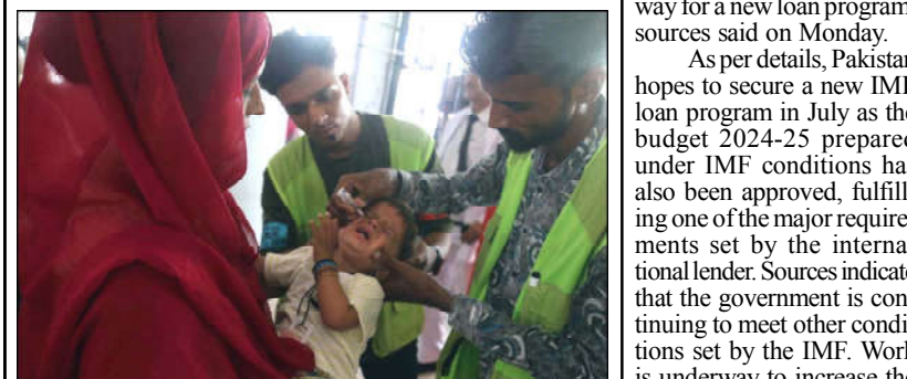
KARACHI: Health worker administers polio vaccine drops to a child during anti-polio immunization campaign, at Cantt Railway Station in Karachi.

Nasir Shah said that the Sindh government has also set up a parliamentary committee to review public complaints regarding K-Electric and to redress them and it is reviewing the abuses done to the public regarding load-shedding and over-billing and was in constant contact with K-Electric to resolve the complaints and several meetings have also been held in this regard. Minister said whatever committee the conference will form, the government will also take this committee on board. In order to review the public complaints, I also made a detailed visit to the Central Load Dispatch Center of K-Electric last night and found out the details regarding the load management and told K-Electric that if it is absolutely necessary, it should do load shedding during the day time but not load shedding between 12:00 am and 6:00 am.