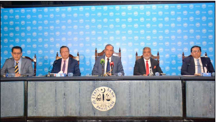
KARACHI: Governor State Bank of Pakistan (SBP) Jameel Ahmad announce Monetary Policy during press conference at State Bank of Pakistan.