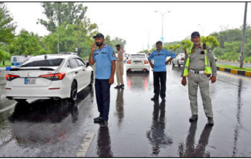
ISLAMABAD: Police personals stands alert and checking vehicles at police check post on Srinagar Highway due to security high alert in the Federal Capital.

were also shut down for failing to implement the required anti-dengue measures. These closures are part of a broader effort to ensure compliance with health regulations aimed at preventing the breeding of dengue-carrying mosqui-The Assistant Comtoes