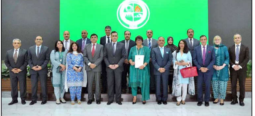
ISLAMABAD: H.E. Patricia Scotland, Secretary General of the Commonwealth of Nations in a group photograph during visit the National Emergen-cies Operation Center (NEOC) at NDMA Headquarters.