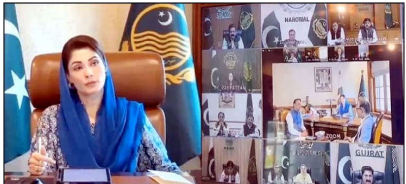
LAHORE: Punjab Chief Minister Maryam Nawaz Sharif chairs meeting regarding launching of prosperity survey "Ab Ho Ga Sub Ka Shumar" in the province.

immediate elections are the only solution to the political turmoil. Ayub further announced a meeting the next day where decisions regarding a sit-in at D-Chowk would be made. Asad Qaiser condemned the severe crackdown on their supporters, questioning the dignity of parliamentarians are humiliated in this manner. He urged the Supreme Court to take suo motu notice of the forced resignations of 41 MNAs and called on his lawyers to approach the SC, questioning the governance of the country under such conditions. Qaiser announced that decisions regarding protests would be made in their meeting, with plans for large demonstrations across the country on August 5. He highlighted that this date would mark one year of the PTI founder's imprisonment and urged the public to protest against inflation and the illegal arrest of the PTI founder.