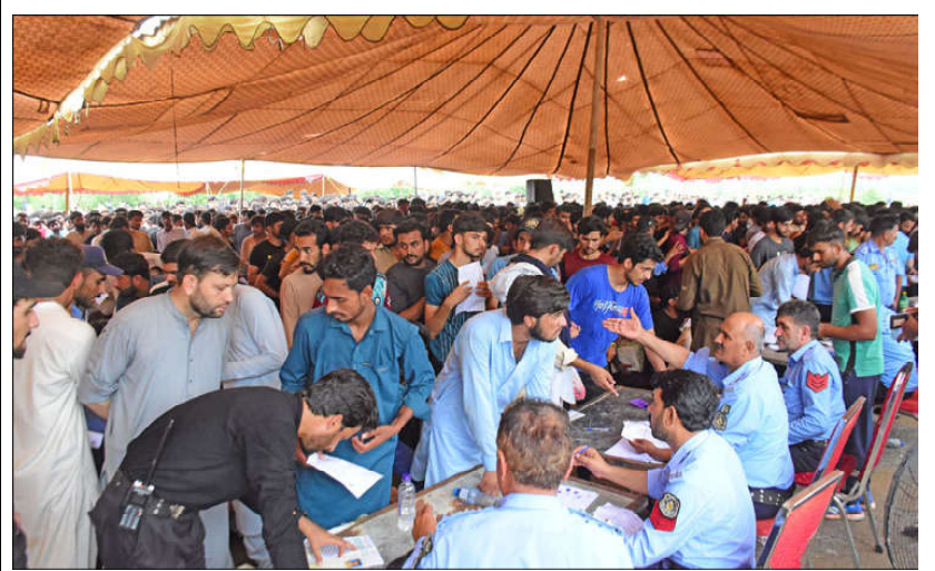
ISLAMABAD: Youth line up for registration to participate in the in the race on Jinnah Avenue for recruitment in Islamabad Police.

Experts like Martino Miraglia and Riccardo Maroso from UN-Habitat presented on SDG localization and VLRs. They noted the growing global movement of VLRs, with cities worldwide using them to track and report on SDG progress. UN-Habitat views VLRs as crucial accelerators for localizing the Sustainable Development Goals, offering opportunities for peer learning, capacity building, and international engagement. The training highlighted the joint efforts of UN-Habitat and CDA to equip Pakistani cities, starting with Islamabad, with the tools and knowledge necessary to achieve sustainable urban development. CDA, responsible for implementing the Islamabad Master Plan, has committed to aligning all its projects with SDG-11 by 2030.