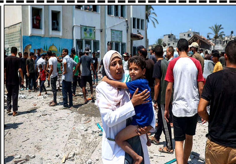
Palestinians inspect the damage following an Israeli strike on the Khadija school housing displaced people in Deir al-Balah, in the central Gaza Strip.

people running towards the place that was struck. The people sheltering in Khadija school are all wounded people, they are innocent and this should not happen to them," she said. On Saturday, the military said it had instructed Palestinians to evacuate the southern neighborhoods of Khan Younis and move to the Al-Mawasi humanitarian zone. Israeli attacks in Khan Younis on Saturday killed 14 people, health officials said. UN and humanitarian officials accuse Israel of using disproportionate force in the war and of failing to ensure civilians have safe places to go, which it denies. In the Israeli-occupied West Bank, Nabil Abu Rudeineh, spokes-person for Palestinian President Ma-h--moud Abbas, blamed the Israeli attacks on the support of the US.