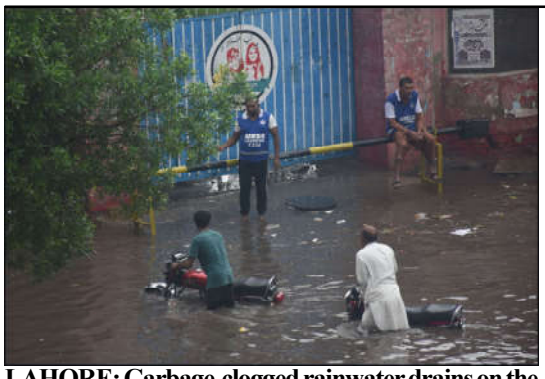
LAHORE: Garbage-clogged rainwater drains on the roads are a testimony to the inefficiency of the WASA.

from his people. "Perhaps they forgot that despite their strategies, Allah also has a strategy. Alhamdulillah, my leader returned, his disqualification was overturned, and the people gave him the mandate. Despite all conspiracies, Pakistan and its largest province, Punjab, are governed by Nawaz Sharif today," she concluded.