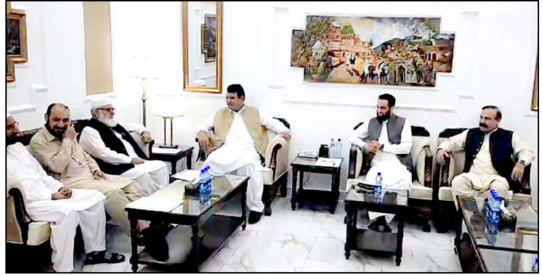
RAWALPINDI: A view of meeting with Government team and Jamaat-e-Islami delegation

cation of Liaquat Bagh was fixed, adding that the people were facing difficulties due to road closure. The minister informed that a technical committee comprising Minister of Power, Secretary Power, FBR and Finance Ministry representatives, had been formed which would hold next round of talks with the representatives of Jamaat-e-Islami. "We will make efforts to resolve the issue amicably today," he informed.