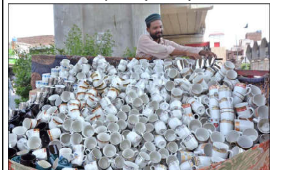
MULTAN: A vendor is busy displaying tea cups at roadside setup to attract the customers.

He directed officers concerned to bring more improvement in performance related to the cotton crop. He said that as per the vision of the CM Punjab Maryam Nawaz Sharif, 62 Farmer Facilitation Centres have been established across the province and the number of centres would be increased after consultation with the public representatives.