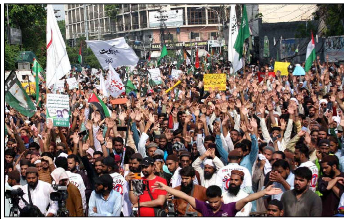
LAHORE: Leaders and members of Tehreek-e-Labbaik Pakistan (TLP) are holding protest demonstration against the Supreme Court Pakistan, nearby Lahore press club.