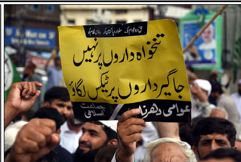
RAWALPINDI: Activists of Jamaat-e-Islami hold placard and chanting slogans during 3rd day of sit in protest (Dharna) against the country's rising inflation, at Murree road, in the city.

He said the country's financial system is unable to support new development initiatives which is the job of the development banks and not the commercial banks. For instance, to promote the agriculture sector the government should revive ZTBL with the help of Chinese investors which is lying redundant through capital and experts.