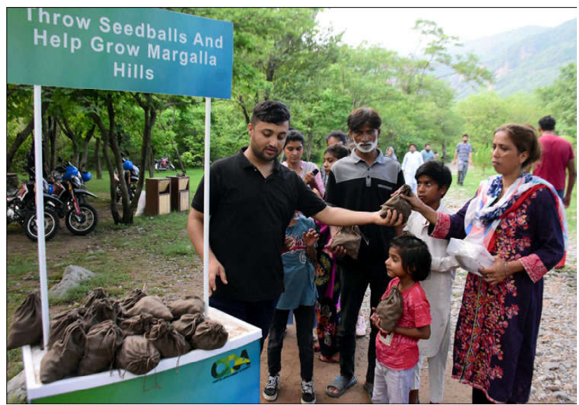
ISLAMABAD: A plantation drive titled 'Throw and Grow' initiative started by CDA and PTC to enhance greenery in Islamabad's renowned Margalla Hills. The entrance points of Trail 3 and Trail 5, stalls offering seedballs made from native species like Sukhchain, Pine, and others in the Federal Capital.

He recalled that during his tenure as Punjab Chief Minister, the Pakistan Kidney & Liver Transplant Institute project.