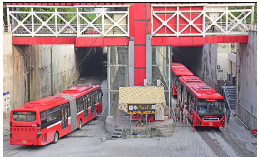
ISLAMABAD: Metro bus service has been partially reopened after three days in the Federal Capital.

Suleman Bilal, a local area resident told APP that it is a usual practice during morning and evening durations when the incinerator starts working and emits thick dark smoke, making the air unbreathable for all. "The incinerator is next to the hospital where the Paeds ward, burn centre, and cafeteria are in its closest proximity where massive visitors are present.