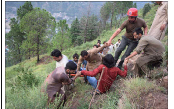
MUZAFFARABAD: Rescue 1122 officials transferring injured people to hospital with the help of people of the area.

welfare of the people. "Selling the land acquired for the educational complex is a violation of the relevant laws," he said, adding that under the law, a piece of land once acquired for a project should be used for that specific purpose. He said that the bid to sell the land was a classic example of the PTI's poor economic management. He said that this would set a bad precedent and would open a Pandora's box. "This shows the PTI has miserably failed to run the economic affairs of the province and it has now started selling off the provincial assets," he maintained. Expressing concern over the deteriorating law and order in various parts of the province, the QWP leader said the local administration in Kurram tribal district.