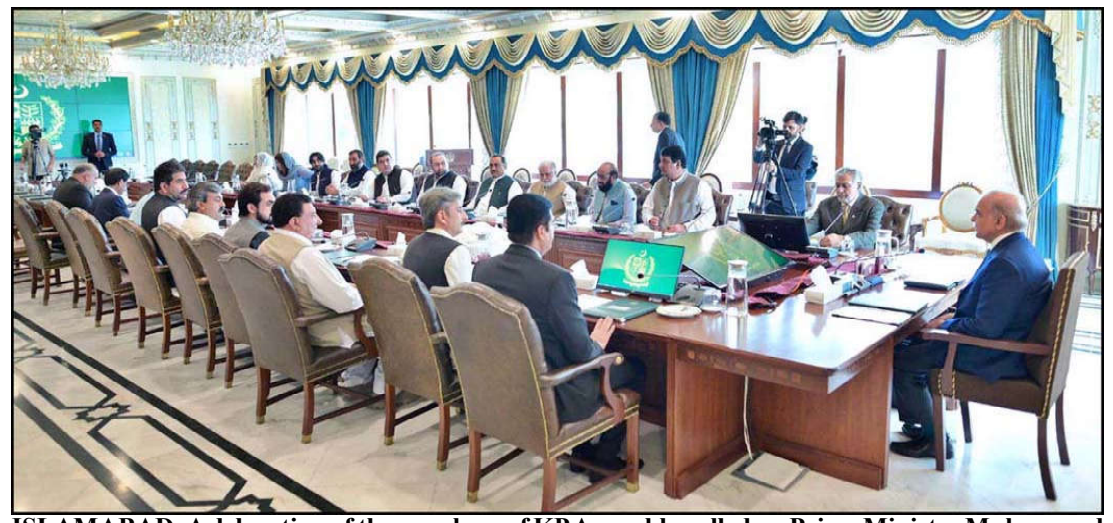
ISLAMABAD: A delegation of the members of KP Assembly called on Prime Minister Muhammad Shehbaz Sharif.

On the occasion, he also announced the formation of a committee, chaired by the Deputy PM, to find sustainable solutions to the problems faced by the elected representatives of Khyber Pakhtunkhwa.