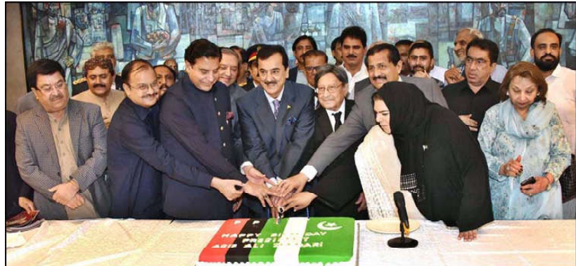
ISLAMABAD: Chairman Senate, Syed Yousuf Raza Gilani, Former Speaker National Assembly, Raja Pervaiz Ashraf, Senator Saleem Mandviwalla and parliamentarians cutting cake to celebrate birthday of President of Islamic Republic of Pakistan Asif Ali Zardari at Parliament House.