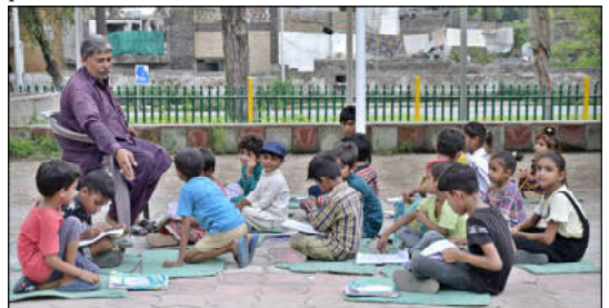
ISLAMABAD: A dedicated teacher instructs children from surrounding slums in a makeshift school near F-6 in the Federal Capital.

He stressed that the government's primary responsibility is to serve the people and ensure the country's progress and stability, and it will not be swayed by political pressure or vested interests.