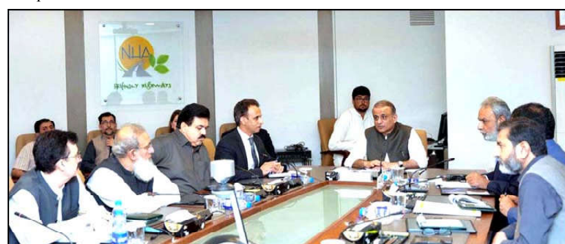
ISLAMABAD: Federal Minister for Communications, Privatization and Board of Investment, Abdul Aleem Khan chaired a high-level meeting of the National Highway Authority.

Regarding the construction of highways and roads in the northern region, Abdul Aleem Khan said that the construction of the Gilgit-Khunjrab Motorway could prove to be a game changer by providing access to China and Central Asian States similarly land connectivity through road and rail up to Gwadar is of very important.