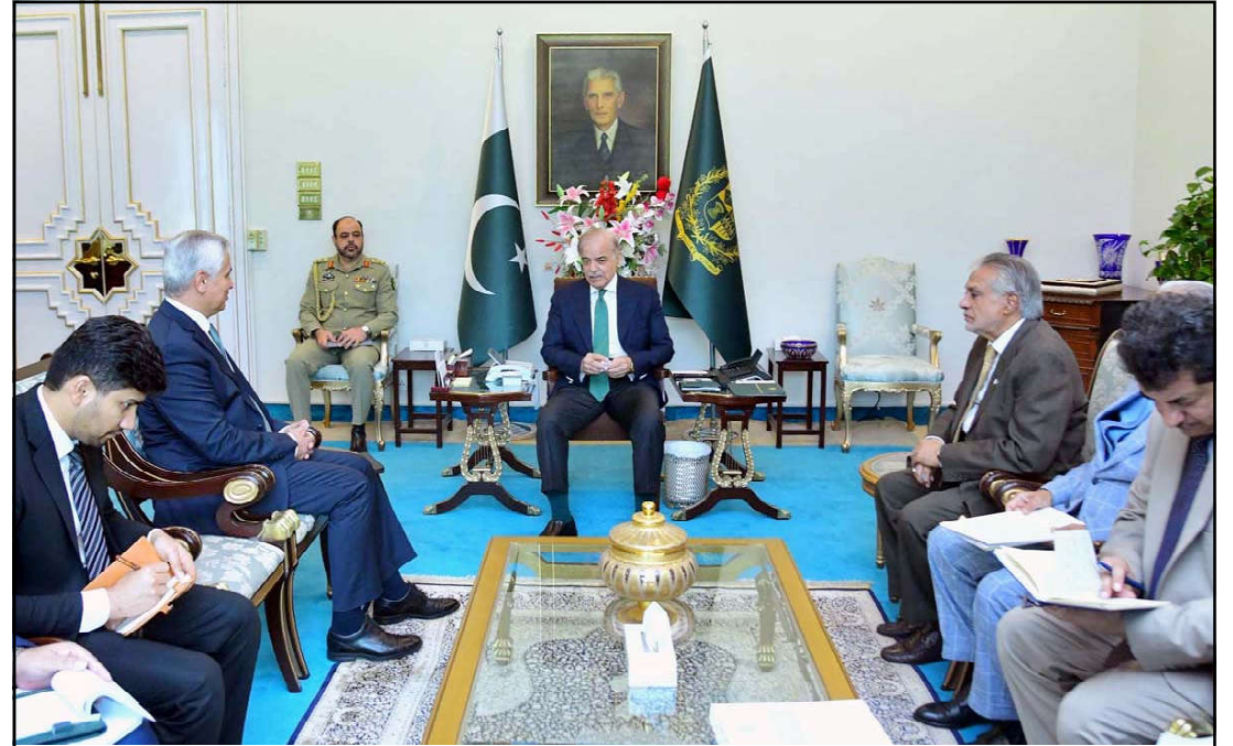
ISLAMABAD: Outgoing Secretary General of ECO H.E. Khusrav Noziri called on Prime Minister Muhammad Shehbaz Sharif.

The PTI MNAs who have been notified by the ECP were those who had shown their party affiliation with the Imran-founded party in their nomination papers before the 2024 general elections.