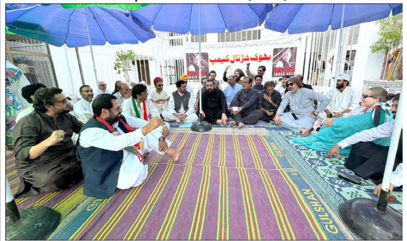
ISLAMABAD: Member Parliament from Opposition benches stage hunger strike camp outside Parliament House in the Federal Capital.

"In today's world, the competition has shifted from pen literacy to digital literacy, intellect and capability in research and development," he added.