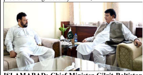
ISLAMABAD: Chief Minister Gilgit-Baltistan Haji Gulbar Khan in a meeting with Federal Minister of Kashmir Affairs and Gilgit-Baltistan Engineer Amir Muqam at his Office.

It may also be mentioned that a full-fledged office of the Grievance Commissioner for the Overseas Pakistanis has already been working in the Wafaqi Mohtasib's office.