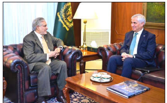
Secretary General ECO, Ambassador Khusrav Noziri called on Deputy Prime Minister and Foreign Minister Senator Mohammad Ishaq Dar at the Ministry of Foreign Affairs Islamabad.

Later, Senator Muhammad Aurangzeb and Sardar Awais Ahmad Khan Leghari also held a useful meeting with the President of China Export and Credit Insurance Corp at its Headquarters and discussed the latest reform agenda of the government of Pakistan.