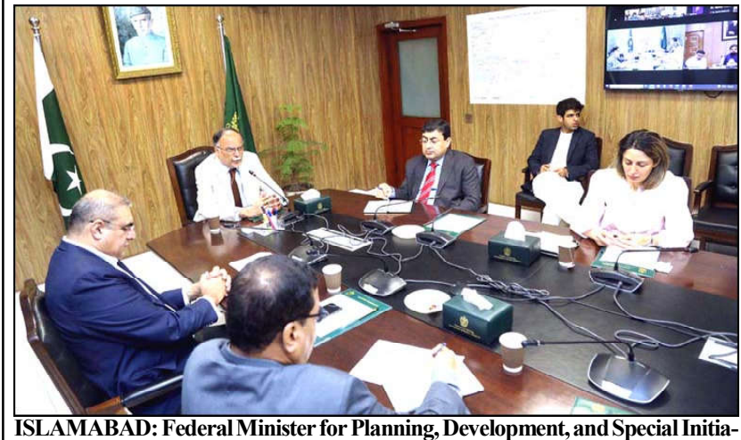
tives, Ahsan Iqbal chaired a high-level meeting with provincial planning ministers.

The minister reiterated the need for collective efforts to achieve national development goals, committing to hold monthly consultative meetings with Provincial Planning Ministers to ensure ongoing collaboration and