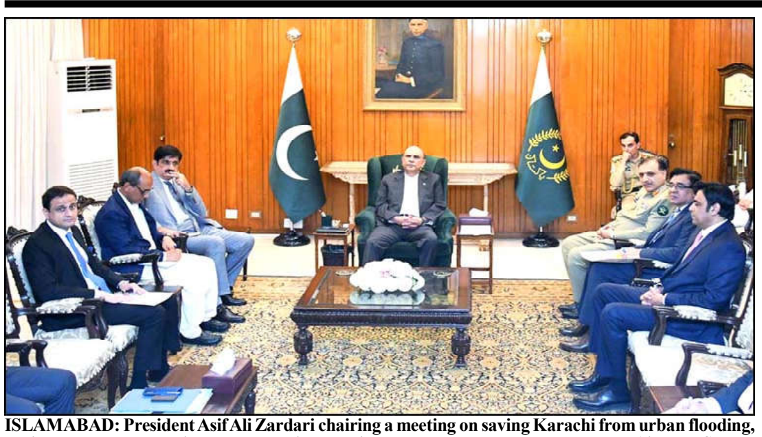
environmental degradation and promoting sustainable water resource development at Aiwan-e-Sadr.