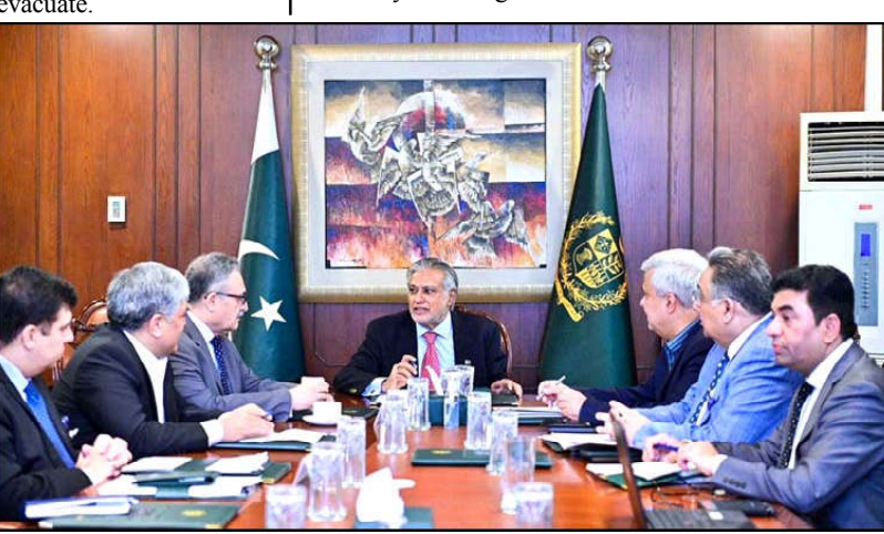
ISLAMABAD: Deputy Prime Minister and Foreign Minister Senator Mohammad Ishaq Dar, chairs high level meeting on the welfare of overseas Pakistanis.

It was decided that the Ministry of Interior and IMPASŠ will take immediate necessary steps to upgrade the infrastructure and equipment within the next days and to accelerate the clearance of the entire backlog relating to the issuance of passports to over-