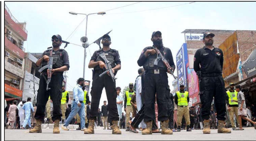
MULTAN: Security Official standing high alert outside the Imambargah Mumtazabad to avoid any untoward incident during the procession on 9th Muharram. Muharram Ul Haram is known as the first month of the Islamic calendar and the mourning month in remembrance of the martyrdom (Shahadat) of Hazrat Imam Hussain (RA), the grandson of the Holy Prophet Mohammad (SAWW).

Bhutto had assembled leaders of Muslims Ummah and laid foundation of Atomic power, saying no one can defeat us if we get united. The Governor stressed for keeping care of minorities rights that were protected under the constitution. Kundi invited students of Al Ghazali to visit Peshawar saying the doors of Governor House Peshawar were now open for people and stressed on students that they would perform role like the country's Ambassador to highlight Pakistan soft image. Raes Al Rashid University and Chancellor Ghazali University welcomed the Khyber Pakhtunkhwa Governor and urged all stakeholders to shun differences and sit together for progress and prosperity of Pakistan. They said such organizations should be in all cities of Pakistan and vowed to extend its services in Peshawar.