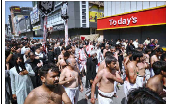
PESHAWAR: A large number of mourners attending the 9th Muharram Zuljinnah procession passes through Saadar Road.