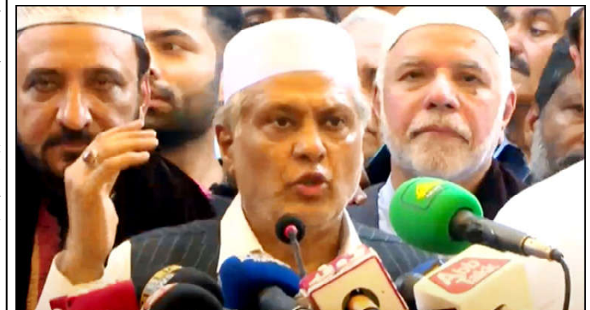
LAHORE: Deputy Prime Minister Muhammad Ishaq Dar talking to media persons