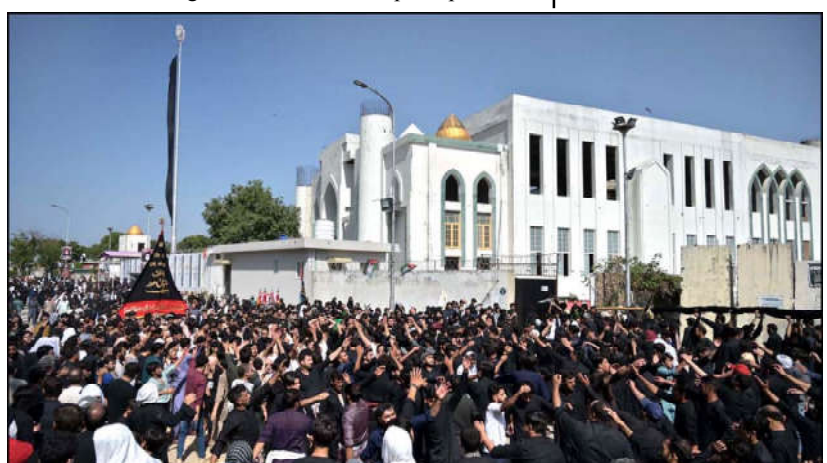
ISLAMABAD: A large number of mourners attending main procession on 9th of Muharramul Haram at G-6, Muharramul Haram known as the first month of the Islamic calendar and the mourning month in remembrance of the martyrdom (Shahadat) of Hazrat Imam Hussain (RA)

ISLAMABAD (APP): Four Pakistanis were martyred and thirty others were hospitalized with gunshot wounds after a terrorist attack targeted the Imambargah, Ali bin Abi Talib, in Muscat's Wadi Kabeer area, said Foreign Office spokesperson on Tuesday. In a statement, the Foreign Office spokesperson quoted the latest information from Omani au-