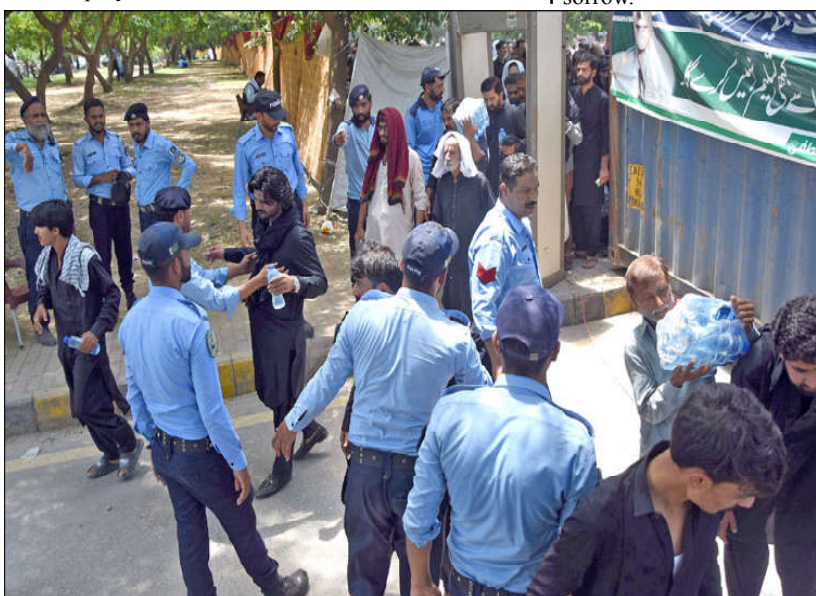
ISLAMABAD: Police personals searching body of Shiite Muslim mourners during 9th Muharram Ul Haram procession at Imam Bargah Asna Ashri, in the Federal Capital.

He said during dehydration of animals or wild birds was treated through intake of ORS water which was highly recommended due to its easy availability other than the re-hydration fluid fed under the supervision of expert and trained medical practitioners and vets. He mentioned that the general public was advised to keep dehydrated birds in shade and feed ORS water as first aid prior to relocating the affected bird to rehab and rescue clinic.