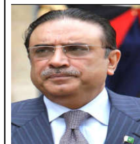
ISLAMABAD (APP): President Asif Ali Zardari has stressed upon the need of display of unity and facing the forces of cruelty and evil with steadfastness while learning lessons from the incident of Karbala.

Hazrat Imam Hussain (RA)'s sacrifices inspire resistance against oppression: PM