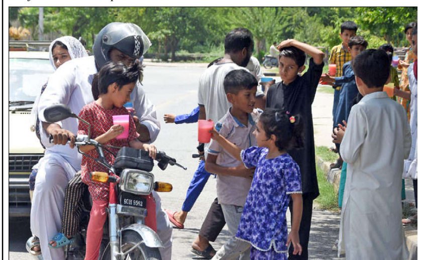
ISLAMABAD: Children served milk among the people from a Sabeel along a road at sector G-7 during a procession on the 9th day of Ashura in the Islamic month of Muharram, in the Federal Capital.

The sources continued that well-alerted police personnel have been posted before almost all 90 Imam Bargahs across AJK to maintain peace and order during the scheduled Majalis (religious meetings) to mark the sanctified month, right from the 1st day to the 10th of Muharram ul Haram, the Youm-e-Ashur, falling on Wednesday.