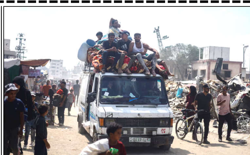
Palestinians, who fled the eastern part of Khan Younis after they were ordered by Israeli army to evacuate their neighborhoods, ride on a vehicle loaded with belongings, amid Israel-Hamas conflict, in Khan Younis in the southern Gaza Strip.

It also said its naval forces had been firing at targets in Gaza. The relentless bombardments came as prospects dwindled for a truce and hostage release deal being secured any time soon. Hamas, the Iran-backed Islamist group that Israel has been fighting in Gaza for over nine months, said on Sunday it was withdrawing from ceasefire talks. The decision followed an Israeli strike targeting the head of Hamas's military wing, Mohammed Deif, which the health ministry in Hamas-run Gaza said killed 92 people. Deif's fate remains unknown, with Israeli Prime Minister Binyamin Netanyahu saying there was "no certainty" he was dead while a senior Hamas official told AFP that Deif was "well and directly overseeing" operations.