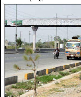
ISLAMABAD: A view of blocked a pedestrian bridge for motorcycles at Karnal Sher Khan Shaheed Road in the Federal Capital.

The project is aimed at developing skills and ca-