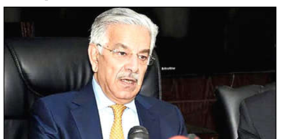
PTI's political motives, stating, "The only aim of PTI is power."

SIALKOT (INP):- Defense Minister Khawaja Asif has announced that the Pakistan Muslim League-Nawaz (PML-N) will consult its parliamentary allies regarding the potential ban on Tehreek-e-Insaf (PTI), emphasizing the importance of collaboration in legislative matters. In a press conference held in Sialkot, Asif criticized