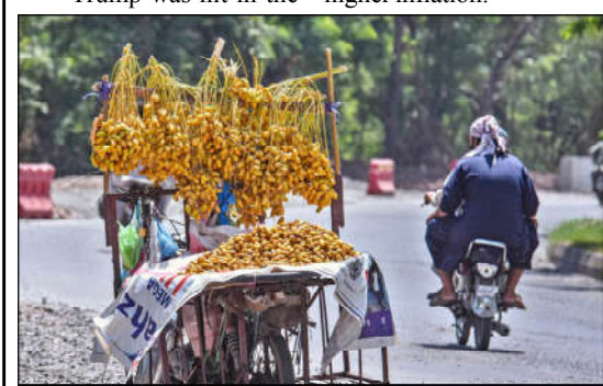
ISLAMABAD: A street vendor displaying dates on his handcart at roadside setup to attract customers at Lehar Road.

"Still, others worry that his push to increase tariffs could also lead to higher inflation."