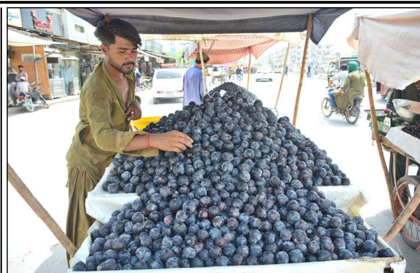
HYDERABAD: A vendor arranging and displaying plums to attract the customers on hand cart.