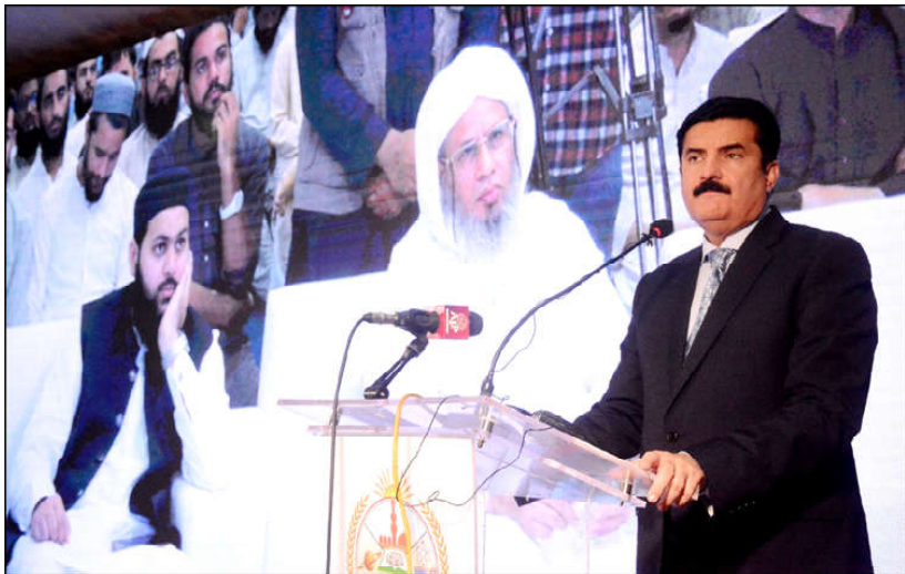
Governor Khyber Pakhtunkhwa Faisal Karim Kundi addressing a function at Al-Ghazali University Karachi.

Visits 9th Muharram-ul-Haram processions