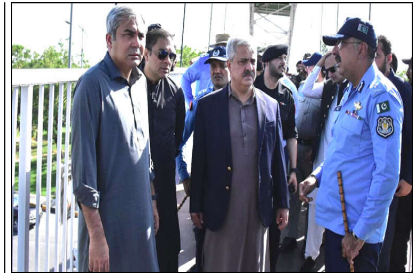
ISLAMABAD: Federal Interior Minister Mohsin Naqvi visiting main procession of the 9th of Muharram and personally reviewed the security arrangements put in place to protect mourners.

petrators of this heinous and cowardly act targeting innocent civilians, especially women and children, will be brought to justice. Meanwhile President Asif Ali Zardari on Tuesday strongly denounced the terrorist incident in Bannu Cantonment and paid homage to the martyred soldiers for thwarting the attacks. In a statement, the president highlighted that the nation's soldiers prevented a major loss through swift action. The president expressed that the entire nation was proud of the brave soldiers' sacrifice and paid tribute to the security forces for their role in foiling the terrorist attack in Bannu Cantonment. The President reiterated his commitment to eliminate those engaged in such despicable activities. He offered prayers for the martyrs, seeking their elevation in paradise and requesting patience for their grieving families. Prime Minister Muhammad Shehbaz Sharif on Tuesday expressed his admiration for the security forces for effectively thwarting a major attack on Bannu Cantonment. In his statement, the PM vehemently denounced the terrorists for the assault on Bannu Cantonment and reiterated the nation's steadfast backing of the security forces in their ongoing fight against terrorism.