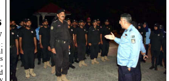
IGP Islamabad briefed Red Zone commandos on their duties and the importance of maintaining security in the Red Zone.

size the critical role of the Red Zone commandos in enhancing security for ambassadors, foreign delegations, embassies, and key public and private offices situated in the red zone, ensuring prompt resolution of any untoward incidents. He reiterated that protecting the lives and property of citizens remains the Islamabad Police’s top priority. Previously, on special orders from IG Islamabad, a combat refresher course was conducted to enhance the efficiency and professional skills of Red Zone commandos.