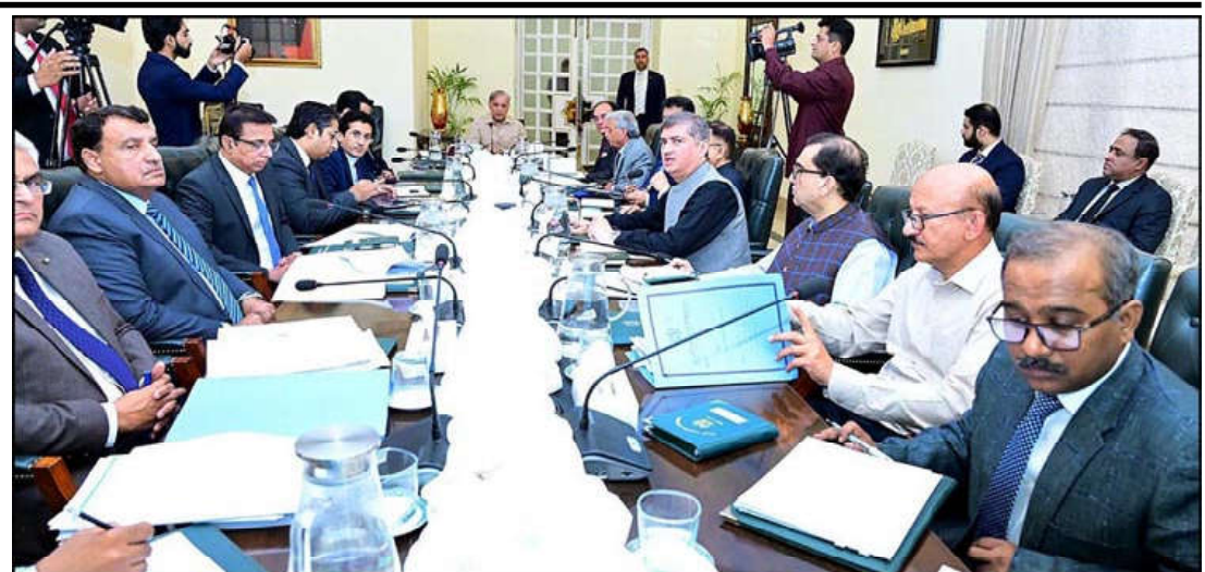
ISLAMABAD: Prime Minister Muhammad Shehbaz Sharif chairs a meeting on restructuring of Wheat Board and matters related to PASSCO.

The meeting approved the restructuring of Wheat Board.