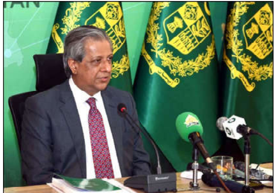
ISLAMABAD: Federal Minister for Law and Justice, Senator Azam Nazeer Tarar addresses to media persons during press conference, in Islamabad.

President welcomed the signing of Memoranda of Understanding (MoUs) between Pakistan and Azerbaijan, adding that the MoUs would give a new impetus to bilateral cooperation in the fields of trade, commerce, tourism, mines and minerals, science and technology, law & justice, and culture. President highlighted that the East had the potential to lead the world towards prosperity. He added that Pakistan wanted to build a sustainable and result-oriented engagement with Central Asian Republics and Azerbaijan. Speaking on the occasion, President Ilham Aliyev said that Pakistan and Azerbaijan enjoyed a high frequency of people-to-people exchanges and both the countries needed to promote business-to-business relations for enhancing economic relations. He stated that Pakistan and Azerbaijan could also explore the possibility of working together in the renewable energy sector.