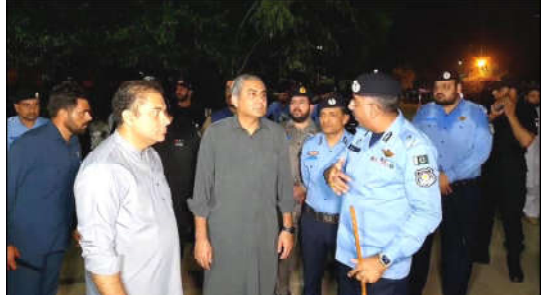
ISLAMABAD: Federal Minister for Interior Mohsin Naqvi visiting Markazi Asna Ashri Imam Bargah in G-6.

He clarified that Pakistan Tehreek-e-Insaf (PTI) was not a party in this case and that independent members of PTI did not approach any forum after winning.