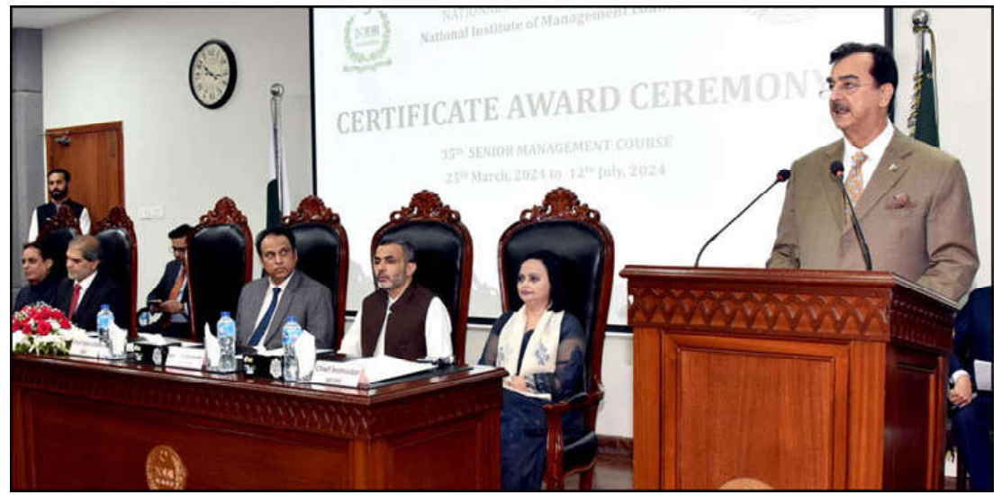
ISLAMABAD: Chairman Senate, Syed Yousuf Raza Gilani addressing as chief guest at the certificate awarding ceremony of 35th senior management course at National Institute of Management (NIM).