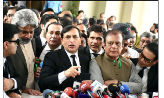
ISLAMABAD: Chairman of the Pakistan Tehreek-e-Insaf Gohar Ali Khan talking with media persons after the PTI reserved seats case outside supreme court in the Federal Capital.

The prime minister appreciating the provincial governments for their cooperation with the Power Ministry to prevent electricity theft, directed the authorities concerned to present a comprehensive plan to introduce smart metering system in the country.