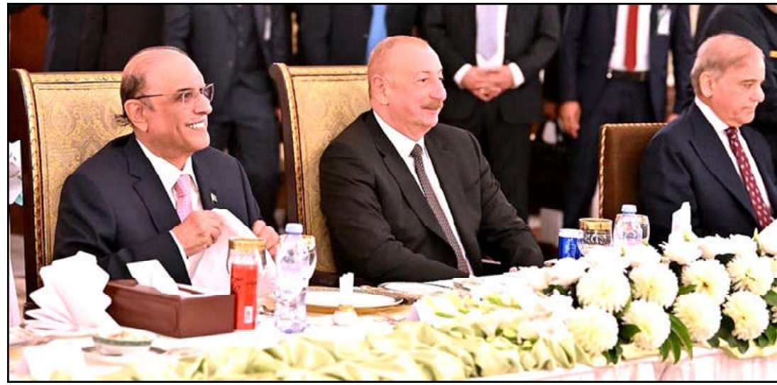
ISLAMABAD: President Asif Ali Zardari hosted a state luncheon in the honour of President of Azerbaijan, Mr. Ilham Aliyev, at Aiwan-i-Sadr, Prime Minister Muhammad Shehbaz Sharif was also present on the occasion.

Since the year 1947, when the country became a sovereign state, the population of Pakistan has in-