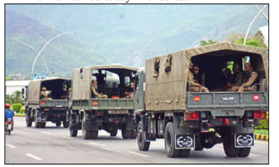
ISLAMABAD: Pak army patrolling at Constitution Avenue in the Federal Capital.