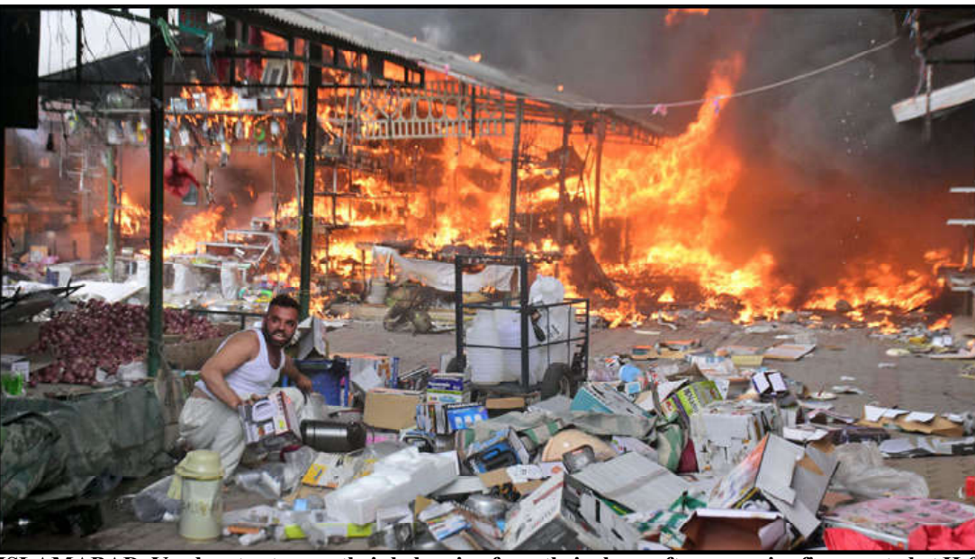
ISLAMABAD: Vendors try to save their belonging from their shops after a massive fire erupted at H-9 Sunday weekly bazaar in the Federal Capital, More than 100 shops were gutted in the fire that broke out