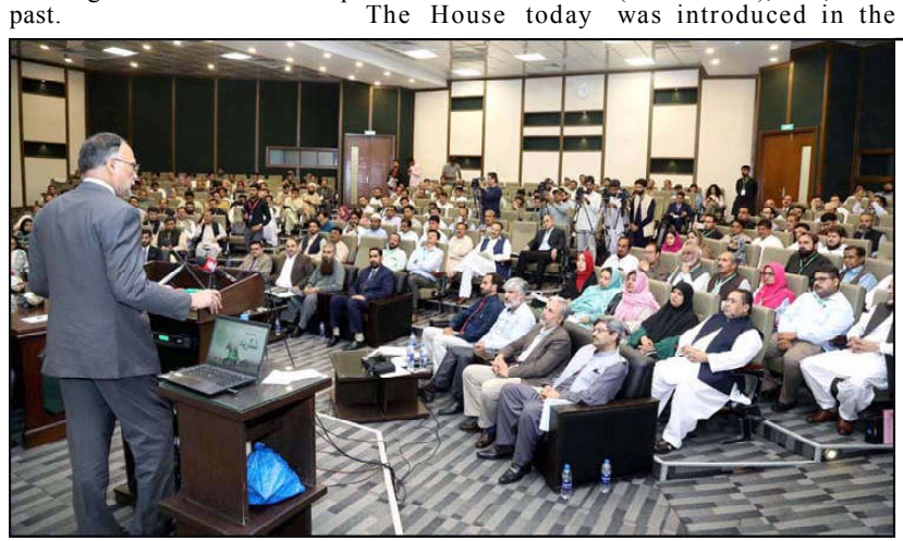
ISLAMABAD: Federal Minister for Planning, Development, and Special Initiatives, Ahsan Iqbal addressing the Seventh Agricultural Census 2024 at a ceremony held by the Pakistan Bureau of Statistics (PBS).