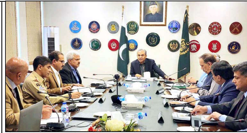
ISLAMABAD: Interior Minister Mohsin Naqvi chairing a meeting regarding maintenance of law and order during Muharram.

ISLAMABAD (INP): Frontier Corps (FC) Balochistan (South) has successfully foiled an attempt to smuggle sugar from Pakistan to Afghanistan. The operation took place in Killi Gharibabad, Nok Kundi, where a large cache of illegally stored sugar was discovered in a warehouse. During the raid, authorities seized 1,368 bags of sugar, weighing approximately 70 tons. The confiscated sugar is estimated to be worth 10 million rupees at current market rates. Following the operation, the warehouse was sealed, and an FIR was registered against the smugglers. The seized sugar and those involved in the smuggling attempt have been handed over to customs.