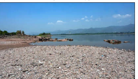
ISLAMABAD: A view of water level in Rawal Lake has decreased due to below-normal rainfall in the Federal Capital.