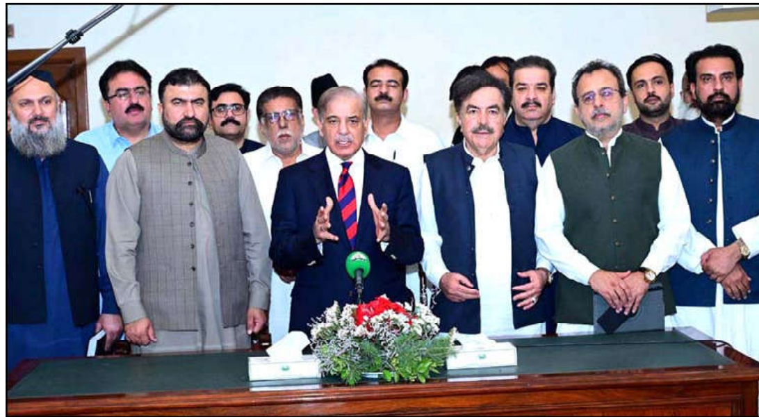
QUETTA: Prime Minister Muhammad Shehbaz Sharif talking to the media after the signing of agreement to solarise agricultural tubewells of Balochistan.

judge in the Election Tribunal, a press release issued by the President House said. The president extended the approval of the bill under Article 75 of the Constitution. After the president's approval, the Election Bill has become an Act. The Election Amendment Bill was passed by the National Assembly on June 28 and by the Senate on July 4.