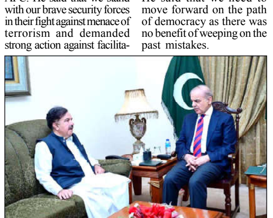
QUETTA: Prime Minister Muhammad Shehbaz Sharif meets Governor Balochistan Jafar Khan Mandokhel during his one day visit to Quetta.

He said that the PPP did not believe in the politics of accusation, confrontation and blame games. PPP would be reactivated in Khyber Pakhtunkhwa. He said that we need to move forward on the path of democracy as there was no benefit of weeping on the past mistakes.