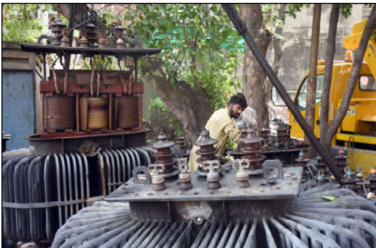
LAHORE: AWPDA engineer is busy in repairing Transformers at G.R.O in the Federal Capital.