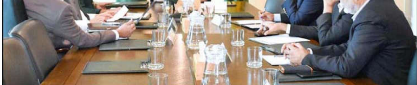
ISLAMABAD: Minister of State for IT and Telecommunication, Ms. Shaza Fatima Khawaja chairing first meeting of Functional Committee on Information Technology and Telecommunication.

The children showcased their skills through impressive performances of judo, karate, and taekwondo, which were highly appreciated by the visitors.