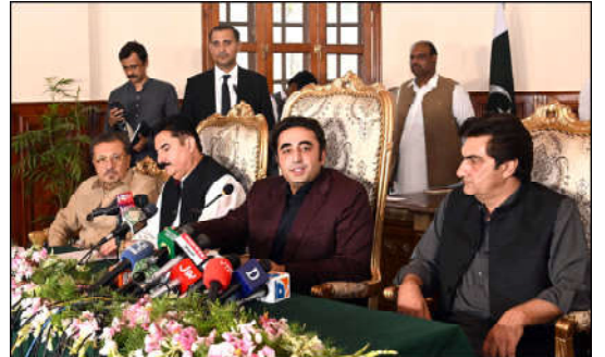
PESHAWAR: Chairman Pakistan People's Party Bilawal Bhutto Zardari addressing a press conference along with Governor Khyber Pakhtunkhwa (KP) Faisal Karim Kundi at Governor House, in the Provincial Capital.

He urged the need to develop Pakistan's irrigation sector along modern lines to conserve water, reduce water losses, and enhance water availability.