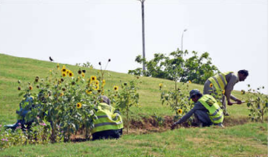
ISLAMABAD: Workers of Capital Development Authority (CDA) buy in planting plants of Sunflowers on a green belt alongside Islamabad Expressway in the Federal Capital.