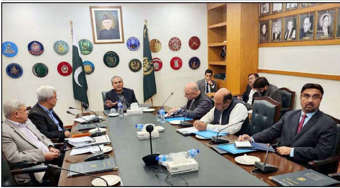
ISLAMABAD: Interior Minister Mohsin Naqvi chairing a meeting regarding over-billing of protected consumers.