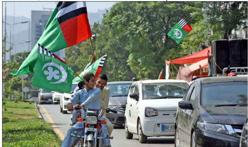
ISLAMABAD: Members of Sunni Ulema Council are holding a rally in connection of first Muharram-ul-Haram the day of Martyrdom of 2nd Muslim Caliph Hazrat Umar Farooq (R.A) passes through a road.