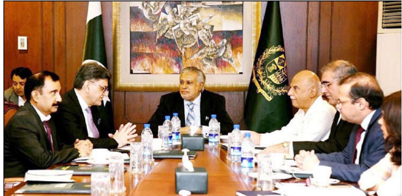
Deputy Prime Minister and Foreign Minister Senator Mohammad Ishaq Dar chairs a meeting regarding Railways Development Projects, in Islamabad