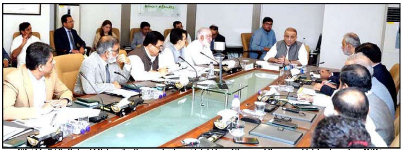
ISLAMABAD: Federal Minister for Communications, Abdul Aleem Khan presiding over a high level meeting of NHA.

ISLAMABAD (APP): The Federal Flood Commission (FFC) on Monday said that River Kabul was flowing in low flood at Warsak-Nowsheera reach while all other main rivers of Indus River System (IRS) were flowing normal. According to daily FFC report, monsoon trough along the foothills of Himalayas (India) has temporarily become insignificant for Pakistan whereas a strong trough of the westerly wave that was previously prevailing over the northern parts of Pakistan has now moved eastwards. A new trough lies over northwestern Afghanistan. Additionally, over northeastern Balochistan and adjoining areas, a weak seasonal low also prevails causing incursion of light moisture from the Arabian Sea and Bay of Bengal to the upper parts of Pakistan, up to 3000 feet.