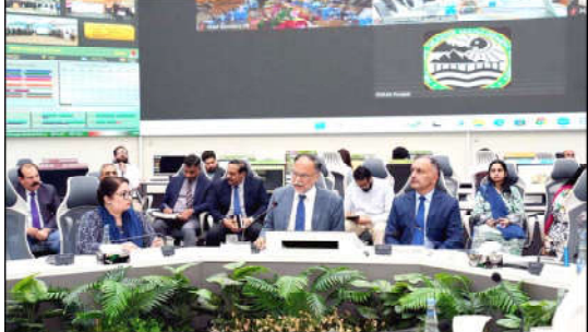
ISLAMABAD: Federal Minister of Planning, Development & Special Initiatives Ahsan Iqbal presiding 1st meeting of Disaster Response at NEOC, NDMA Headquarters.

Province-wide, 586 locations are classified as sensitive, and 146 as extremely sensitive.