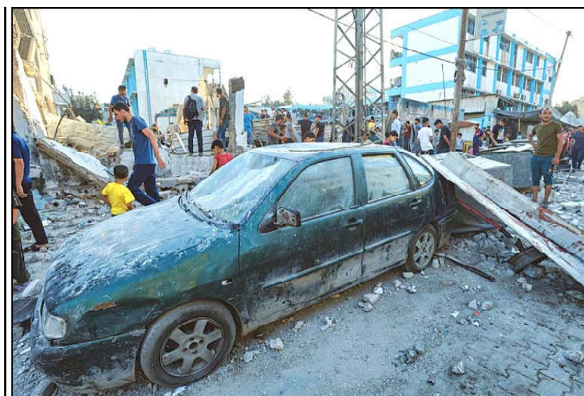
Palestinians gather at the site of an Israeli air strike on a UN school sheltering displaced people at Nusairat in central Gaza Strip.