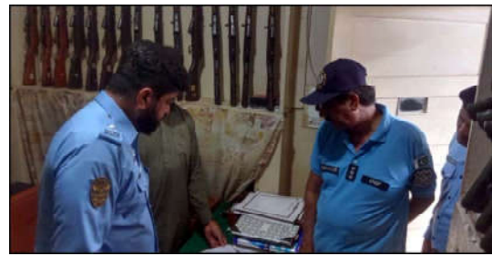
and armory at the Secretariat police line. Strict orders were issued to the Line Officer and Mess in-charge to improve the quality of the mess, canteen and residential barracks, by ensuring the supply of good and quality food to the police officer and to take special care of cleanliness.

He said that, during the visit the SP High Security Zone checked the residential barracks, mess hall and issued directions to armory in-charge to maintain