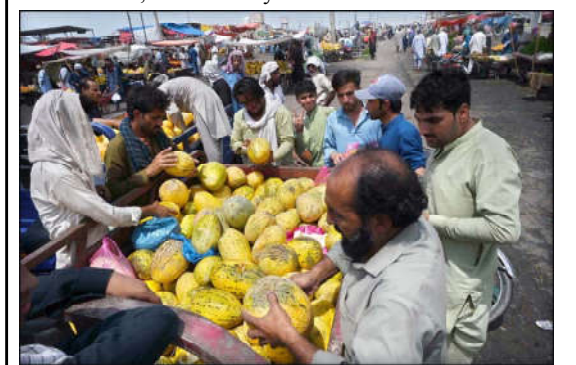
ISLAMABAD: People purchasing seasonal fruit displayed by vendor at Fruit and Vegetable Market in the Federal Capital.

He assured of resolving these issues promptly, promising to engage with the Higher Education Commission's officials for necessary actions.