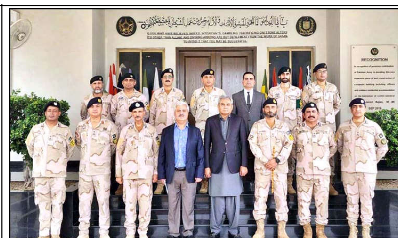
RAWALPINDI: Federal Minister for Interior and Anti Narcotics Mohsin Naqvi in a group photo during his visit to ANF Headquarters.

full support for the construction of the Tain Majeed Gula to Thorar Road. He emphasised the need for good governance and criticized previous rulers for failing to address the region's problems. The PM stressed the importance of promoting a positive image of Poonch division and urged the delegation to organise festivals to boost tourism. He also expressed concern over negative propaganda on social media and its impact on society, calling for a long-term plan to tackle unemployment.