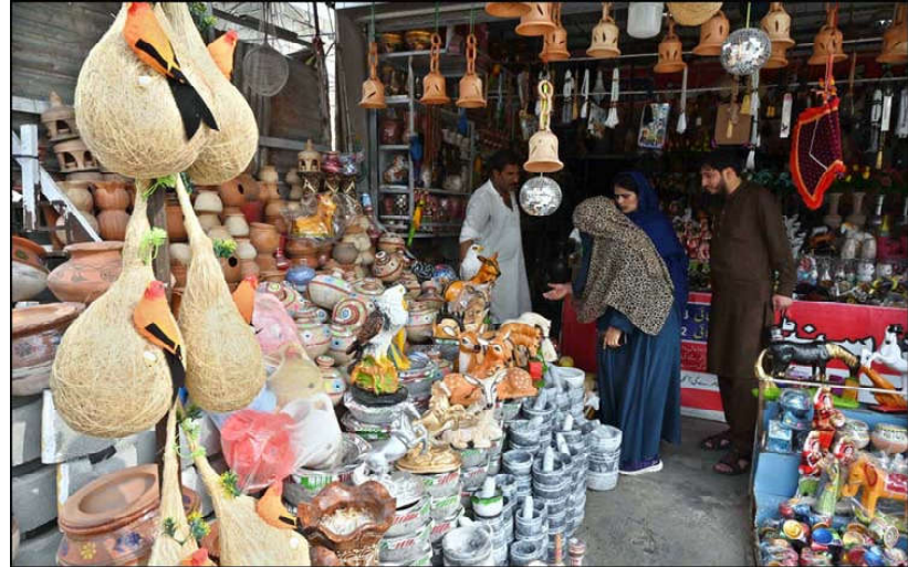
ISLAMABAD: A family selecting and purchasing decoration items and other stuff from vendor at Bari Imam shrine in the Federal Capital.