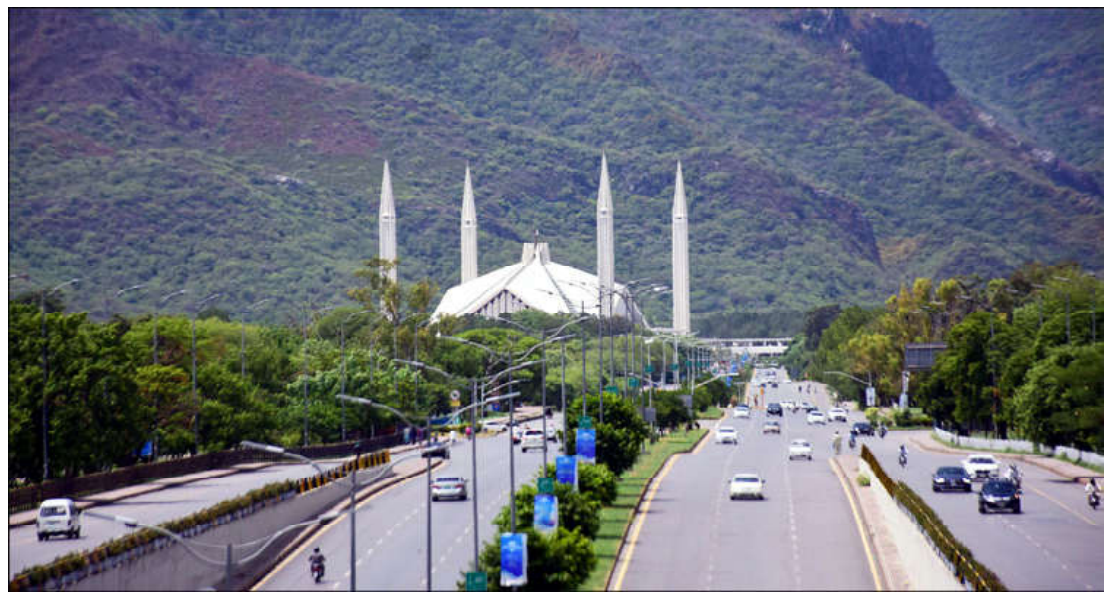
ISLAMABAD: A stunning view of clean and green capital city after the heavy rain, in the Federal Capital.

"People don't want to deal with the tax authority because of corruption, because of harassment, because of people asking for speed money, facilitation money," Aurangzeb noted. "That's not sustainable."