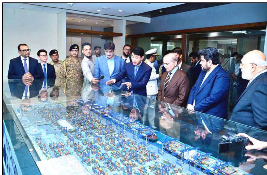
KARACHI: Prime Minister Muhammad Shehbaz Sharif receives briefing about Hutchison Ports Pakistan Terminal at Karachi Port.

Vol. XIV No. 156 Reg. mails-B / ID-445 Monday July 08, 2024, Muharram 01, 1446 A.H. Ph: 2158688, 2158997 Pages 4: Rs. 12