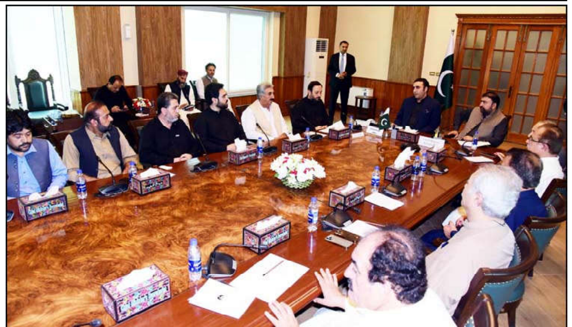
QUETTA: A delegation of Quetta Chamber of Commerce led by Senator Bilal Khan Mandokhail meeting with Chairman PPP Bilawal Bhutto Zardari. Balochistan Chief Minister Mir Sarfraz Bugti and Provincial Ministers are also present.

He emphasized that road connectivity and communications were very much necessary to increase the bilateral links between the two countries.