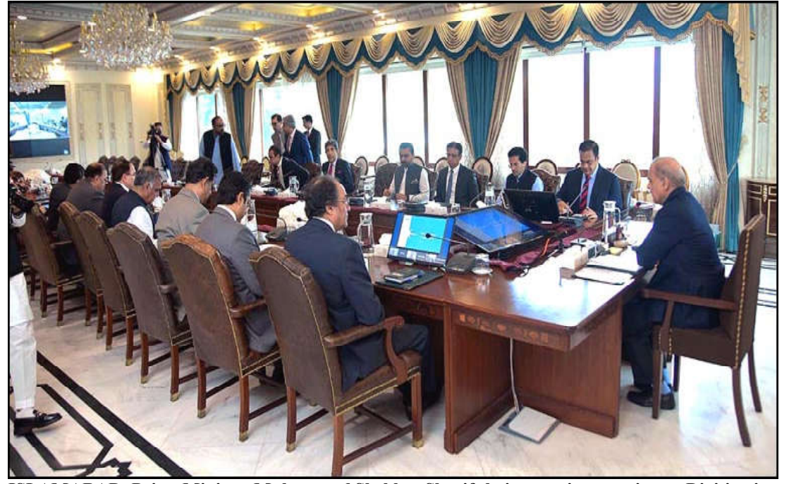
ISLAMABAD: Prime Minister Muhammad Shehbaz Sharif chairs a review meeting on Digitization and Reforms of FBR.