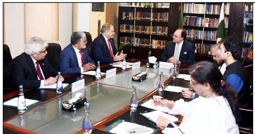
ISLAMABAD: Federal Minister for Finance & Revenue Senator Muhammad Aurangzeb in a meeting with the delegation of Pakistan Tax Bar Association.