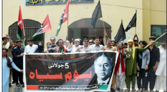
BAHAWALPUR: Activists of Pakistan People's Party hold a banner during protest on the eve of black day on 5th July, outside press club in the city.