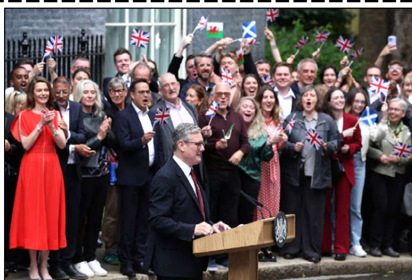
British Prime Minister Keir Starmer speaks, at Number 10 Downing Street, following the results of the election, in London, Britain.

Audience The Right Honourable Sir Keir Starmer MP today and requested him to form a new administration," a palace statement read. "Sir Keir accepted his majesty's offer and kissed hands upon his appointment as prime minister and first lord of the Treasury." Starmer vowed to bring change to Britain as its next prime minister after his Labour Party surged to a comprehensive win in a parliamentary election, ending 14 years of often tumultuous Conservative government. The centre-left Labour was set to win a massive majority in the 650-seat parliament with Sunak's Conservatives poised to suffer the worst performance in the party's long history as voters punished them for a cost of living crisis, failing public services, and a series of scandals.