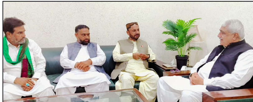
LAHORE: A delegation of Shia Ulema Council meeting with Provincial Minister for Health and Chairman Cabinet Committee for Law and order Khawaja Salman Rafique.

the support of US government in the different public welfare projects, adding that expending cooperation between both the governments would further strengthen the relationships between Pakistan and the United States. Touching upon the priorities of his government, Ali Amin Khan Gandapur said that the health and education had been the top most priority of PTI government in the province since day one, and we had introduced multiple reforms in these sectors, which had resulted in significant improvement in providing quality healthcare and learning facilities to the people as per their expectations.