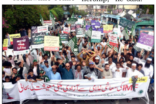
LAHORE: Activists of Pakistan Central Muslim League hold a protest against inflation in Pakistan, outside press club in the Provincial Capital.

was on two-day visit to Balochistan wherein he was briefed about the pace of ongoing uplift schemes, proposed development projects for Balochistan. He also held detailed deliberations with the provincial leadership and