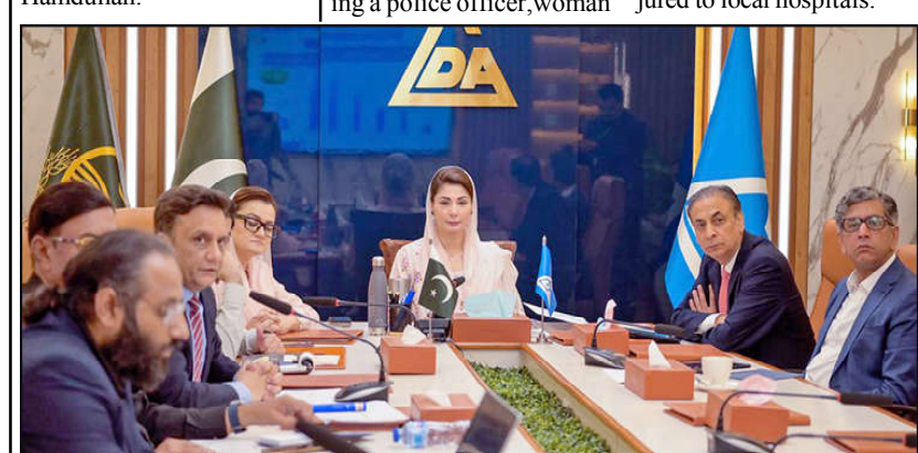
LAHORE: Punjab Chief Minister Maryam Nawaz Sharif presides over the meeting during his visit to Lahore Development Authority. Senior Minister Mariyum Aurangzeb is also present on the occasion.

workers of the party. The PPP Chairman while addressing news conference emphasized the need for developing consensus on the national issues terming it crucial for continuity of the democratic process and stability of the country. "Though, we had some reservations on some national matters including recent budget for the fiscal year 2024-25, however in public interest, we did not create hurdles thanks to the federal government who agreed to assist us in undertaking the development projects, we proposed for our people, he noted. About briefing given to him on issues of Balochistan, he said there is a huge potential needed to be explored in the mineral enriched province.