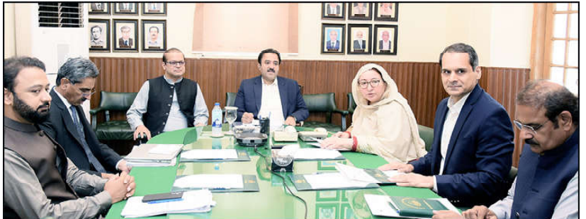
LAHORE: Punjab Minister for Local Government Zeeshan Rafique presides over the briefing session of Cooperatives Department. MNA Armaghan Subhani is also present.

participated in both programs across Lahore and the 36 districts of the province. Among those who have completed the internship, there are 13,000 male students and over 7,000 female students. A Punjab police spokesperson said that students from 88 universities, 143 colleges, and 43 schools participated in the community policing programmes. Over 20,000 students were briefed and trained about police work through the friends of police and volunteers in police programmes.