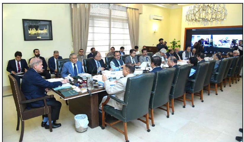
Prime Minister Muhammad Shehbaz Sharif chairs a meeting of Cabinet Committee on Energy in Islamabad.

tricity in Gilgit Baltistan. The committee also approved setting up a support unit with two-year tenure to increase the efficiency of electricity distribution companies, prevent electricity theft and timely collection of bills. After the Federal Cabinet's approval, the first support unit would be established for the Multan Electric Power Company (MEPCO). The committee also approved an incentive package for recovery of unpaid and overdue electricity bills. Under the package, rewards would be given to the personnel of law enforcement agencies and officials of DISCOs for the recovery of unpaid and overdue electricity bills.