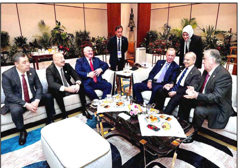
ASTANA: Prime Minister Muhammad Shehbaz Sharif interacts with the world leaders on the sidelines of Shanghai Cooperation Organisation Summit.

a meeting of chief justice LHC and ECP convened, it said, adding that the top court respects the both institutions. The order said that the the Supreme Court left the matter to the consultation of the Chief Justice LHC and the ECP. The petition will remain pending with the top court until. The order stated that immediately after the oath of the Chief Justice LHC, the ECP members should consult him in a meaningful way before the next hearing. The Supreme Court also suspended the letter of ECP seeking a panel from the LHC for tribunal. It said that the Attorney General has also supported the meaningful consultation.