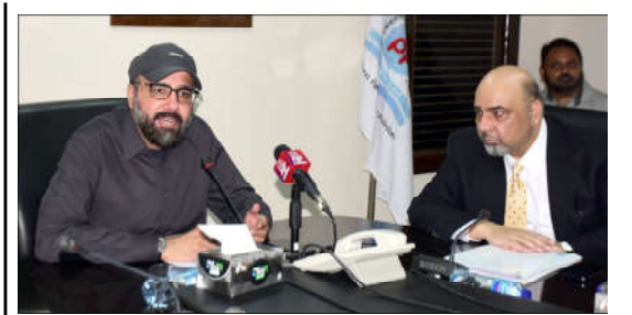
ISLAMABAD: Federal Minister for Overseas Pakistanis Ch Salik Hussain addressing a press conference at OPF head office in the Federal Capital.

Senator Mushahid emphasized on the urgent need to develop a rapid response think tank on strategic communication to craft media narratives for Pakistan.