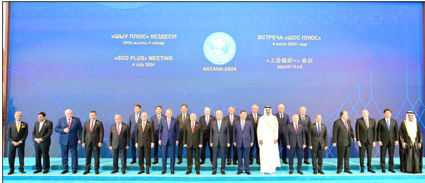
ASTANA: Prime Minister, Muhammad Shehbaz in a group photo with the Shanghai Cooperation Organization Plus Summit, held in Astana.

Vol. XIV No. 154 Reg. mails-B / ID-445 Friday July 05, 2024, Zil Hajj 28, 1445 A.H. Ph: 2158688, 2158997 Pages 4: Rs. 12