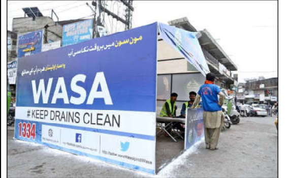
RAWALPINDI: Water and Sanitation Agency (WASA) establish Flood Response Unit at Guwalmandi near Nullah Lai as pre-monsoon spell is expected to start from Thursday to Sunday and assured that all necessary arrangements have been made in this regard by Rawalpindi Development Authority (RDA).