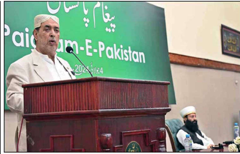
GILGIT: Governor Gilgit-Baltistan Syed Mehdi Shah addressing during the Paigham-e-Pakistan Conference, an initiative to maintain peace and harmony in Gilgit-Baltistan organized by Govt of Gilgit-Baltistan.

incidents. He also appealed to the public to cooperate with the government in maintaining peace and harmony during the month. Religious scholars and public figures will be engaged to promote peace and harmony and to prevent the spread of hate speech. Tents will be set up along procession routes to provide shade for participants, and electricity arrangements will be made to ensure an uninterrupted power supply. A coordination system has been established among all relevant departments and agencies to ensure the smooth observance of Muharram.