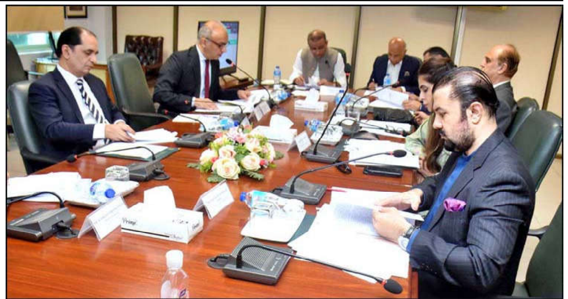
ISLAMABAD: Federal Minister for Privatisation / Chairman Privatisation Commission, Abdul Aleem Khan chairing 220th meeting of the Privatisation Commission Board.

meeting and a negotiation session was held with business group interested in purchase of the HBFC along with the officers of the Privatization Commission. Minister for Privatization Abdul Aleem Khan directed that all proposals for privatization should be opened in front of cameras in the presence of the media so that there should be no question on its transparency. Finance Minister Muhammad Aurangzeb and Law Minister Azam Nazir Tarrar also emphasized on the privatization.