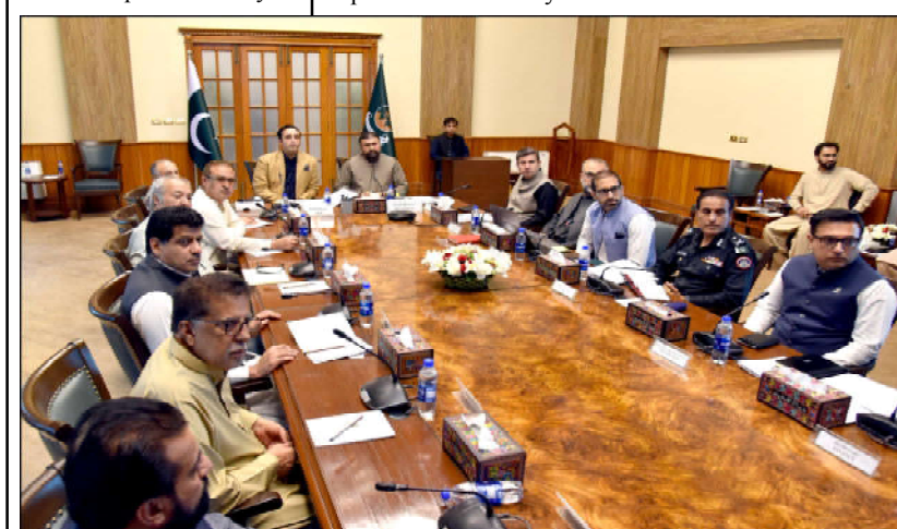
QUETTA: Chairman PPP Bilawal Bhutto Zardari and Chief Minister Balochistan Mir Sarfaraz Bugti being briefed about law and order situation and development projects. Provincial Ministers and senior officials are also present

supreme sacrifice. His exemplary leadership and unwavering courage inspire us to defend Pakistan at all costs. Captain Karnal Sher Khan's heroism in the Kargil War etched his name in history with bravery, unshakable commitment, and unwavering loyalty. His martyrdom serves as a poignant reminder of the ultimate sacrifices made by the Armed Forces to safeguard our motherland. Let us remember these heroes who have laid down their lives in defence of our motherland. The nation is proud of its gallant sons.