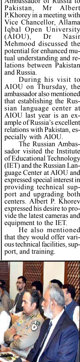
ISLAMABAD: Senator Pervaiz Rasheed, Chairman Senate standing committee on communications presiding over a meeting of the committee at Parliament House.