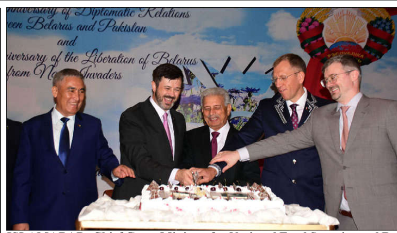
ISLAMABAD: Chief Guest Minister for National Food Security and Research Rana Tanveer Hussain and Ambassador of the Republic of Belarus to Pakistan, Andrei Metelitsa cutting the cake on the occasion of the Independence Day the Republic of Belarus and the 30th anniversary of Diplomatic Relations between Belarus and Pakistan at a local hotel in Federal Capital.