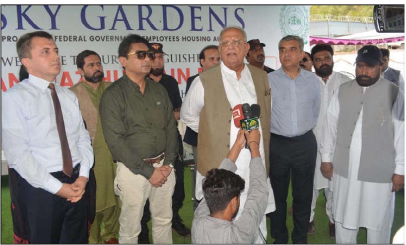
ISLAMABAD: Federal Minister for Housing and Works, Mian Riaz Hussain Pirzada, talking to media after visiting Federal Government Employees Housing Authority Bhara Kahu Sky Garden scheme.