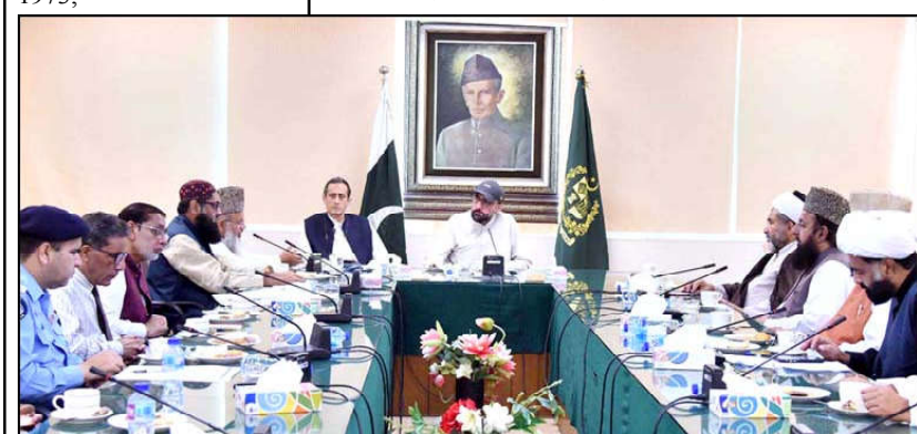
ISLAMABAD: Federal Minister of Religious Affairs and Interfaith Harmony, Chaudhry Salik Hussain chairing a meeting regarding inter-religious harmony during Muharram-ul-Haram.