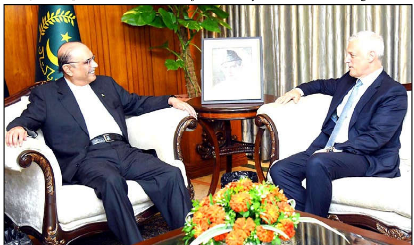
ISLAMABAD: Group Chief Executive of the Standard Chartered Bank Bill Winters, called on President Asif Ali Zardari, at Aiwan-e-Sadr.