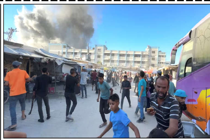
Palestinians react, following an Israeli strike near a UN-run school sheltering displaced people, amid the Israel-Hamas conflict, in Khan Younis, in the southern Gaza Strip.