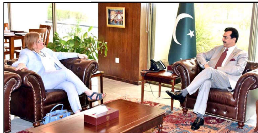
ISLAMABAD: Chairman Senate, Syed Yousuf Raza Gilani in a meeting with Italian Ambassador to Pakistan, H.E. Marilina Armellini at Parliament House.