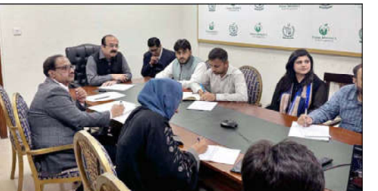
ISLAMABAD: Chairman Prime Minister's Youth Programme Rana Mashhood Ahmed Khan in a meeting with state bank officials.

ISLAMABAD (APP): The Pakistan Environmental Protection Agency (Pak-EPA) on Wednesday during its inspection visit found subpar waste management practices in various hospital of the federal capital. A joint inspection exercise under the directives of the prime minister was conducted by the Pak-EPA and the Islamabad Health Care Regulatory Authority (IHRA), a news release said. The assessment, carried out by four teams, found significant lapses in waste segregation, storage, and incineration, posing risks of infection spread and environmental contamination. The hospital management had pledged to rectify the issues and implement proper waste management protocols. Moreover, Pak-EPA and IHRA would continue monitoring health facilities in Islamabad to ensure compliance with the Hospital Waste Management Rules 2005, taking necessary actions to safeguard public health and the environment.