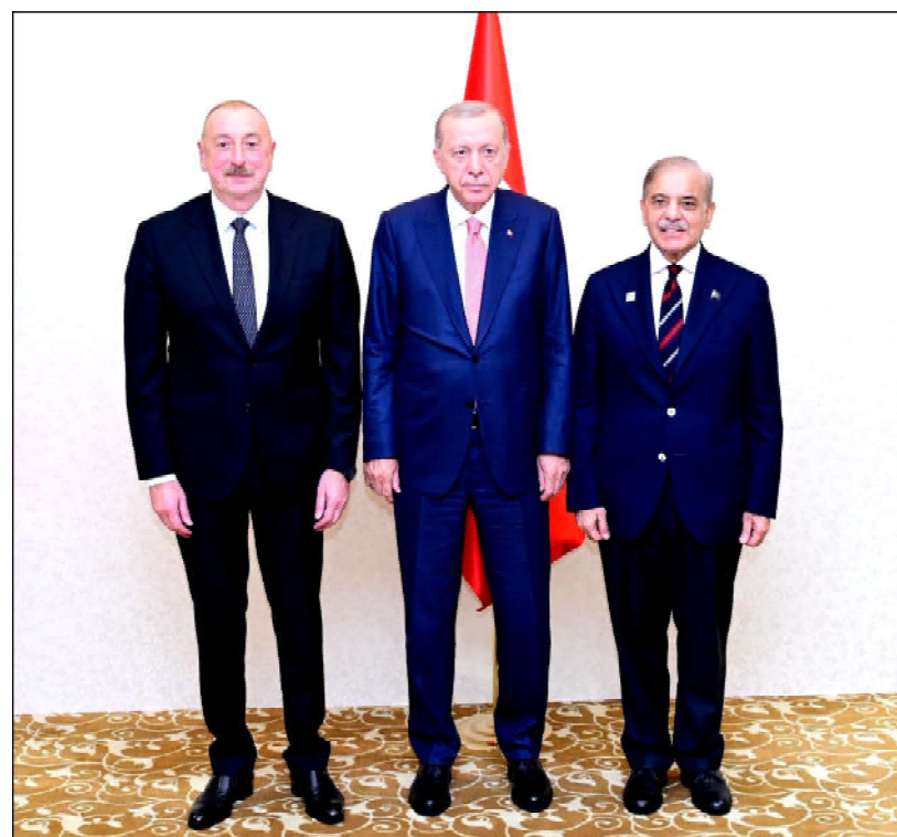
ASTANA: Prime Minister Muhammad Shehbaz Sharif in a group photo with the President of Turkiye H.E. Recep Tayyip Erdogan and President of Azerbaijan H.E. Ilham Aliyev on the occasion of an inaugural session of Pakistan-Turkiye-Azerbaijan Trilateral Summit on the sidelines of Shanghai Cooperation Organisation Summit.

trilateral cooperation in political, parliamentary and defence domains since the First Trilateral Meeting of Foreign Ministers of the three countries held in Baku in 2017, he affirmed Pakistan's commitment to working together with Turkiye and Azerbaijan to elevate the tripartite cooperation into a strong multifaceted partnership across all areas of mutual interest including economic, energy, tourism, cultural, educational, technology and innovation, healthcare and environmental cooperation. Emphasizing strong bonds of friendship and robust people-to-people contacts amongst the three countries, the prime minister also outlined significant potential for collaboration in the areas of culture, tourism, academia as well as science and technology. Pakistan, Turkiye and Azerbaijan have previously held trilateral consultations at the level of foreign ministers, speakers of parliaments, and defence person-