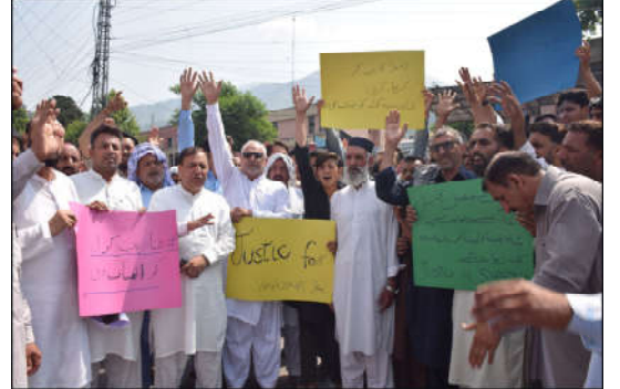
MUZAFFARABAD: The heirs of Shahbaz, who was abducted from Langarpura, are protesting with placards at Azadi Chowk for the recovery of the child.

companies interested in outsourcing in their respective areas.