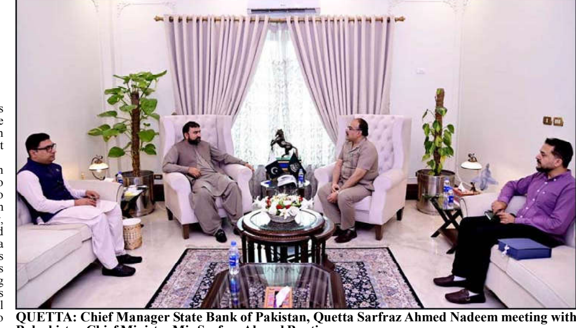
Balochistan Chief Minister Mir Sarfraz Ahmed Bugti.

The DAC also began enrolling stakeholders into the consortium, aiming to integrate key players from government, private sector, academic institutions, and agri-tech companies into a unified platform. This coalition is committed to advancing digital agriculture across Pakistan. The primary goal of the DAC launch was to highlight the consortium.