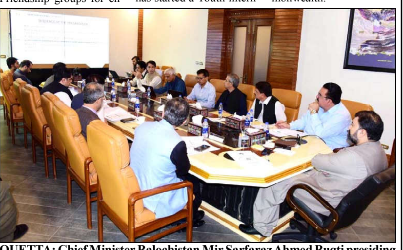
QUETTA: Chief Minister Balochistan Mir Sarfaraz Ahmed Bugti presiding over a meeting regarding Quetta Development Package and activation of QDA