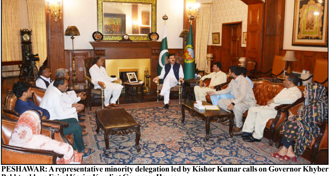
Pakhtunkhwa Faisal Karim Kundi at Governor House.