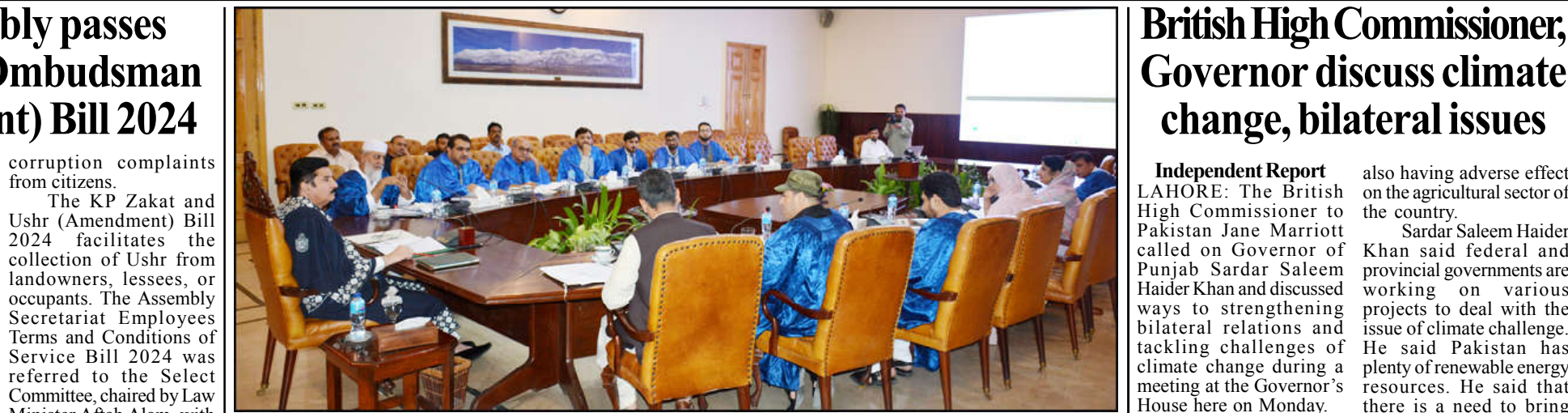
Minister Aftab Alam, with PESHAWAR: Governor Khyber Pakhtunkhwa Faisal Karim Kundi presides over the 4th senate meeting the Deputy Speaker and Advocate General as of the University of Agriculture D.I.Khan at Governor House.

Khan forming a committee to Adnan demanded that the matter tackle these issues.