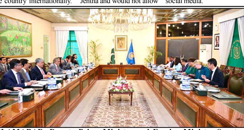
ISLAMABAD: Deputy Prime Minister and Foreign Minister Senator Mohammad Ishaq Dar holds meeting with Secretary General of the Commonwealth Patricia Scotland at the Ministry of Foreign Affairs.

velopment works and malign the country internationally. Pakistan committed to CW