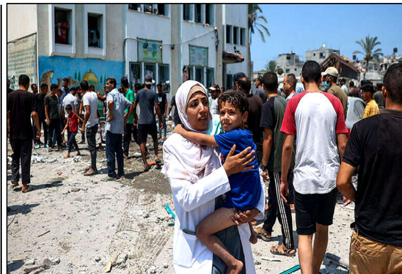
Palestinians inspect the damage following an Israeli strike on the Khadija school housing displaced people in Deir al-Balah, in the central Gaza Strip.

people running towards the place that was struck. The people sheltering in Khadija school are all wounded people, they are innocent and this should not happen to them," she said. On Saturday, the military said it had instructed Palestinians to evacuate the southern neighborhoods of Khan Younis and move to the Al-Mawasi humanitarian zone. Israeli attacks in Khan Younis on Saturday killed 14 people, health officials said. UN and humanitarian officials accuse Israel of using disproportionate force in the war and of failing to ensure civilians have safe places to go, which it denies. In the Israeli-occupied West Bank, Nabil Abu Rudeineh, spokes-person for Palestinian President Ma-h--moud Abbas, blamed the Israeli attacks on the support of the US.