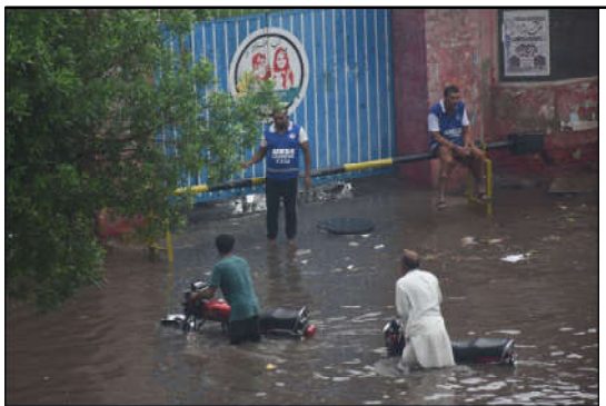
LAHORE: Garbage-clogged rainwater drains on the roads are a testimony to the inefficiency of the WASA.

from his people. "Perhaps they forgot that despite their strategies, Allah also has a strategy. Alhamdulillah, my leader returned, his disqualification was overturned, and the people gave him the mandate. Despite all conspiracies, Pakistan and its largest province, Punjab, are governed by Nawaz Sharif today," she concluded.