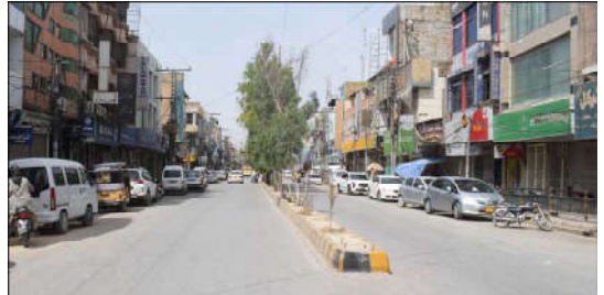
QUETTA: A view of deserted look of the road due to hot weather in Provincial capital.