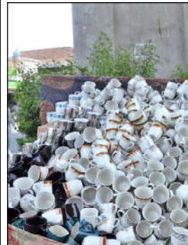
MULTAN: A vendor is busy displaying tea cups at roadside setup to attract the customers.