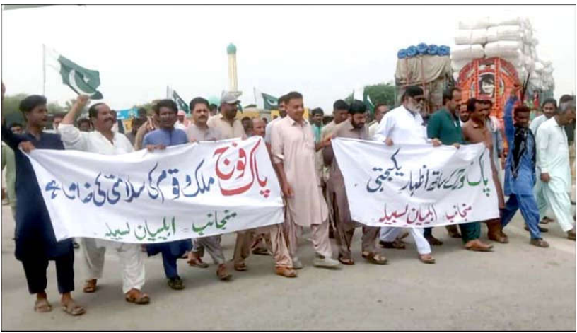
HUB: Residents of Lasbela are holding demonstration in favor Pakistan Army, held in Hub.