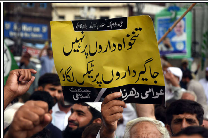
RAWALPINDI: Activists of Jamaat-e-Islami hold placard and chanting slogans during 3rd day of sit in protest (Dharna) against the country's rising inflation, at Murree road, in the city.