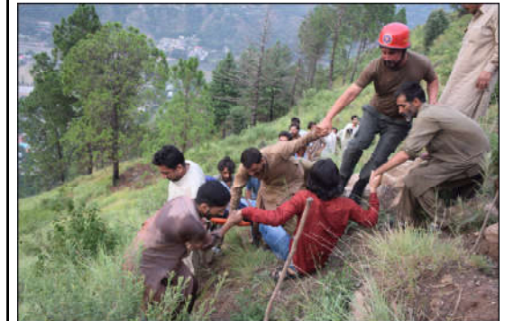
MUZAFFARABAD: Rescue 1122 officials transferring injured people to hospital with the help of people of the area.