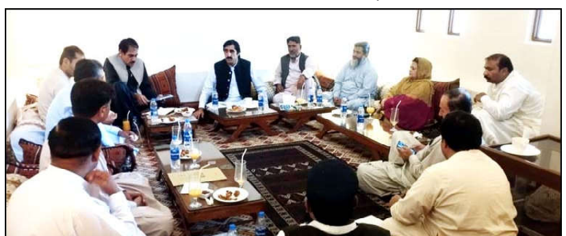
QUETTA: Provincial Minister for Food Haji Noor Muhammad Durrar presiding over review meeting regarding ongoing scheme of 2023-24 of Ziarat and Harnai

QUETTA: The session of Balochistan Assembly is scheduled to resume at 03:00 PM today (Monday). According to the Provincial Assembly's secretariat, the agenda of today's sitting has been issued. According to the agenda, the Provincial Minister for Finance, Mir Shoaib Nausherwani would table different audit reports. Besides, the motions would also be tabled on different matters would also be tabled in the today's session of assembly.