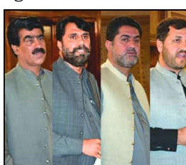
QUETTA: Provincial Ministers, Advisors and MPAs expressing their views during Balochistan Assembly session.

It was also pointed out that the employees of Rescue service have been facing hardships as such they may be regularized.it was decided to table it again.