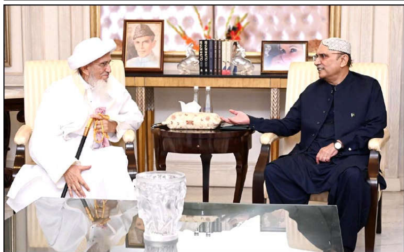
Dr Syedna Mufaddal Saifuddin, Head of the Dawoodi Bohra community, called on President Asif Ali Zardari at Bilawal House, Karachi.