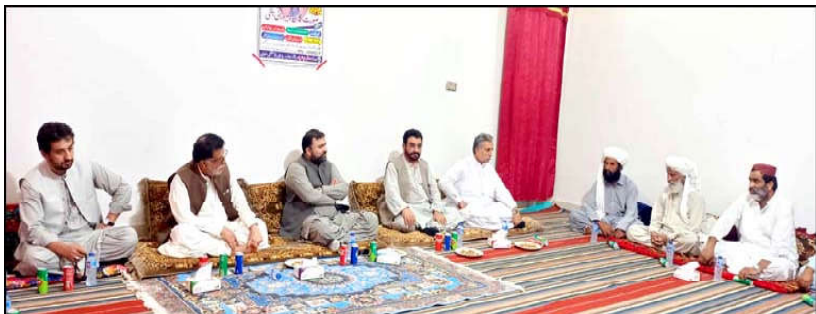
ERA BUGTI: A delegation of tribal elites meeting with Chief Minister Balochistan Mir Sarfaraz Ahmed Bugti

Ph: 2841470/2841473 Vol: XIX No. 157, Muharram 20, 1446 AH Saturday July 27, Pages 04, Price Rs.15