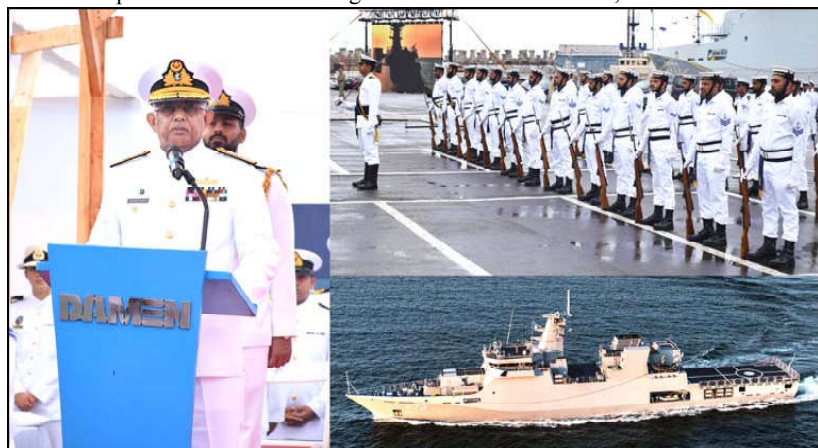
Chief of the Naval Staff Admiral Naveed Ashraf addressing the Commissioning Ceremony of Pakistan Navy Ship HUNAIN at Constanta Port, Romania.

In order to engage the educated youth of Pakistan, around 100 young fresh graduates had been recruited in the Parliament House through Young Parliamentary Associates program to serve in different departments, providing the much-needed research services, he said.