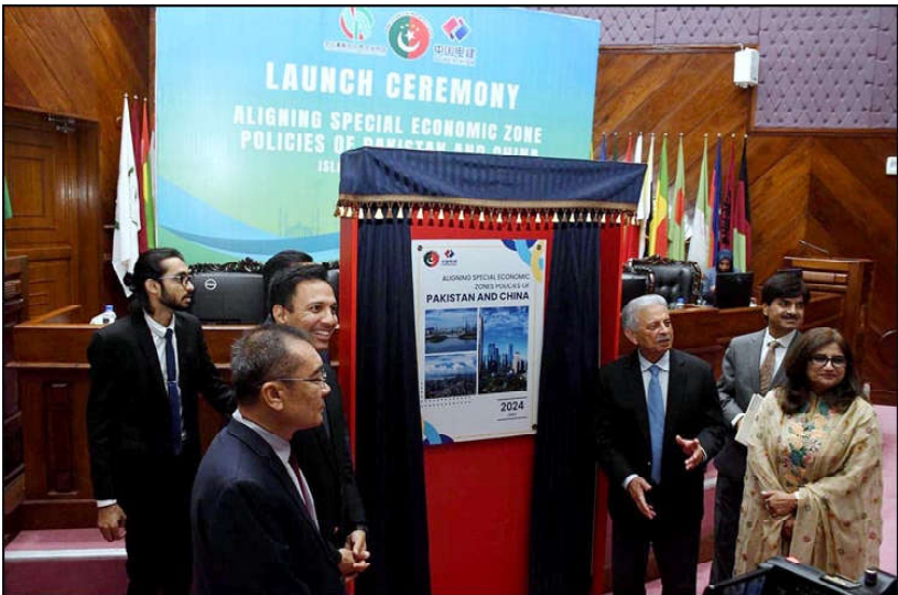
ISLAMABAD: Federal Minister for Industries and Production Rana Tanveer Hussain launched PCI - POWERCHINA SEZ Policy Report.

Cargo volume of 152,463 tonnes, comprising 95,995 tonnes imports cargo and 56,468 tonnes export cargo carried in 5,541 Containers (3,130 TEUs Imports & 2,411 TEUs Export) was handled at the port during last 24 hours.