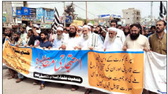
HUB: Activists of Jamiat Ulema-e-Islam (JUI-F) are holding protest rally for acceptance of their demands, in Hub.

The dead and injured were taken to Jinnah Hospital where supporters of both the groups remained present throughout the night.