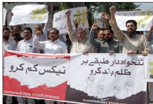
PESHAWAR: Members of Salaried Class Alliance are holding protest demonstration against high taxes on salaried class, at Peshawar press club.

To achieve this, the courses will be carefully crafted to integrate theoretical concepts with hands-on training, ensuring students are job-ready upon graduation, he mentioned. "Responding to a question, Provincial Minister for Education clarified that the government does not plan to build new school buildings for the Matric, Inter-Tech project, adding, instead, the existing infrastructure will be optimized by merging 600 to 700 school buildings, creating larger.