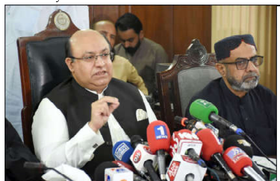
LAHORE: Punjab Finance Minister Mujtaba Shuja-ur-Rehman addressing a press conference at Punjab Assembly in the Provincial Capital.

joint initiative between P&SHD and NADRA is set to enhance birth registration processes, making Punjab the only province sharing this data directly with NADRA. This integration allows citizens to obtain birth certificates promptly, streamlining the process and ensuring accuracy. Khawaja Imran Nazir emphasized the vital role of Lady Health Workers (LHWs) in raising awareness among the public about this new system. He highlighted that the digitization initiative, including the record-sharing with NADRA, will facilitate a transition to a paperless system. He said that this move extends to government hospitals.