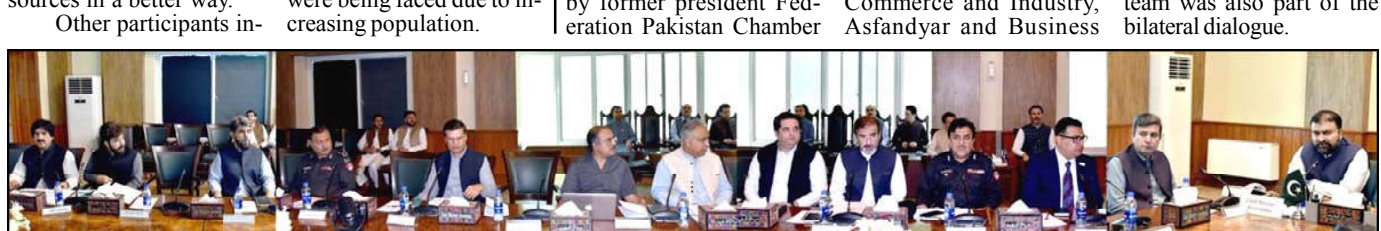
QUETTA: Chief Minister Balochistan, Mir Sarfraz Ahmed presiding over a meeting regarding preparation for Independence Day celebrations

and Resilient Societies through Sports". The adviser, with the status of federal minister has stated that the events of 11th Commonwealth Sports Ministers Meeting in Paris highlights the power of sports to unite, inspire, and drive positive change in our societies. He said the government has declared 2025 as the year of sports revival in Pakistan, with a dedication to promoting sports as a catalyst for social change. The Prime Minister's Youth Programme was driving this initiative by ensuring full participation and harnessing the full potential of Pakistan's youth.