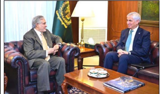
Secretary General ECO, Ambassador Khusrav Noziri called on Deputy Prime Minister and Foreign Minister Senator Muhammad Ishaq Dar at the Ministry of Foreign Affairs Islamabad.

ISLAMABAD (APP): Deputy Prime Minister and Foreign Minister Senator Muhammad Ishaq Dar discussed matters related to Pakistan-UNHCR cooperation with United Nations High Commissioner for Refugees Filippo Grandi in a telephonic conversation on Thursday. The recent attacks and violent demonstrations (by Afghani diaspora) against Pakistan's Diplomatic Missions in Frankfurt, London and Brussels also came under discussion.