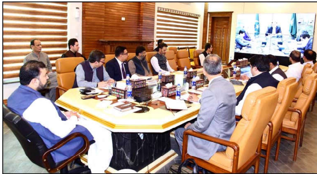
QUETTA: Chief Minister Balochistan, Mir Sarfraz Ahmed participating through video link in the high level meeting held with the Federal Minister for Planning and Development, Ahsan Iqbal in the chair in Islamabad

The committee also decided to request a judicial inquiry into the Bannu incident, while the government will conduct its own inquiry to determine individual responsibilities.