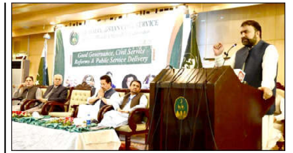
QUETTA: Chief Minister Balochistan, Mir Sarfraz Ahmed addressing a seminar on "good governance, civil service reforms and public service delivery" organized by the Balochistan Civil Service (Executive Branch) Officers Welfare Association here at the Sikandar Jamali Auditorium, Civil Secretariat

He emphasized that both countries have a longstanding partnership. Later, Senator Muhammad Aurangzeb and Sardar Awais Ahmad Khan Laghari also held a useful meeting with the President of China Export and Credit Insurance Corp at its Headquarters and discussed the latest reform agenda of the government of Pakistan. During the meeting, both ministers lauded SINOSURE's role in the development of Pakistan, particularly during the first phase of CPEC. They showed confidence that SINOSURE will continue its full support for completing ongoing and new projects under the second phase of CPEC especially now led by the private sector.