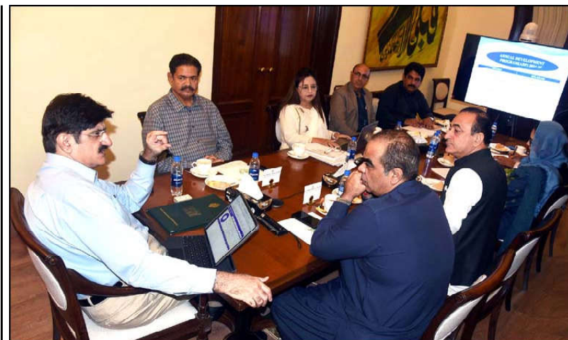
KARACHI: Sindh Chief Minister, Syed Murad Ali Shah presides over a meeting of the Minorities Affairs Department held at CM House in Karachi.