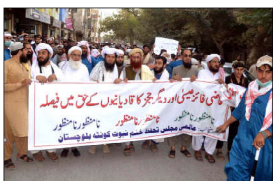
QUETTA: Members of Aalmi Majlis Tahafuz-e-Khatam-e-Nabuwat (PBUH) are holding protest demonstration for acceptance of their demands, at Quetta press club.

He said that it is necessary to set up meet of office of the rehabilitation projects in Quetta. He on the occasion suggested to include Chief Secretary and Additional Chief Secretary Development in the committee formed for review of the projects.