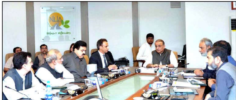
ISLAMABAD: Federal Minister for Communications, Privatization and Board of Investment, Abdul Aleem Khan chaired a high-level meeting of the National Highway Authority.

spending money was not a miracle so the Government departments have to take steps to raise their income. He further said that the officers of the NHA should take advantage of their abilities and expertise to develop a model of working on projects in other countries as well so that the annual income of the Authority could be increased. Regarding the construction of highways and roads in the northern region, Abdul Aleem Khan said that the construction of the Gilgit-Khunjab Motorway could prove to be a game changer by providing access to China and Central Asian States.