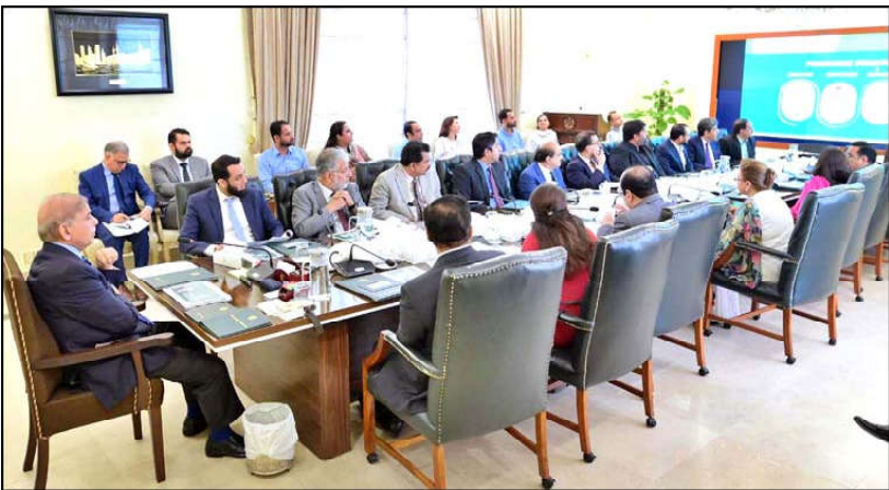
ISLAMABAD: Prime Minister Muhammad Shehbaz Sharif chairs a meeting regarding Prime Minister's Youth Programme.