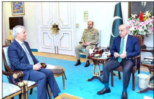
ISLAMABAD: Outgoing Secretary General of ECO H.E. Khusrav Noziri called on Prime Minister Muhammad Shehbaz Sharif.

The prime minister also stated that Pakistan was proud that the incoming Secretary General of ECO would be Dr. Asad Majeed Khan, former Foreign Secretary of Pakistan. The Secretary General conveyed his gratitude for Pakistan's consistent support to him during his tenure as Secretary General ECO.