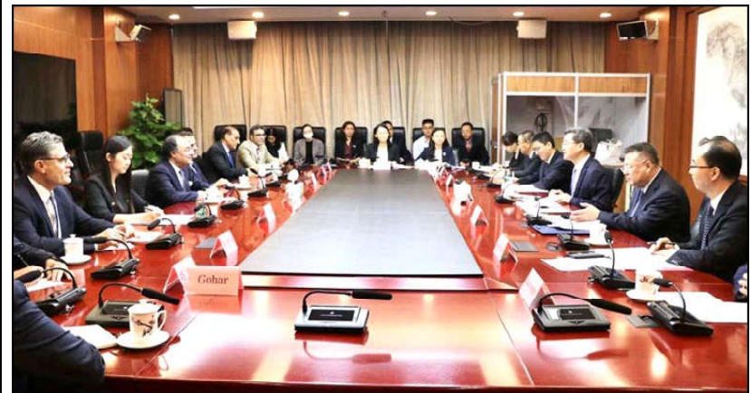
BEIJING: Senator Muhammad Aurangzeb, Federal Minister for Finance & Revenue and Sardar Awais Ahmad Khan Laghari, Minister for Energy (Power Division) in a bilateral meeting with Chinese Minister of Finance Lan Fo'an.

the government's top priority. He said all the training programmes at National Vocational and Technical Training Commission (NVTTC) should be focused on creating job opportunities for the students. He directed to conduct a detailed survey of job market and then accordingly start the skill training programmes. During the meeting, it was informed that under PM Laptop Scheme, some 600,000 laptops had so far been delivered to the students. Under this scheme, the government would provide additional 100,000 laptops during current year. The meeting was informed that 64% students who got training under the Youth Skills Development Programme managed to get respectable jobs during previous three years.