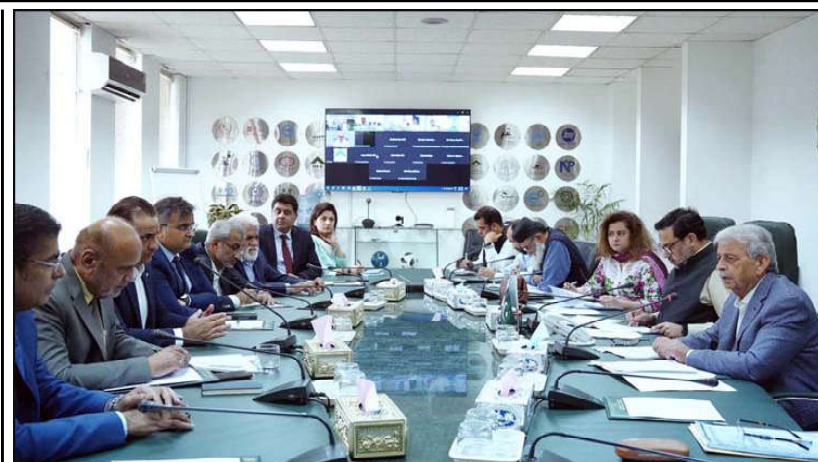
ISLAMABAD: Federal Minister for Industries and Production, Rana Tanveer Hussain presided over a meeting of the Sugar Advisory Board (SAB).

ISLAMABAD (APP): Pakistan's exports to the seven regional countries witnessed an increase of 20 per cent during the fiscal year (2023-24) as compared to the corresponding period of last year. "The country's exports to the regional countries including Afghanistan, China, Bangladesh, Sri Lanka, India, Nepal, and the Maldives account for a small amount of $4334.467 million, which is 13.94 per cent of Pakistan's overall exports of $31,090.229 million during July-June (2023-24)," State Bank of Pakistan (SBP) reported.