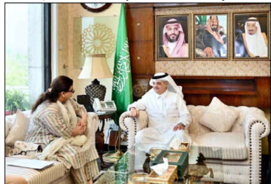
ISLAMABAD: Minister of State for IT and Telecommunication Ms. Shaza Fatima Khawaja in a meeting with Ambassador of the Kingdom of Saudi Arabia to Pakistan H.E. Nawaf bin Saeed Ahmad Al-Malkiy.

KARACHI (APP): Four ships, EF Amma, Ceylon Breeze, Xin Hai Tong and Bateleur scheduled load/offload Container, Cement, Coal and LPG, berthed at Qasim International Container Terminal, Multi-Purpose-2 & 4 Terminals and Sui Southern Gas Terminal respectively on Wednesday. Meanwhile two more ships, Gulf Diamond and Epic Sunter scheduled to load/offload Rice and LPG are also arrived at outer-anchorage of the Port Qasim on today early morning. A total of seven ships were engaged at POA berths during the last 24 hours, out of them three ships, EF Emma, Hafnia Seine and Al-Thakira left the port on today morning while another ship "Fisher" is expected to sail on today afternoon. Cargo volume of 53,395 tonnes, comprising 42,570 tonnes imports cargo and 10,825 tonnes export cargo carried in 315 Containers (315 TEUs Imports).