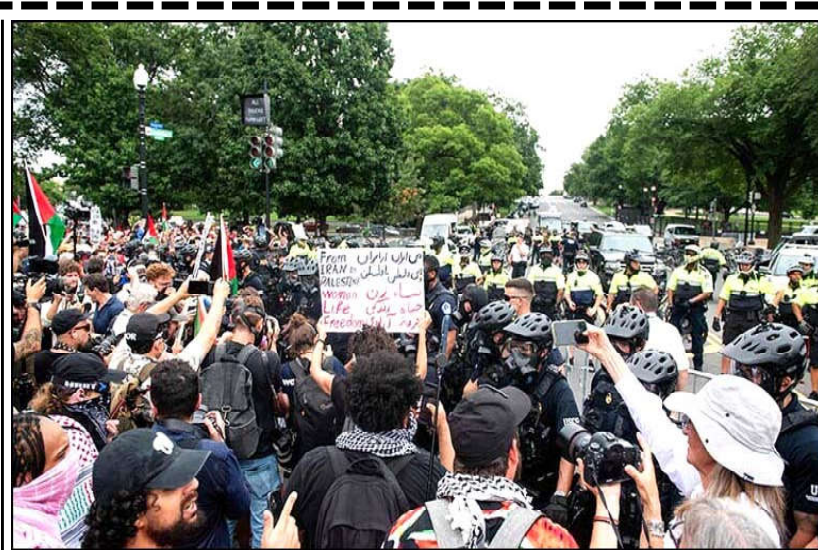
Riot police confront pro-Palestinian demonstrators as they protest near the US Capitol as Israeli Prime Minister Benjamin Netanyahu addresses a joint meeting of Congress.

who formed a circle around several people who were arrested. One person grabbed at a police officer's riot shield and then raised his fists in a fighting stance. An officer was seen grabbing a Palestinian flag from a woman and tossing it aside. At least one protester appeared to be overcome from the effects of pepper spray. Cheers rang out as a fire burned what appeared to be a papier-mache likeness of Netanyahu. Protesters spray painted graffiti on a monument to Christopher Columbus, including the words, "Hamas is coming" in large red letters. "Free Gaza" was scrawled in green. Among the protesters was a group of artists from Baltimore displaying a massive papier-mache sculpture meant to depict President Joe Biden with blood on his hands and devil horns.