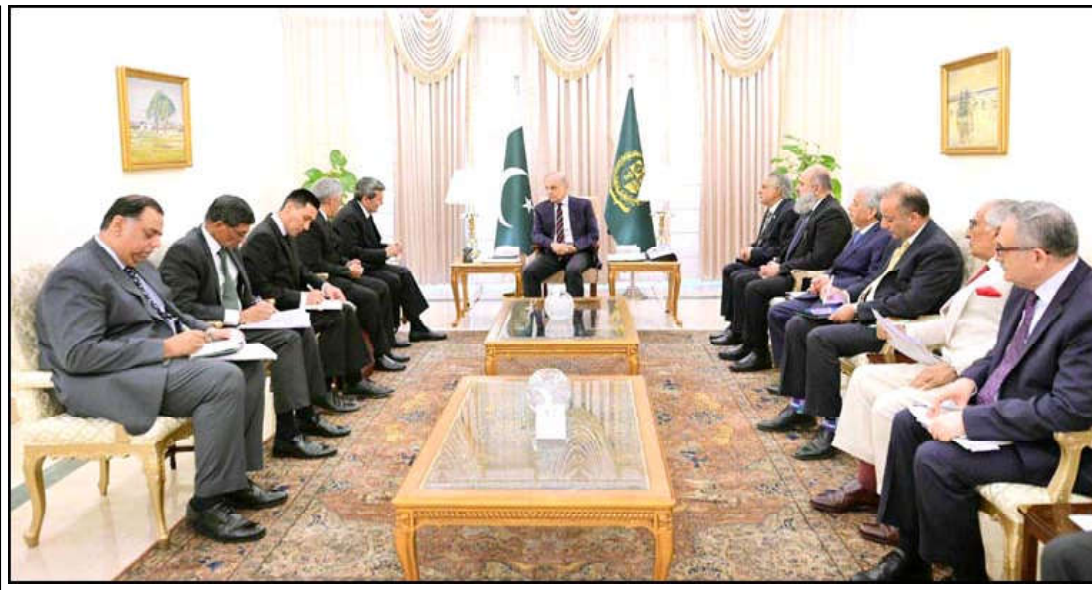
ISLAMABAD: Foreign Minister of Turkmenistan H.E. Rashid Meredov called on Prime Minister Muhammad Shehbaz Sharif.

It may be mentioned here that Zhob-Wana road is an alternate route to Zhob-Dahna sar road, which otherwise used to