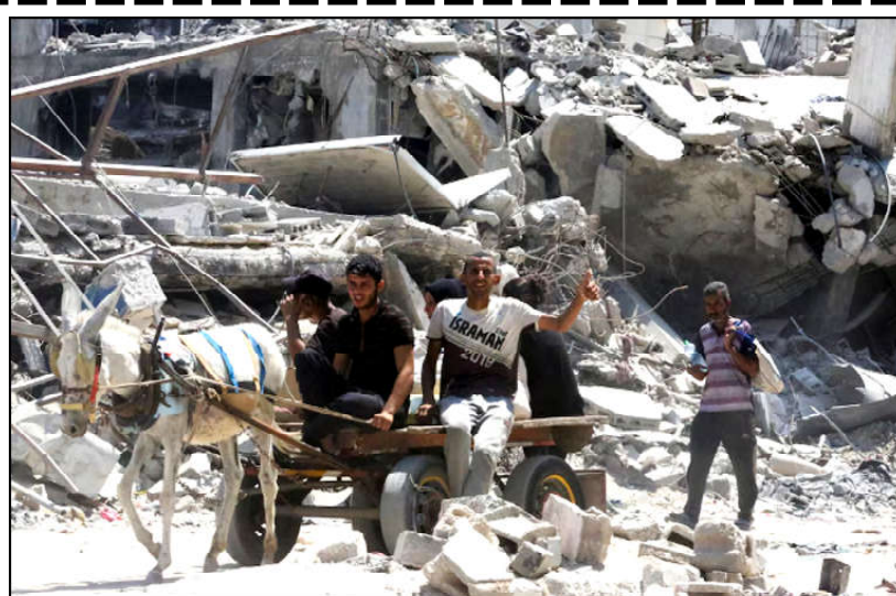
Palestinians flee the eastern part of Khan Yunis as they travel in an animal-drawn cart after they were ordered by Israeli army to evacuate their neighborhoods, amid Israel-Hamas conflict, in Khan Yunis in the southern Gaza Strip.