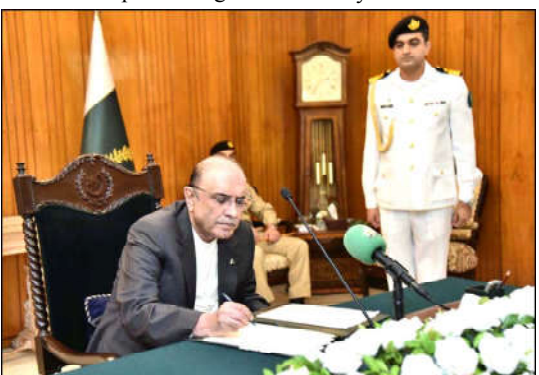
ISLAMABAD: President Asif Ali Zardari is signing the Christian Marriage (Amendment) Act 2024 into law in a special ceremony held at Aiwan-e-Sadr.

He expressed his gratitude to the President for signing the Act into law during a special ceremony and also thanked him for his role in his previous tenure in reserving a 5% quota for minorities in government jobs, besides allocating special seats for minorities in the Senate as well as declaring 11th August as Minorities' Day in Pakistan.