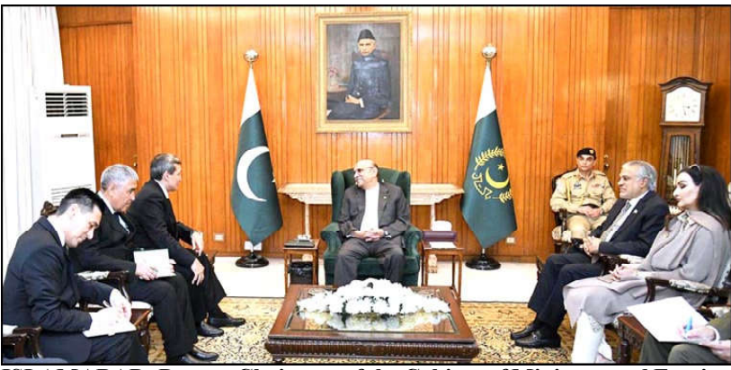
ISLAMABAD: Deputy Chairman of the Cabinet of Ministers and Foreign Minister of Turkmenistan, Mr. Rashid Meredov, called on the President Asif Ali Zardari, at Aiwan-e-Sadr, Deputy Prime Minister, Senator Mohammad Ishaq Dar, was also present on the occasion.