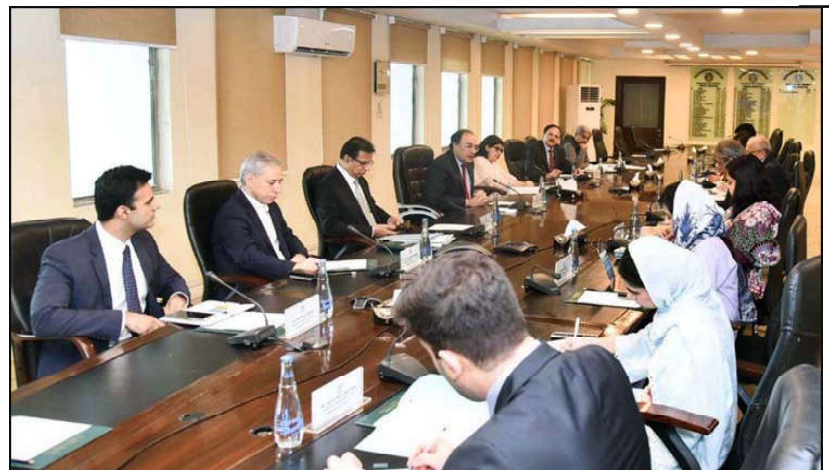
ISLAMABAD: Federal Minister for Finance & Revenue Senator Muhammad Aurangzeb in a virtual meeting with the Representatives from Moody's Ratings.