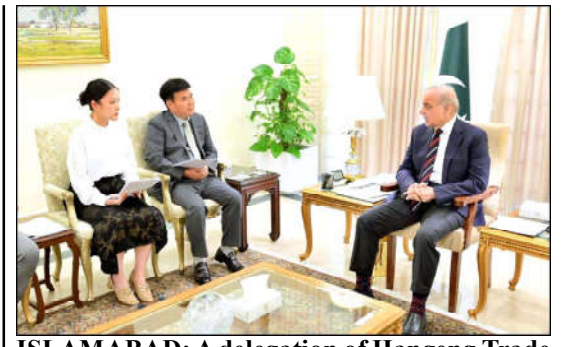
ISLAMABAD: A delegation of Hangeng Trade Company calls on Prime Minister Muhammad Shehbaz Sharif.

ISLAMABAD (APP): President Asif Ali Zardari has called for expanding bilateral ties with Turkmenistan across all areas of mutual interest and reaffirmed Pakistan's strong commitment to its relationship with Turkmenistan. The President expressed these views while talking to the Deputy Chairman of the Cabinet of Ministers and Minister for Foreign Affairs of Turkmenistan, Rashid Meredov, who called on him, at Aiwan-e-Sadr. President said that Pakistan-Turkmenistan relations were based on a common vision for peace and prosperity in the region. The exchange of high-level visits between the two countries signified the mutual desire to further strengthen bilateral understanding and cooperation. Welcoming the Minister, the President urged the need to enhance connectivity and communication between Pakistan and Turkmenistan, saying that Gwadar port offered great opportunities for promoting regional trade and Turkmenistan should benefit from the port. The President stressed the need for continued exchanges and dialogue at all levels and enhanced trade, economic, investment and cultural relations for the prosperity of the two countries. He offered that Turkmen students could seek education from the medical institutions of Pakistan. The President noted the importance of the Third Round of Bilateral Political Consultations held today by the