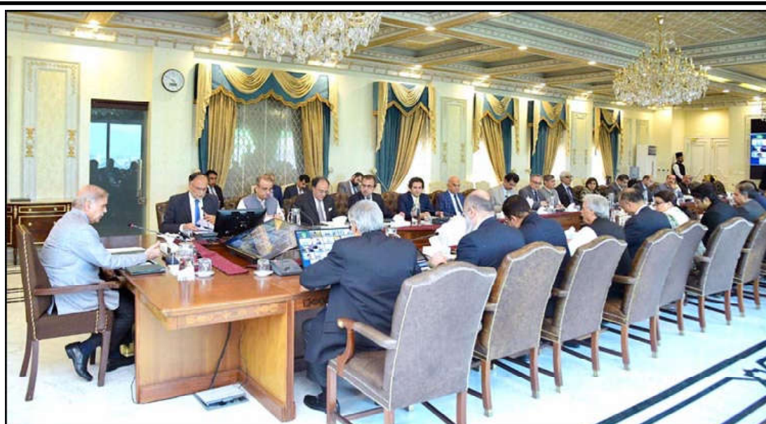
ISLAMABAD: Prime Minister Muhammad Shehbaz Sharif chairs a meeting of National Export Development Board (NEDB).

He also called for carrying out research and development, innovation and brand development.