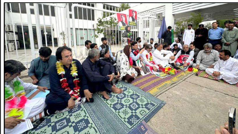
ISLAMABAD: Members National Assembly of Opposition parties sits outside Parliament House during hunger strike protest in favor of their demands in the Federal Capital.

The deputy prime minister highlighted Pakistan's investment climate, particularly the special role of the Special Investment Facilitation Council (SIFC) and invited Turkmen companies to benefit from the conducive investment climate and opportunities in Pakistan.