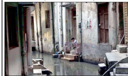
RAWALPINDI: A view of rain water accumulated in the street at Imambara Mohallah after rain that experienced the Twin Cities.