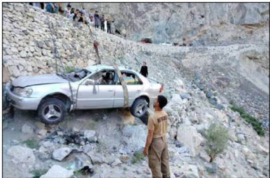
GILGIT: Rescue 1122 crew in action, expertly lifting a car from the ditch after an accident.

resolve their problems on priority basis. Governor Faisal Kundi also expressed his intent to collaborate closely with the federal government, to resolve issues facing journalists. In reference to provincial assembly rights, he assured support from Parliamentary leader of PPP, Ahmed Kundi and others, advocating for increased public engagement across different regions. Protecting Peshawar's cultural heritage and promoting interfaith harmony were also highlighted as priorities. Governor Faisal Kundi criticized the provincial government for misstatements in court, noting disparities in university funding compared to Sindh.