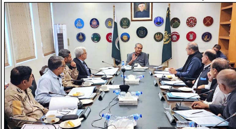
ISLAMABAD: Federal Minister for Interior and Narcotics Control Mohsin Naqvi chairing a meeting of Committee regarding National Drug Survey.

data collected will enable policymakers to make informed decisions in the fight against narcotics. Naqvi emphasized the importance of accurate survey data, stating that it will be crucial in shaping effective anti-narcotics strategies. He directed the relevant authorities to finalize the survey methodology and timeline within 15 days.