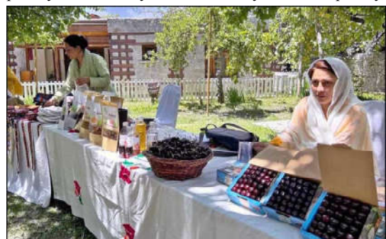
HUNZA: Business women of local community displaying cherry for selling purpose for tourists.