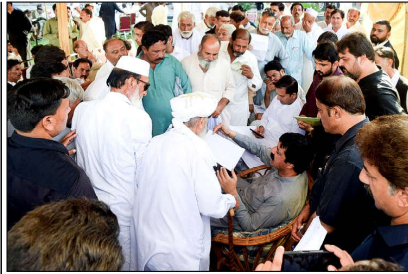
LAHORE: Governor Punjab Sardar Saleem Haider listening the problems of the people during open court for solving public problems in Punjab House Rawalpindi.

of Ashura processions in the Commissioner's Office Rawalpindi. Later, Governor Punjab also visited Safe City Control Room and Control Room established in TMA office. During the visit, the Punjab Governor reviewed the process of monitoring the routes of the processions. He lauded the administration for making fool proof security arrangements and expressed satisfaction over the security arrangements. Commissioner Rawalpindi Aamer Khattak, RPO Rawalpindi Babar Sarfraz Alpa, DC Rawalpindi, Hasan Waqar Cheema and other administrative officers were also present on this occasion.