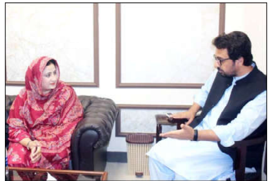
QUETTA: Parliamentary Secretary Population Hadia Baloch meeting with Provincial Finance Minister Mir Shoaib Nausherwani

The provincial minister gave full assurance to the lawyers to resolve their problems.