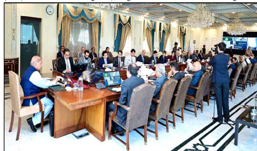
ISLAMABAD: Prime Minister Muhammad Shehbaz Sharif chairs a review meeting on the reforms and digitisation of the Federal Board of Revenue.