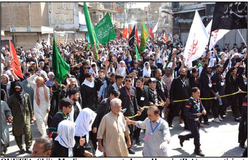
QUETTA: Shiite Muslims mourners to Imam Hussain (R.A) are participating religious procession to show their devotion and respect for cradle as they remember the martyrs of Karbala, during Ashura mourning procession in connection of 10th Muharram-ul-Haram, in Quetta.