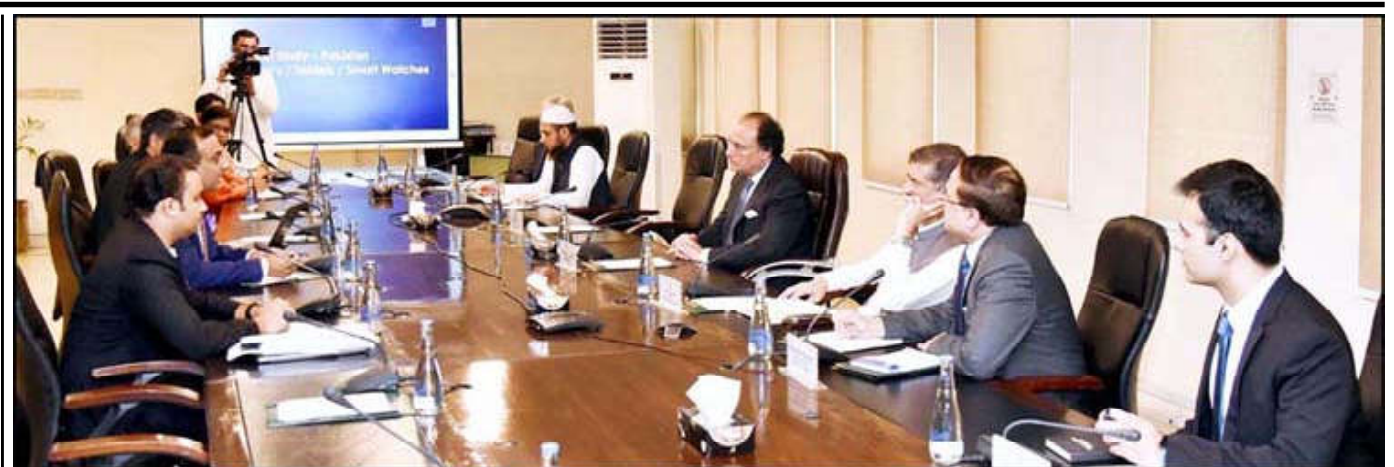
ISLAMABAD: Federal Minister for Finance and Revenue Senator Muhammad Aurangzeb in a meeting with the delegation of Pakistan Mobile Phone Manufacturers Association (PMPMA).

Eight ships were engaged at PQA berths during the last 24 hours, out of them six ships, X-Press Antaila, Zhong Gu Bo Hai, Ardmore Cherokee, Maya Gas-1, Sea Destiny and Horizon-1 are expected to sail on Thursday. Cargo volume of 59,341 tonnes, comprising 51,351 tonnes imports cargo and 7,990 tonnes export cargo carried in 1,119 Containers (649 TEUs Imports and 470 TEUs export) was handled at the port during last 24 hours.