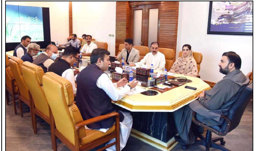
QUETTA: Balochistan Chief Minister Mir Sarfaraz Ahmed Bugti presiding over a meeting regarding preparation for Council of Common Interest (CCI)

The meeting reviewed the matters about upcoming meeting of the Council of Common Interests (CCI). Addressing the meeting, Chief Minister said that the interests of province would be given preference in the next meeting of CCI at every cost, and all the decisions would be made keeping in view the public interest. He said that it is the endeavour of provincial government to present the case of province at federal level in wholehearted manner and take practical steps for overall development and prosperity of the province resolving the issues of province with the federal government. Moreover, the Chief Minister also reiterated the government's resolve to make utmost efforts to ensure acquisition of the receipts out of the province's resources from the federal government.