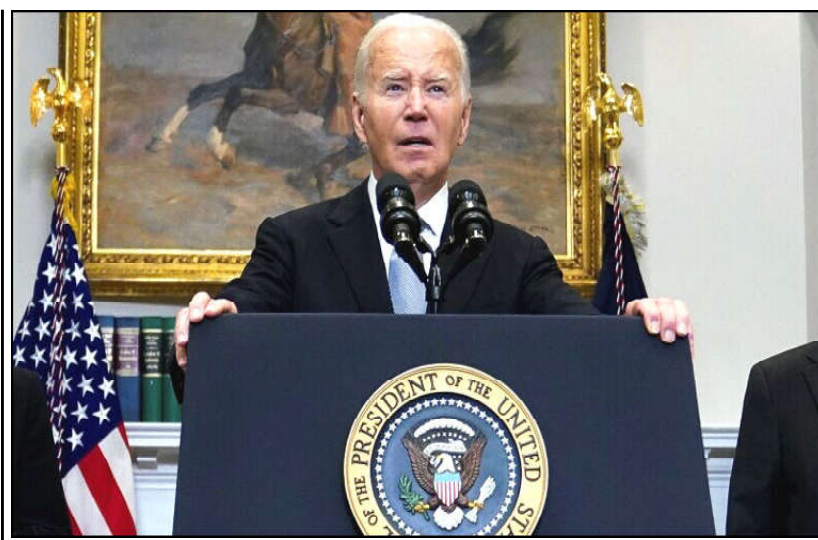
US President Joe Biden delivers a statement a day after Republican challenger Donald Trump was shot at a campaign rally, during brief remarks at the White House in Washington, US.

The Israeli military said its air force "struck a number of terrorists who were operating in the area of UNRWA's Abu Araban school building in Nuseirat". It said the building had "served as a hideout" and base for "attacks" on Israeli troops. AFP TV images showed the three-storey complex standing, with clothes and bedding airing out over its railings. A wall bearing the UN logo had been blown out, and rooms inside were damaged. On July 6, Israeli aircraft hit Al-Jawni school, also run by the United Nations relief agency for Palestinian refugees (UNRWA), in Nuseirat. UNRWA said about 2,000 people were sheltering there at the time. The following day, four people died in a strike