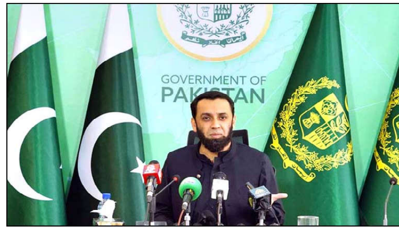
ISLAMABAD: Federal Minister for Information and Broadcasting, Attaullah Tarar addressing a press conference.

events that set off in a form of chain, gave a clear understanding of the anti-state agenda of the PTI which first brought terrorist back into the country and then attacked on the state institution to undermine its sovereignty. On the one hand, they were giving shelter and safe heavens to the terrorists and on the other hand they resorted to attack the army installations including the Corps Commander House in Lahore, he said asking the PTI's founder who gave him the authority to bring back disgruntled elements in settled areas. The minister said the party used the prohibited funding to hire lobbying firms that worked to damage the integrity of the country. The minister said the Election Commission of Pakistan (ECP) had given a verdict that the PTI had received prohibited funding, recalling how delaying tactics were used to prevent further proceeding in the case during the tenure of the PTI government.