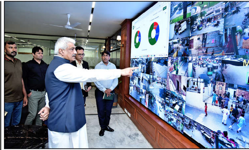
LAHORE: Punjab Minister for Health and Chairman Cabinet Committee for Law and Order Khawaja Salman Rafique being briefed about security arrangements during Muharram ul Haram at Control Room of Home Ministry.

each information before taking any steps. In this connection, hot spots should be monitored strictly in addition to keeping a close liaison with religious scholars of all schools of thoughts and members of peace committees, she added. Earlier, Deputy Commissioner (DC) Abdullah Nayar Sheikh briefed the minister about administrative and security arrangements in Faisalabad and said that 387 CCTV cameras were made functional across the district to monitor Muharram security in addition to keeping vigil eye on the movement of suspects.