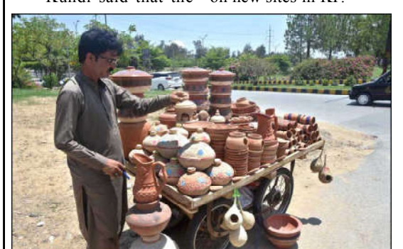
ISLAMABAD: A vendor arranging and displaying clay pottery on handcart to attract the customers at his roadside setup in the Federal Capital.

The MD PSO said that PSO had a big market and they were also working on new sites in KP.