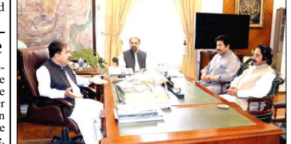
QUETTA: Former Provincial Minister Mir Abdul Karim Nausherwani meeting with Governor Balochistan Sheikh Jaffar Khan Mandokhail