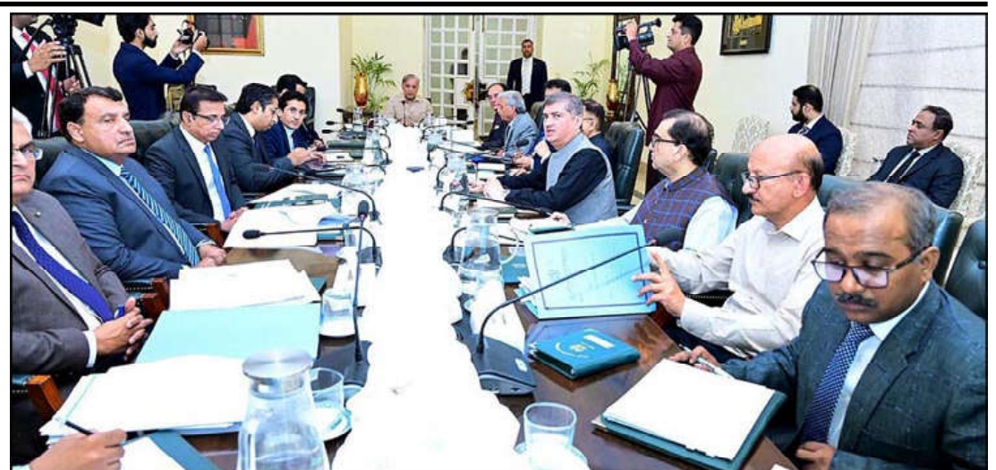
ISLAMABAD: Prime Minister Muhammad Shehbaz Sharif chairs a meeting on restructuring of Wheat Board and matters related to PASSCO.

The meeting approved the restructuring of Wheat Board.