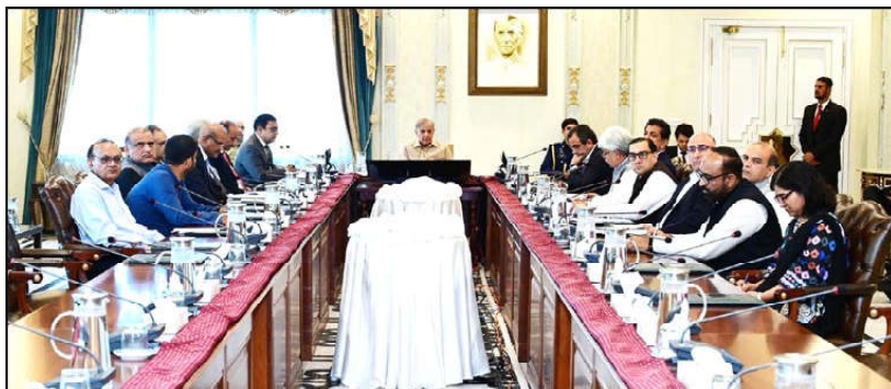
ISLAMABAD: Prime Minister Muhammad Shehbaz Sharif chairs a meeting on solarization of agriculture tubewells and anti-power theft campaign.

ISLAMABAD (APP): Prime Minister Muhammad Shehbaz Sharif on Friday vowed that after Balochistan, the federal government would also work in collaboration with the governments of Punjab, Sindh and Khyber Pakhtunkhwa for the welfare of farmers regarding the conversion of agricultural tube wells to solar energy. Chairing a meeting on solarization of agriculture tube wells and anti-power theft campaign at the PM House, the prime minister highlighted that solar energy was the cheapest source of producing electricity, therefore promoting the solar energy in the country had become the government's top priority. The prime minister directed the relevant authorities to prepare a comprehensive strategy after consultation with the provincial governments regarding the conversion of agricultural tube wells to solar energy in the provinces. In the meeting, the prime minister was told that shifting diesel-powered agricultural tube wells to eco-friendly solar energy would save US$ 2.7 billion in foreign exchange. PM Shehbaz also instructed to formulate a comprehensive plan to further improve electricity theft prevention measures. The prime minister appreciating the provincial governments for their cooperation with the Power Ministry to prevent electricity theft, directed the authorities concerned to present a comprehensive plan to introduce smart metering system in the country.