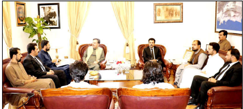
QUETTA: A delegation of lawyer fraternity led by Advocate Asal Khan meeting with Governor Balochistan Jaffar Khan Mandokhail

the LHC through Advocate Nadeem Sarwar, making the prime minister, the federal government and the Pakistan Telecommunication Authority (PTA) respondents. The petitioner contends that the constitution allows the privacy and freedom of speech to citizens. And phone tapping is a clear-cut violation of the constitution according to the Indian Supreme Court, he argues.