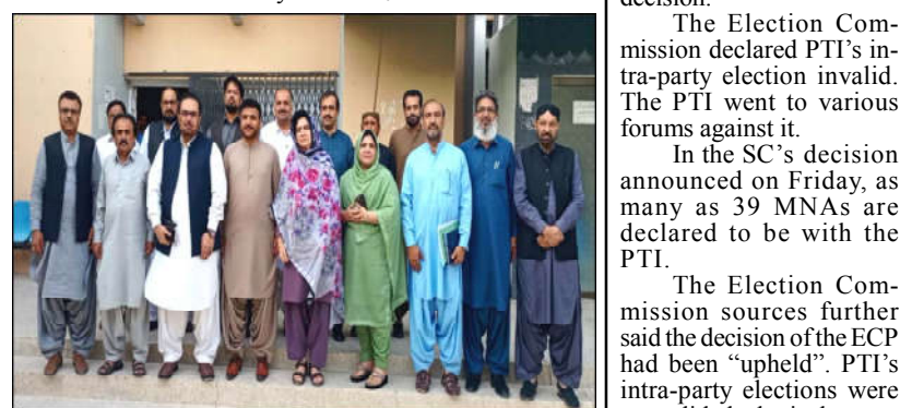
QUETTA: Provincial Education Minister Raheela Hameed Khan Duurrani in a group photo with staff during his visit to Board of Intermediate and Secondary Education

Monitoring Desk ISLAMABAD: Enjoying a D-Day after the Supreme Court's verdict in the reserved seats case earlier today (Friday), the Pakistan Tehreek-e-Insaf (PTI) is expected to emerge as the largest party in the National Assembly as the number of Imran Khan-led party is likely to soar to 109. In an unexpected legal victory for the main opposition party, the top court of the country ruled that the party of incarcerated Imran Khan is eligible for the allocation of reserved seats. The decision has not only paved the way for the PTI's return to parliament, which was kicked out of the February 8 polls owing to the ECP's December 2023 ruling but has also increased the pressure on the coalition alliance by changing the composition of the National Assembly.