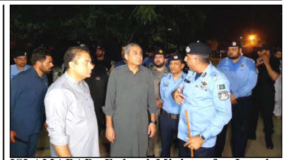
ISLAMABAD: Federal Minister for Interior Mohsin Naqvi visiting Markazi Asna Ashri Imam Bargah in G-6.

cohesive and unified front against global challenges." About the second proposal, he remarked that true synergy is achieved through robust collaboration. Initiatives such as the Belt and Road Initiative (BRI) and the Global Development Initiative (GDI) provide excellent examples of how regional and global collaboration can amplify national efforts. Ahsan Iqbal pointed out that a prime example of this collaboration is the China-Pakistan Economic Corridor (CPEC), adding, the CPEC has significantly contributed to sustainable development in Pakistan by enhancing infrastructure, boosting energy production, and creating economic opportunities. The development of new highways and railways under CPEC has improved connectivity, facilitating trade and economic growth. Additionally, CPEC projects in renewable energy, such as wind and solar power plants, have increased Pakistan's energy capacity while promoting cleaner, sustainable energy sources. "We must foster partnerships that transcend borders, encouraging public-private partnerships,