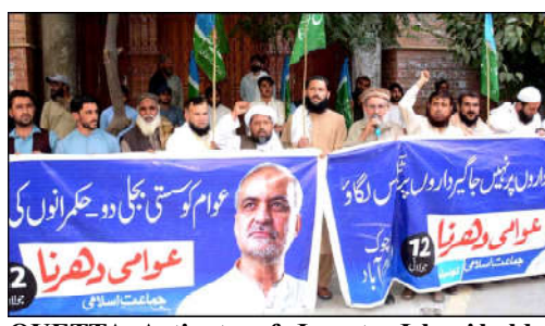
QUETTA: Activates of Jamat-e-Islami hold protest against price hike.

DG KHAN (APP): Torrential rainfall at Rakhi Gaj located the tribal area of Fort Munro in Koh-e-Suleman caused huge damage across the area, official source informed. The big landslide was witnessed at about 10 km area of Rakhi Gaj, the tribal part of Koh-e-Suleman. The landslide resulted in breakage of huge cliff of mountains that fell off on inter provincial highway, Quetta Road. The landslide occurred due to the cracking of the mountain, leading to substantial debris falling onto the highway. According to officials, the highway closure resulted in long vehicle queues on both sides. Commuters and travellers are experiencing significant disruptions and delays due to the blockage. The spread of huge boulders at place to place almost came to halt the two-way traffic from Blochiston to Punjab and Fort Munro.