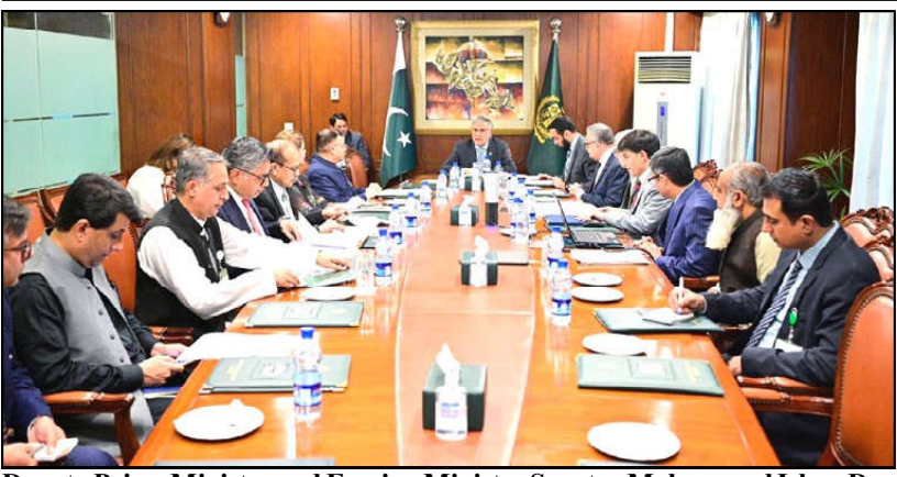
Deputy Prime Minister and Foreign Minister Senator Mohammad Ishaq Dar chairs the first meeting of High-Level Committee on the Requirements and Arrangements for the SCO Council of Heads of Government (CHG) Meeting to be held in Islamabad (15-16 October 2024) at Ministry of Foreign Affairs