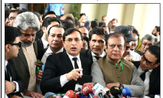
ISLAMABAD: Chairman of the Pakistan Tehreek-e-Insaf Gohar Ali Khan talking with media persons after the PTI reserved seats case outside supreme court in the Federal Capital.

ISLAMABAD (INP): Federal Minister for Information, Broadcasting, Culture and National Heritage Attaullah Tarar has said that in issue relating reserved seats in the Parliament, Pakistan Tehreek-e-Insaf (PTI) needs to confess its mistakes instead of maligning the Election Commission of Pakistan (ECP). Ironically, it was portrayed that all in the country were guilty except the PTI, he added. In a statement on Friday in response to the PTI's propaganda against the ECP, he said it was the PTI which failed to hold intra-party election in accordance with the law besides not submitting declaration and party tickets to the concerned. Attaullah Tarar said that the PTI also failed to join any party which had presence in the Parliament. "In this case, they did not request to be declared as MNA of the PTI," he added. The information said that the PTI after all these blunders did not have the right to question the ECP's credibility. Ironically, it was portrayed that all in the country were guilty except the PTI, he added.