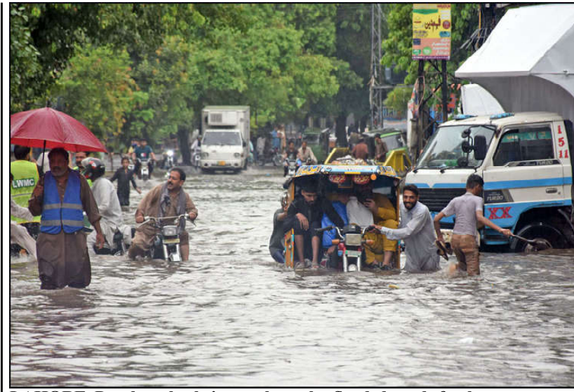
LAHORE: People make their way through a flooded road after heavy monsoon rains in the Provincial Capital.

LAHORE (APP): At least 11 people were killed and 1,298 others injured in 1,266 road accidents in Punjab during the last 24 hours. As many as 570 people with serious injuries were shifted to different hospitals, while 728 with minor injuries were treated at the incident site by rescue medical teams. The data analysis showed 720 drivers, 58 underage drivers, 148 pedestrians, and 441 passengers were among the victims of road crashes. The statistics showed that 300 accidents were reported in Lahore, which affected 320 persons, placing the provincial capital at top of the list, followed by Faisalabad with 108 accidents and 114 victims, and at third Multan with 75 accidents and 66 victims.