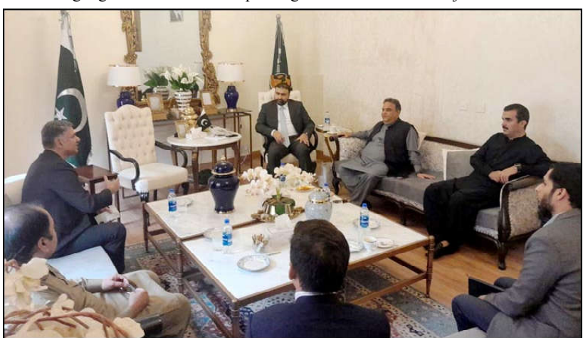
ISLAMABAD: A delegation of Fauji Fertilizers Company Pakistan meeting with Chief Minister Balochistan Mir Sarfaraz Bugti. Senator Danesh Kumar is also present