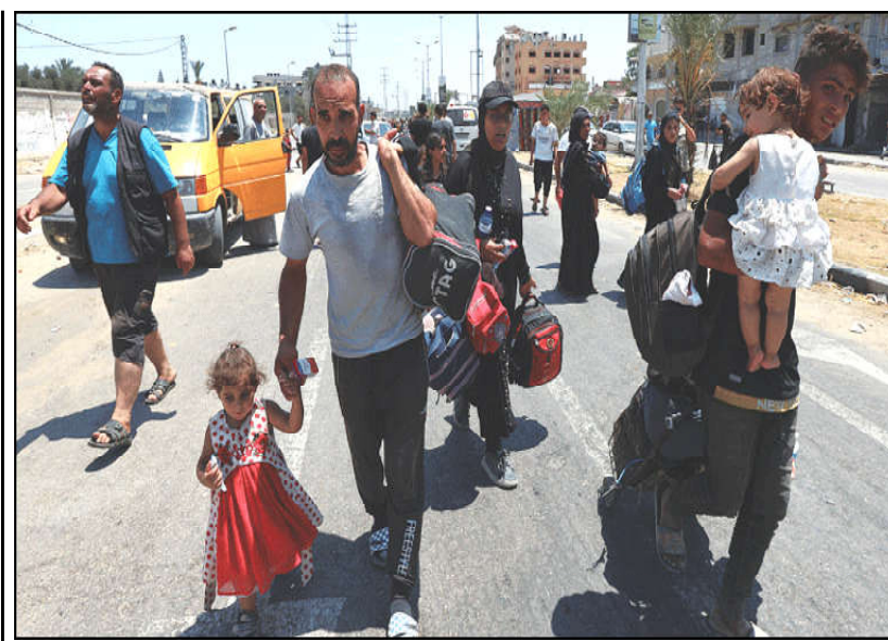
Displaced Palestinians arrive in Nuseirat, central Gaza Strip.

and the release of prisoners. "There's still miles to go before we close if we are able to close. So I don't want to say that it's immediately around the corner, but it does not have to be far out in the distance if everyone comes in this with the will to get it done," Sullivan told reporters, adding that there has been no change in policy with regard to a US pause of shipment of 2,000 pound bombs to Israel. Sullivan also said President Joe Biden will soon give an update on the status of ceasefire talks. Turkish President Tayyip Erdogan said US President Joe Biden and his administration are complicit in Israeli war crimes and violations of international law in the Gaza conflict, and he called for sanctions against Israel.