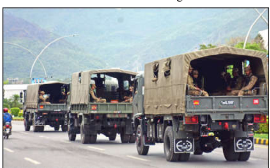
ISLAMABAD: Pak army patrolling at Constitution Avenue in the Federal Capital.