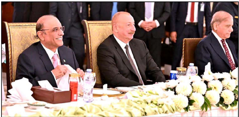
ISLAMABAD: President Asif Ali Zardari hosted a state luncheon in the honour of President of Azerbaijan, Mr. Ilham Aliyev, at Aiwan-i-Sadr, Prime Minister Muhammad Shehbaz Sharif was also present on the occasion.

Ph: 2841470/2841473 Vol: XIX No. 146, Muharram 06, 1446 AH Saturday July 13, 2024, Pages 04, Price Rs.15