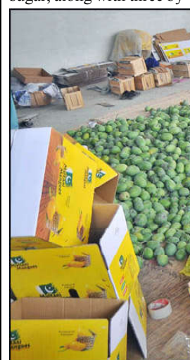
MULTAN: A worker weighing and packing good quality mangoes into the boxes for delivery to the other City.

JKSM is a private limited company with the business of production and sale of sugar or related products in Pakistan, said a press release issued here on Tuesday.