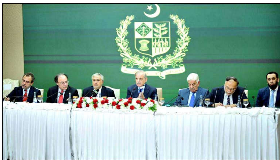
ISLAMABAD: Prime Minister Muhammad Shehbaz Sharif briefing parliamentarians regarding power sector reforms.