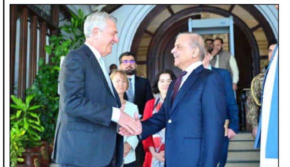
ISLAMABAD: UN High Commissioner for Refugees Filippo Grandi called on Prime Minister Muhammad Shehbaz Sharif.