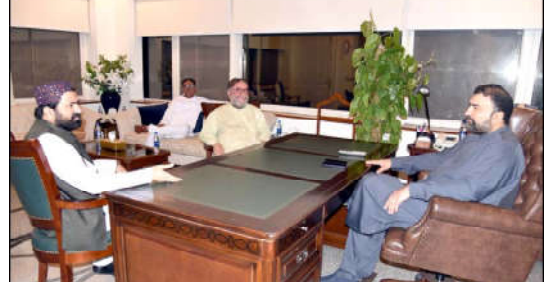
QUETTA: MNA Mian Khan Bugti and Wadera Kalpar Bugti meeting with Balochistan Chief Minister Mir Sarfraz Ahmed Bugti.

QUETTA (INP): Pakistan Coast Guards seized over 15,000 liters of Iranian diesel being smuggled into the country through the south-western Balochistan province in two separate operations, state media reported on Tuesday.