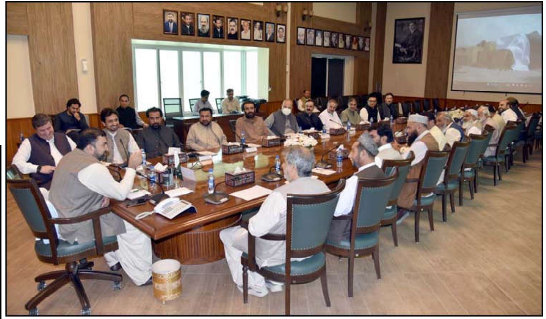
QUETTA: A delegation of representative of Zamindar Action Committee meeting with Balochistan Chief Minister Mir Sarfraz Ahmed Bugti. Provincial Ministers and Parliamentary Secretaries are also present.

Syed Yawar Ali and Afaq Ahmed Tiwana appreciated the government for prioritizing agriculture and livestock in its policy framework.