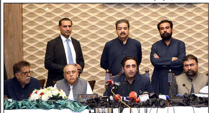
QUETTA: PPP Chairman Bilawal Bhutto-Zardari addressing a press conference.