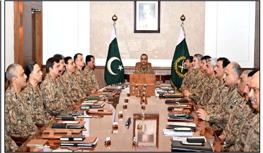
RAWALPINDI: Chief of Army Staff General Syed Asim Munir presiding over 265th Corps Commanders' Conference

To conclude, the COAS remarked that Pakistan Army has always been fully prepared to thwart all internal and external challenges and play its due role in the stability and prosperity of Pakistan, regardless of the challenges posed.