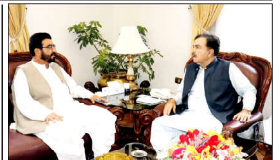
QUETTA: Provincial Minister Mir Asim Kurd Gailo meeting with Governor Balochistan Sheikh Jaffar Khan Mandokhail