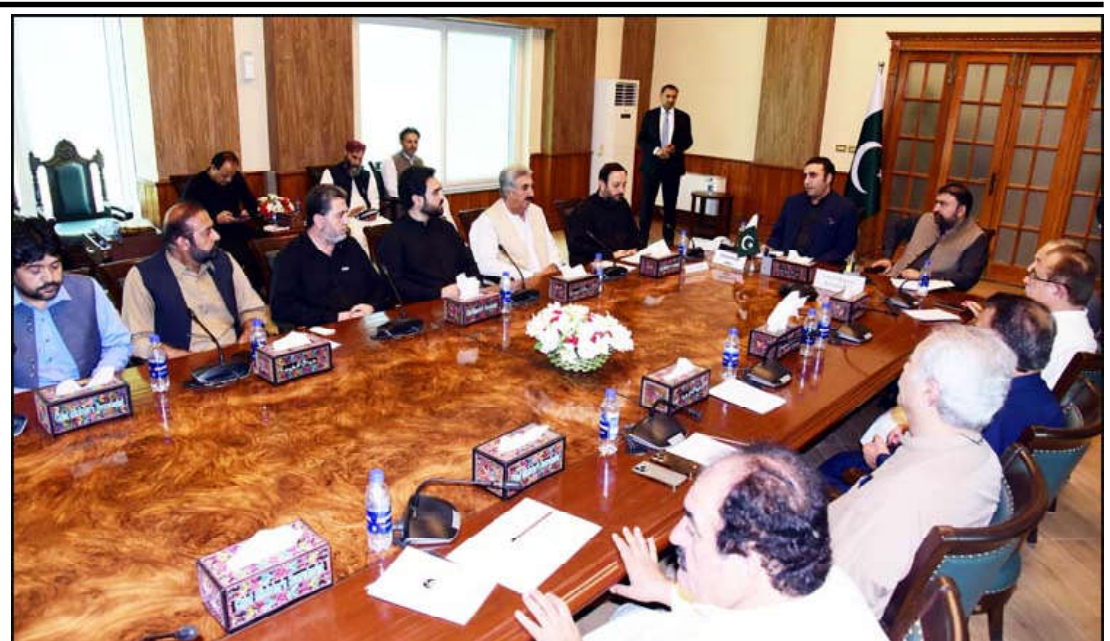
QUETTA: A delegation of Quetta Chamber of Commerce led by Senator Bilal Khan Mandokhail meeting with Chairman PPP Bilawal Bhutto Zardari. Balochistan Chief Minister Mir Sarfraz Bugti and Provincial Ministers are also present.

He emphasized that road connectivity and communications were very much necessary to increase the bilateral links between the two countries.