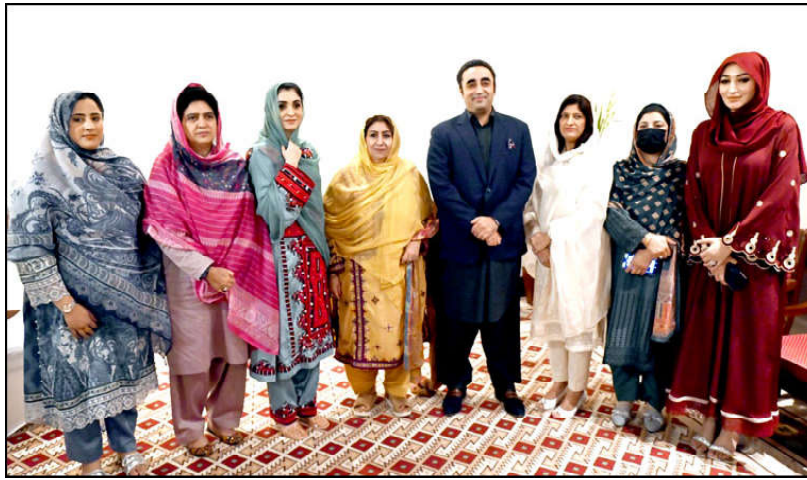
QUETTA: Female MPAs of Balochistan Assembly photographed with Chairman Pakistan Peoples Party Bilawal Bhutto Zardari after a meeting.