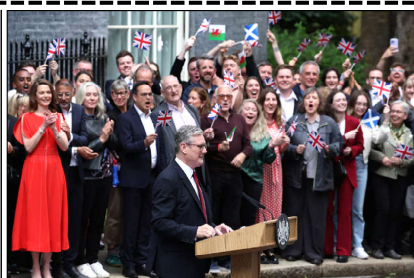
British Prime Minister Keir Starmer speaks, at Number 10 Downing Street, following the results of the election, in London, Britain.