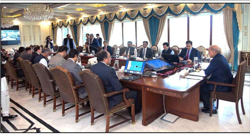
ISLAMABAD: Prime Minister Muhammad Shehbaz Sharif chairs a review meeting on Digitization and Reforms of FBR.