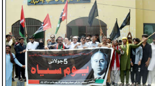
BAHAWALPUR: Activists of Pakistan People's Party hold a banner during protest on the eve of black day on 5th July, outside press club in the city.