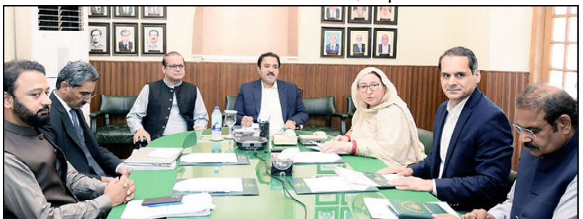
LAHORE: Punjab Minister for Local Government Zeeshan Rafique presides over the briefing session of Cooperatives Department. MNA Armaghan Subhani is also present.

RAWALPINDI (APP): Over 931 Traffic Wardens under the supervision of inspectors and DSPs would perform duties on city roads to control traffic flow during Muharram. According to a City Traffic Officer (CTO), Rawalpindi Tamoor Khan, Traffic Police Officers, and Wardens have also been directed to take action against vehicles having tinted glasses, revolving lights, unregistered vehicles and motorcycles and others moving without improper and fake number plates. In order to ensure the security of the mourning processions during Muharram-ul-Haram, the City Traffic Police (CTP) Rawalpindi has issued a comprehensive traffic plan. According to the plan, there would be a complete ban on parking any vehicle or pushcart on the route of the procession. Fork lifters would move with unregistered vehicles and