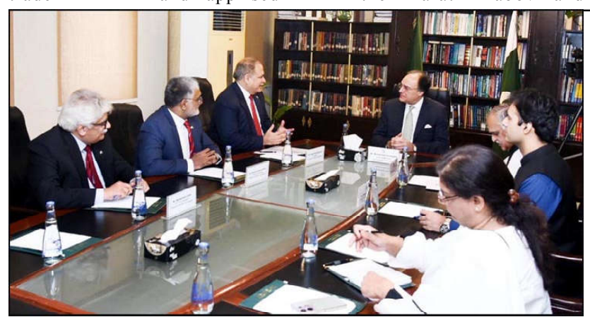
ISLAMABAD: Federal Minister for Finance & Revenue Senator Muhammad Aurangzeb in a meeting with the delegation of Pakistan Tax Bar Association.