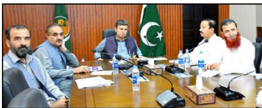
QUETTA: Balochistan Chief Secretary Shakeel Qadir Khan being briefed about Balochistan Assessment and Examination Commission

iting different districts as ambassador of peace on the orders of Chief Minister Maryam Nawaz to maintain unity and peace during the sacred month of Muharram-ul-Haram. He said, unity among people and following the Paigham-e-Pakistan guidelines was the need of the hour. He said, people should feel free to pay respects to Ahl-e-Bait, Khulafa-e-Raashideen, and Sahaba-e-Karam on specific days. He said that Pakistan Armed Forces have rendered numerous sacrifices in strengthening the country's defence.