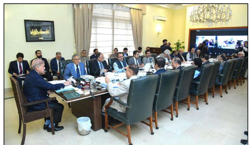
Prime Minister Muhammad Shehbaz Sharif chairs a meeting of Cabinet Committee on Energy in Islamabad.

"Though, we had some reservations on some national matters including recent budget for the fiscal year 2024-25, however in public interest, we did not create hurdles thanks to the federal government who agreed to assist us in undertaking the development projects, we proposed for our people, he noted.