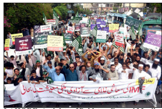
LAHORE: Activists of Pakistan Central Muslim League hold a protest against inflation in Pakistan, outside press club in the Provincial Capital.

With President Putin, he said, the discussion encompassed promoting cooperation and partnership between the two countries' diverse economic sectors including agriculture, mining, petrochemicals and others.