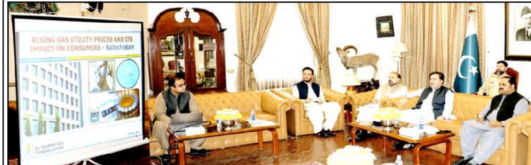
QUETTA: Governor Balochistan Sheikh Jaffar Khan Mandokhail being briefed about Sui Southern Gas Company

Besides, wholehearted campaign should also be launched for creating awareness among general public in this regard, he added.