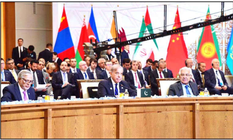
ASTANA: Prime Minister Muhammad Shehbaz Sharif delivers a National Statement at Shanghai Cooperation Organisation Summit.