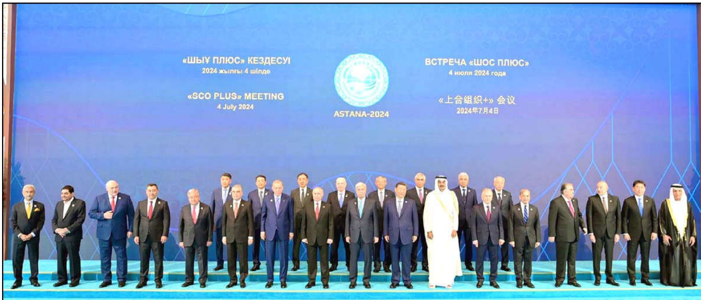
ASTANA: Prime Minister, Muhammad Shehbaz in a group photo with the Shanghai Cooperation Organization Plus Summit, held in Astana.

Ph: 2841470/2841473 Vol: XIX No. 139, Zil Hajj 28, 1445 AH Friday July 05, 2024, Pages 04, Price Rs.15