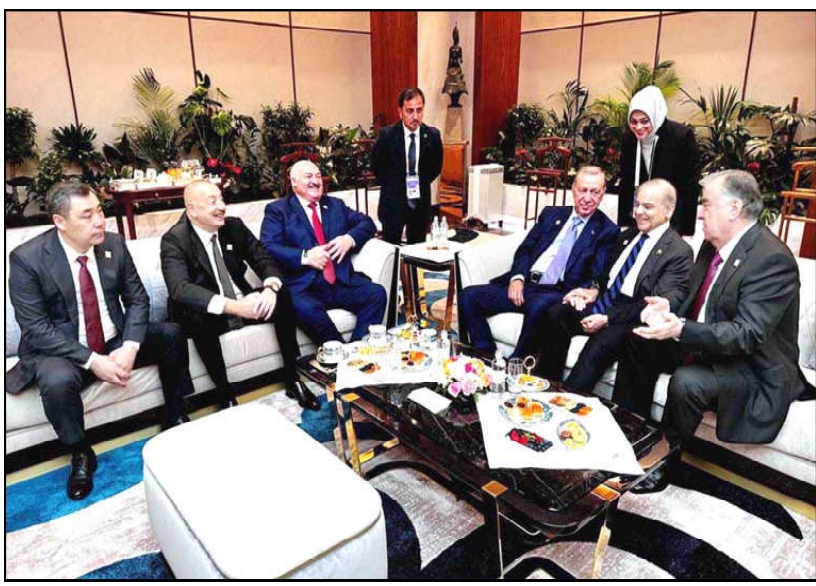
ASTANA: Prime Minister Muhammad Shehbaz Sharif interacts with the world leaders on the sidelines of Shanghai Cooperation Organisation Summit.

ISLAMABAD (APP): Prime Minister Shehbaz Sharif on Thursday, reaffirming Pakistan's commitment to SCO objectives of peace and prosperity, urged the member states to put in their collective efforts against terrorism, poverty alleviation and dispute resolution, particularly the ongoing Israeli barbarism in Palestine. "I reaffirm Pakistan's commitment to working together to strengthen SCO as an active and integrated regional forum to achieve the common objective of peace and prosperity in line with the Shanghai spirit," the prime minister said addressing the 24th Summit of the Council of Heads of State of the Shanghai Cooperation Organization (SCO), which commenced here in the capital city of Kazakhstan. Titled "Strengthening Multilateral Dialogue - Striving Towards a Sustainable Peace and Prosperity", the summit is being attended by leaders from Pakistan, China, Russia, Tajikistan, Turkije, Uzbekistan, Belarus, Iran, Kyrgyzstan, India and others.