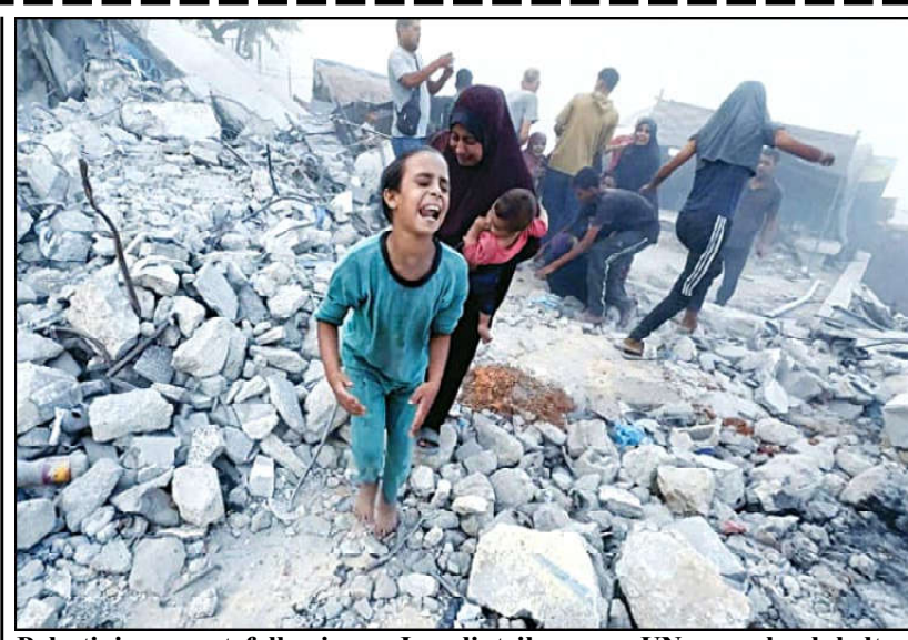
Palestinians react, following an Israeli strike near a UN-run school sheltering displaced people, in Khan Younis.

amid fierce fighting with Palestinian militants overnight, residents said. At least 12 people were killed in new strikes in central and northern Gaza, health officials said. Israeli leaders have said they are winding down the phase of intense fighting and would soon shift to more targeted operations in the nearly nine-month-war. But fighting continued overnight in two locations at the centre of Rafah, where tanks have seized several districts and advanced further west and north of the city in recent days, and concerns about the plight of hundreds of thousands of displaced people are growing. In Maghazi refugee camp in central Gaza, two Israeli airstrikes killed five Palestinians, health officials said. In Shejaia an airstrike killed four and wounded 17, medics said. Another airstrike hit a car in the southern city of Deir Al-Balah, killing three people, officials said.