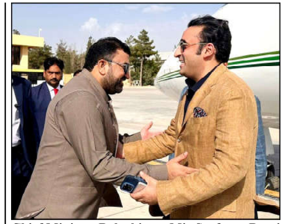
Chief Minister Balochistan Mir Sarfaraz Bugti receiving Chairman PPP Bilawal Bhutto Zardari upon arrival at Quetta Airport

The report recommended that the US State Department designate 17 countries, including Pakistan, as Countries of Particular Concern (CPC) due to severe violations of religious freedom, criticizing the country for systemic issues like the enforcement of blasphemy laws and the failure to protect religious minorities for forced conversions. The other recommended countries include Afghanistan, Azerbaijan, Burma, China, Cuba, Eritrea, India, Iran, Nicaragua, Nigeria, North Korea, Russia, Saudi Arabia, Tajikistan, Turkmenistan, and Vietnam. Muntaz also announced that the government has approved Gaza's medical students to complete their education in Pakistan. These students will soon join Pakistani medical colleges to pursue studies in cardiology, surgery, and other fields. Regarding Afghanistan, the spokesperson mentioned that Asif Durrani represented Pakistan at the Afghan conference in Doha. A meeting between Afghan and Pakistani officials took place on July 1, where Durrani highlighted concerns about ter-