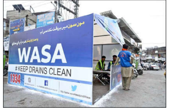
RAWALPINDI: Water and Sanitation Agency (WASA) establish Flood Response Unit at Guwalmandi near Nullah Lai as pre-monsoon spell is expected to start from Thursday to Sunday and assured that all necessary arrangements have been made in this regard by Rawalpindi Development Authority (RDA).