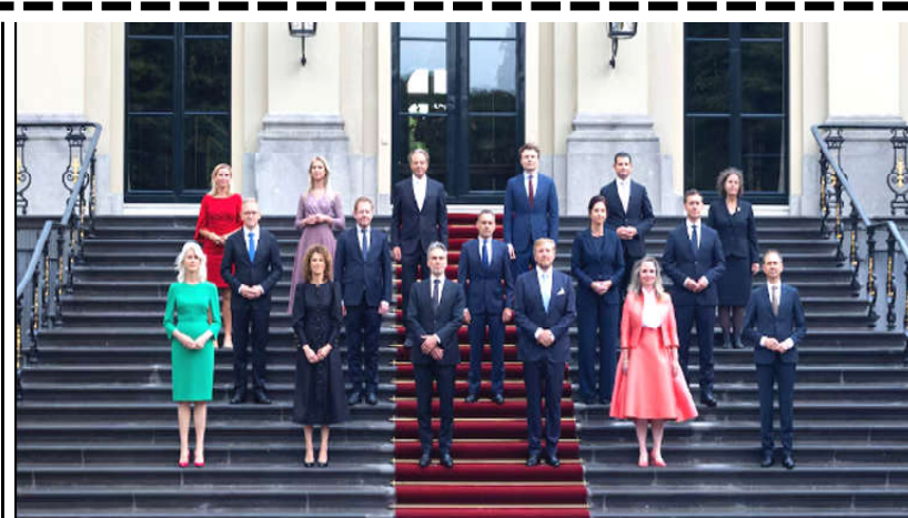
Dutch King Willem-Alexander and Prime Minister Dick Schoof pose with the new members of the Dutch Government at Palace Huis ten Bosch in The Hague, Netherlands.

position leaders expressed outrage and insisted Abu Salmia played a role in Hamas' alleged use of the hospital — though Israeli security services rarely unilaterally free prisoners if they have a suspicion of militant links. Prime Minister Benjamin Netanyahu's office called the release "a grave mistake." Monday's evacuation call covered the entire eastern half of Khan Younis and a large swath of the Gaza Strip's southeast corner. Earlier in the day, the army said a barrage of rockets out of Gaza was fired from Khan Younis. The order suggested a new assault into the city was imminent. Israeli forces fought for weeks in Khan Younis earlier this year and withdrew, claiming to have destroyed Hamas battalions in the city.