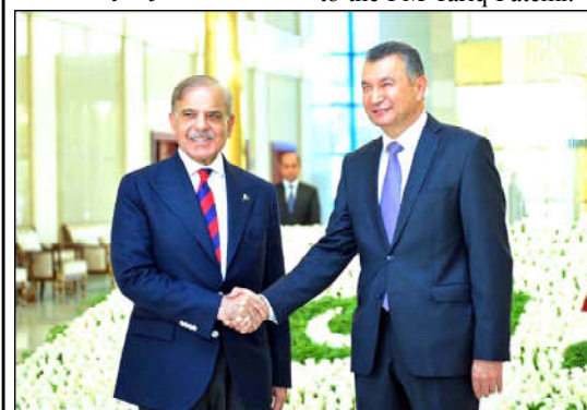
DUSHANBE: Prime Minister Muhammad Shehbaz Sharif meets Prime Minister of Tajikistan H.E. Qahir Rasulzoda at the airport in Tajikistan.