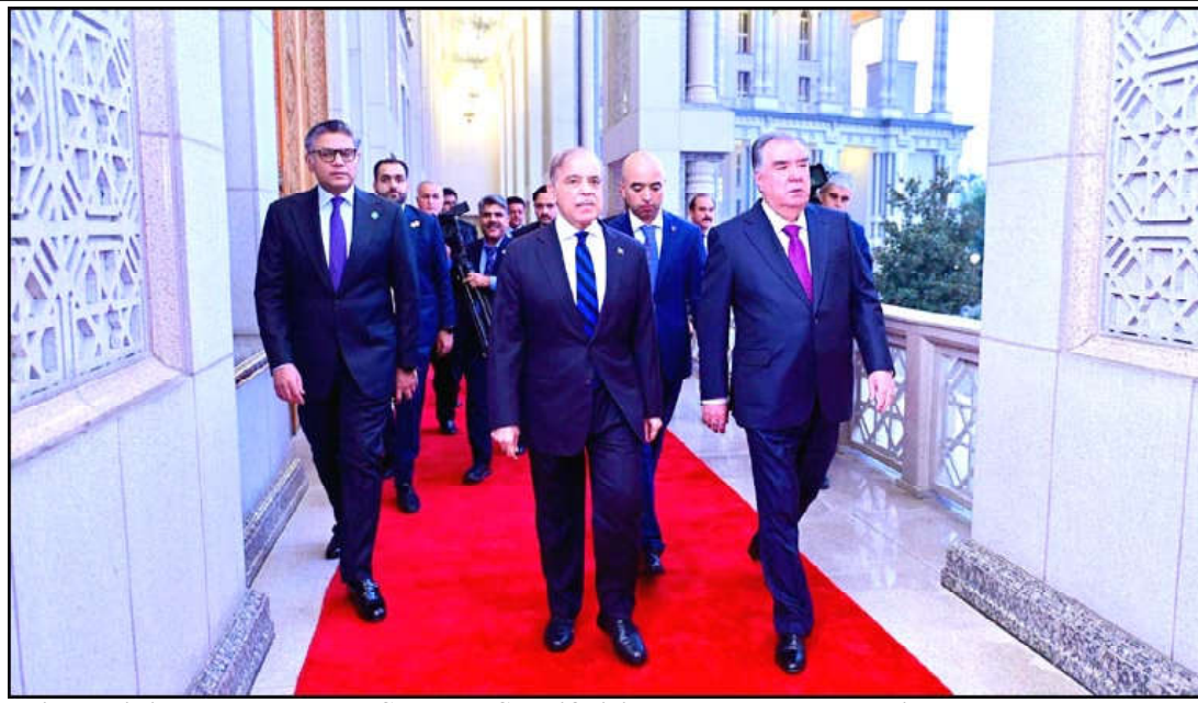
Prime Minister Muhammad Shehbaz Sharif visits the Navruz Palace in Dushanbe.

PTI leadership had always perpetrated chaos and anarchy in the country and mocked at the country's institutions, he added.