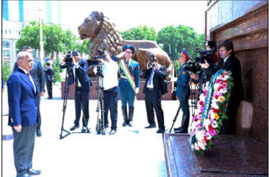
DUSHANBE: Prime Minister, Muhammad Shehbaz Sharif lays a floral wreath at the monument of Ismail Samani in Dushanbe.

The meeting took place against the backdrop of simmering tensions between Pakistan and the Afghan Taliban government.