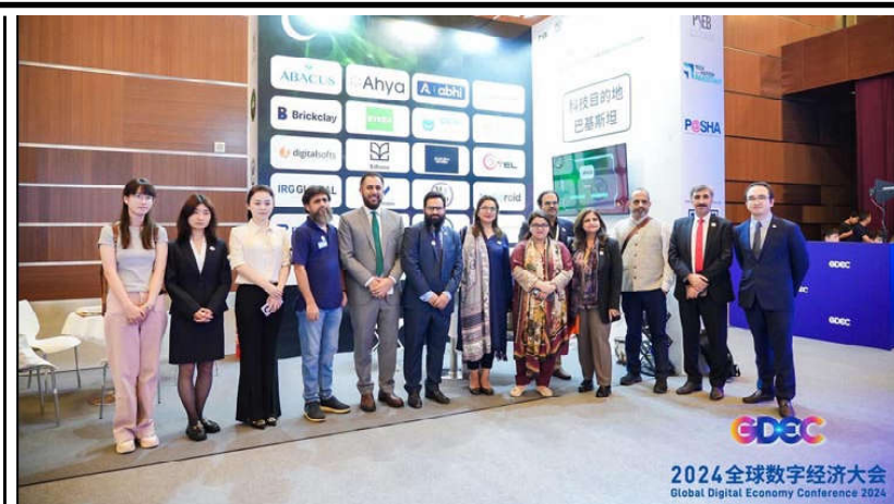
Minister of State for IT and Telecommunication Ms. Shaza Fatima Khawaja in a group photo following visiting booths of different tech companies on the occasion of Global Digital Economy Conference 2024 in Beijing.

On the occasion, Azerbaijan minister Deputy Minister, Sharifov highlighted the ease of travel between the two countries, noting that Azerbaijan received 55,000 Pakistani visitors last year due to its favourable visa policy.