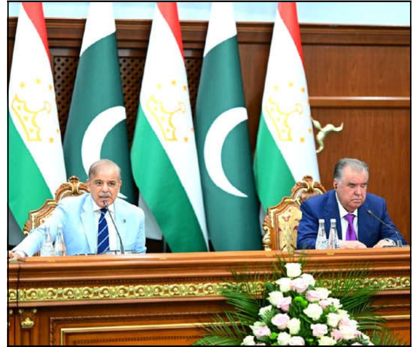
Prime Minister Muhammad Shehbaz Sharif addresses the media in a press conference in Qasr-e-Millat, Dushanbe.

said the two brotherly countries had been the victims of terrorism; Pakistan faced this menace for years and paid a huge price in terms of human lives and of course, suffered from colossal economic losses to the tune of billions of dollars. Thousands of people from all walks of life laid down their lives to defeat the menace of terrorism, he said, adding the armed forces of Pakistan had been fighting this menace and its officers and jawans gave huge sacrifices in the line of duty, besides police and other law enforcement agencies personnel also rendered huge sacrifices.