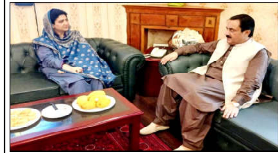
QUETTA: Deputy Chairman Senate Saydal Khan Nassar meeting with Provincial Education Minister Raheela Hameed Khan Durrani

He appreciated the positive role played by ASEAN in regional integration and prosperity. The foreign secretary shared Pakistan's perspective on regional conflicts in the Asia-Pacific region, stressing the need for dialogue and inclusiveness instead of bloc politics. He highlighted the plight of the people of IIOJK and called for the resolution of the Jammu and Kashmir dispute in accordance with the relevant United Nations Security Council resolutions and the wishes of the Kashmiri people. He also presented Pakistan's perspective on the regional hotspots including the situation in Gaza and Afghanistan.