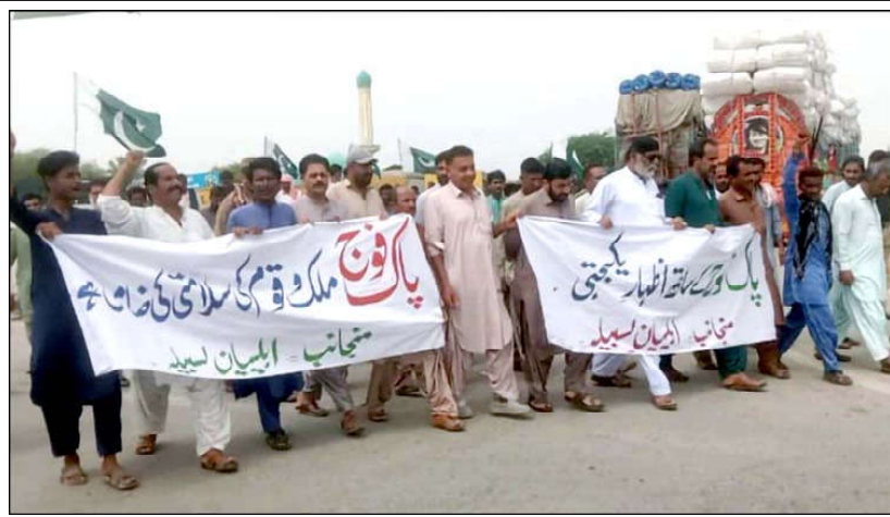
HUB: Residents of Lasbela are holding demonstration in favor Pakistan Army, held in Hub.

in future. He demanded of the government to meet the demands of BYC. He said that there is disturbance in the province for last one week and added that the present "non-political and non-serious" government is responsible for the situation created. He charged that the people who are part of the government are going to take advantage of the situation. He said that the "puppet" government has been imposed on us through Form 47. He said that no one would give weightage to these people if there was political freedom, peace and