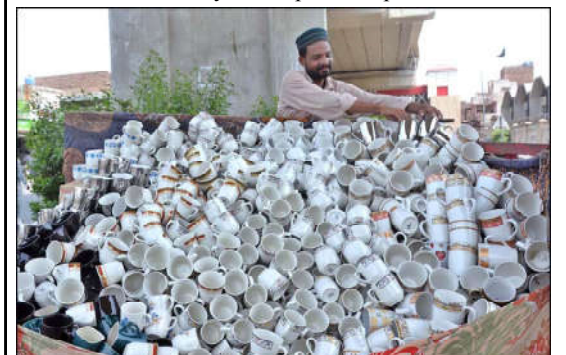
MULTAN: A vendor is busy displaying tea cups at roadside setup to attract the customers.

He directed officers concerned to bring more improvement in performance related to the cotton crop. He said that as per the vision of the CM Punjab Maryam Nawaz Sharif, 62 Farmer Facilitation Centres have been established across the province and the number of centres would be increased after consultation with the public representatives.