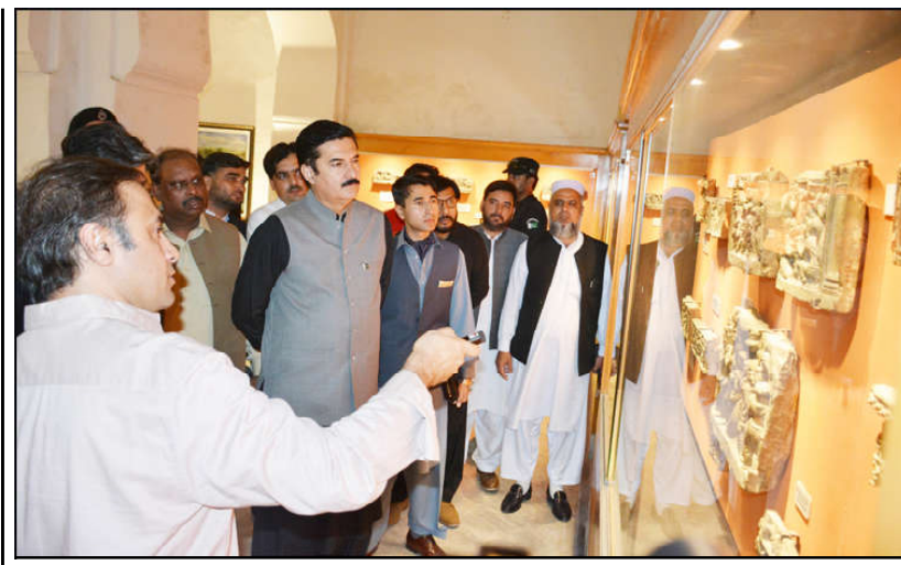
PESHAWAR: Governor Khyber Pakhtunkhwa Faisal Karim Kundi being briefed about Gandhara heritage displayed in Peshawar Museum.

described the Peshawar Museum as crucial for projecting a positive image of the province to international tourists. He stressed the need to promote Khyber Pakhtunkhwa for its peace and tourism potential. Governor Kundi also mentioned that the first session of the Khyber Pakhtunkhwa Assembly was held in Peshawar Museum. He said that the museum and its artifacts are valuable assets. He asserted that while there may be political differences, the primary goal should be to advance the province's rights and public welfare. He called for a collective political effort to present the province's case at the federal level and highlighted the need for more industries to create job opportunities for youth.