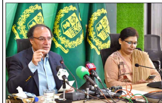
ISLAMABAD: Federal Minister for Finance and Revenue Senator Muhammad Aurangzeb addressing media persons at PTV Headquarters.

of last month (June) and held discussions on different aspects of bilateral trade and economic cooperation including local energy requirements and launching of Panda bonds in the Chinese markets. During the recent visit to China re-profiling of energy sector loans was also discussed, he said adding that the conversion of energy plants into coal and other aspects for affordable energy generation were also discussed during different high-level meetings. He said that the Chinese authorities acknowledged and ensured that our issues are registered with the right forum adding that the process has to be followed to take them forward. He said they also wanted to help the country in terms of re-profiling.