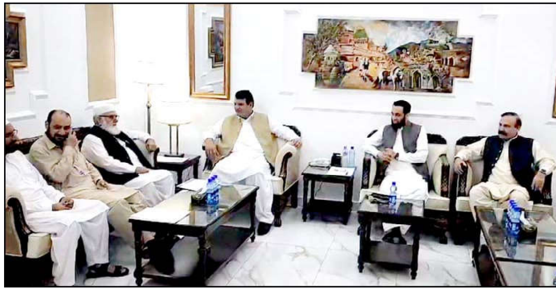
RAWALPINDI: A view of meeting with Government team and Jamaat-e-Islami delegation

from these countries will be exempted from visa fees. The visa policy reforms will make Pakistan an attractive destination for foreign individuals in terms of business and tourism. The prime minister highlighted that special arrangements had also been made for Sikh pilgrims having passports of a third country to obtain visas on arrival. Electronic gates will be installed at Karachi, Lahore and Islamabad airports to facilitate travelers, he said and added that a dashboard would be established at the Ministry of Interior to monitor the implementation of the new visa regime, including visa-free entry, business visa list and tourist visa on arrival. Prime Minister Shehbaz Sharif commended the performance of the Ministry of Interior, relevant ministries and institutions in implementing the new visa regime.