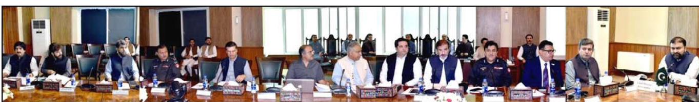
QUETTA: Chief Minister Balochistan, Mir Sarfraz Ahmed presiding over a meeting regarding preparation for Independence Day celebrations

In Pakistan, he said significant strides have been taken to ensure good governance and human rights.