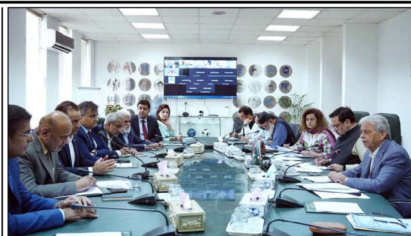
ISLAMABAD: Federal Minister for Industries and Production, Rana Tanveer Hussain presided over a meeting of the Sugar Advisory Board (SAB).

Meanwhile two more ships, Gulf Diamond and Epic Sunter scheduled to load/offload Rice and LPG are also arrived at outer-anchorage of the Port Qasim on today early morning. A total of seven ships were engaged at POA berths during the last 24 hours, out of them three ships, EF Emma, Hafnia Seine and Al-Thakira left the port on today morning while another ship "Fisher" is expected to sail on today afternoon. Cargo volume of 53,395 tonnes, comprising 42,570 tonnes imports cargo and 10,825 tonnes export cargo carried in 315 Containers (315 TEUs Imports).