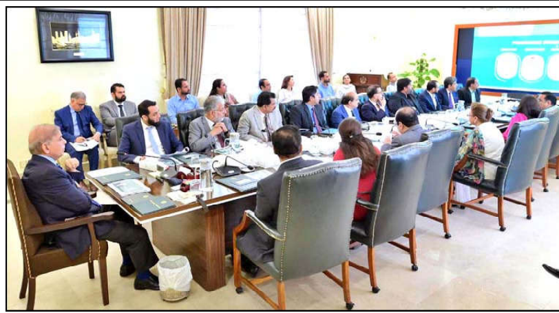
ISLAMABAD: Prime Minister Muhammad Shehbaz Sharif chairs a meeting regarding Prime Minister's Youth Programme.