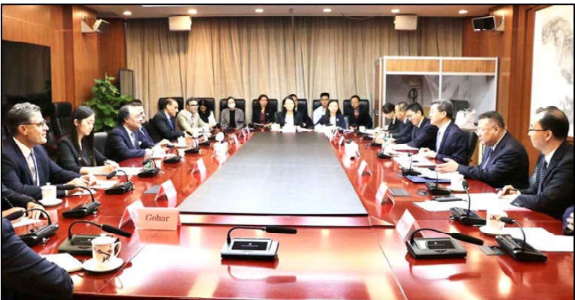
BEIJING: Senator Muhammad Aurangzeb, Federal Minister for Finance & Revenue and Sardar Awaish Ahmad Khan Laghari, Minister for Energy (Power Division) in a bilateral meeting with Chinese Minister of Finance Lan Fo'an.

They showed confidence that SINOSURE will continue its full support for completing ongoing and new projects under the second phase of CPEC especially now led by the private sector.