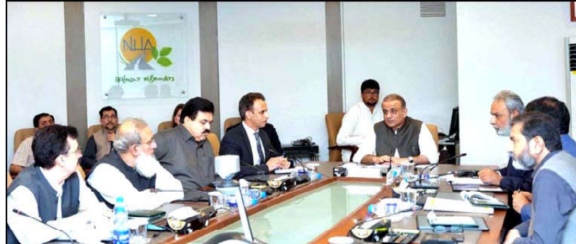
ISLAMABAD: Federal Minister for Communications, Privatization and Board of Investment, Abdul Aleem Khan chaired a high-level meeting of the National Highway Authority.

Mushahid Hussain Syed and others also addressed the seminar and spoke at length on the topic.