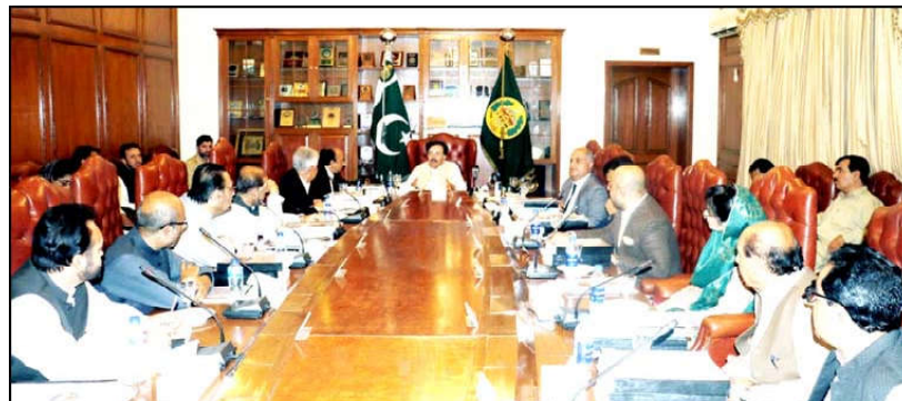
QUETTA: Governor Balochistan Sheikh Jaffar Khan Mandokhail presiding over 1 st meeting of Senate of University of Panjgur

ISLAMABAD (Agencies): The Election Commission of Pakistan (ECP) on Thursday declared 39 lawmakers — who contested the February 8 elections as independent candidates and later joined the Sunni Itehad Council (SIC) — as members of the Pakistan Tehreek-e-Insaf (PTI) in line with the Supreme Court's July 12 verdict in reserved seats case. The ECP uploaded the notification on its website to declare 39 lawmakers as the former ruling party's members who had shown their affiliation with the PTI in their nomination papers for the February 8 nationwide polls. The decision was taken in a key session held under the chair of the Chief Election Commissioner (CEC) Sikandar Sultan Raja today in which they reached a conclusion to upload the notification of 39 lawmakers' affiliation with the Imran-founded party. In the notification, Shandana Gulzar, Sher Ali