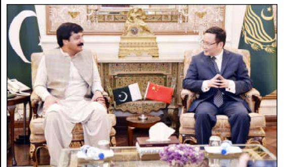
LAHORE: Chinese Consul General in Lahore, Zhao Shirin called on Punjab Governor, Sardar Saleem Haider Khan at Governor House.

LAHORE (APP): Senior Provincial Minister Mairiyum Aurangzeb has said in a statement that 27 acres of land in Chak No. 534 GB in Faisalabad has been retrieved from the illegal occupants. An official nursery has been established on the retrieved five acres of land immediately. She said that in order to find a permanent solution to smog, plantation has been launched on the remaining 22 acres of land. Senior Provincial Minister said that on the direction of CM Maryam Nawaz Sharif, the Forest department is establishing a forest for the livestock and ecosystem after retrieving government land from the illegal occupants. She said that growing new forests will help significantly in getting rid of smog and air pollution. She acknowledged that Chief Minister Punjab Maryam Nawaz Sharif is taking important steps for the protection and growth of forests.