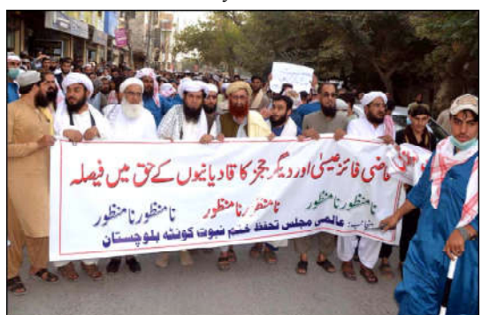
QUETTA: Members of Aalmi Majlis Tahafuz-e-Khatam-e-Nabuwat (PBUH) are holding protest demonstration for acceptance of their demands, at Quetta press club.