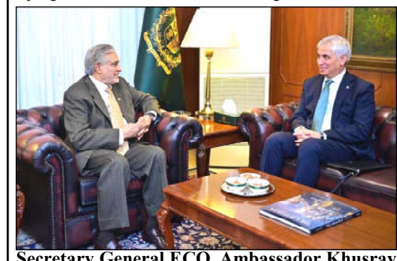
Secretary General ECO, Ambassador Khusrav Noziri called on Deputy Prime Minister and Foreign Minister Senator Mohammad Ishaq Dar at the Ministry of Foreign Affairs Islamabad.

This partnership with AICHEK Medical Technology is set to bring groundbreaking innovations in In-Vitro Diagnostics (IVD) and biomedical reagents to Pakistan. AICHEK, renowned for its comprehensive IVD product solutions, will work closely with LDS to enhance the local healthcare infrastructure and ensure the availability of cutting-edge medical technologies.