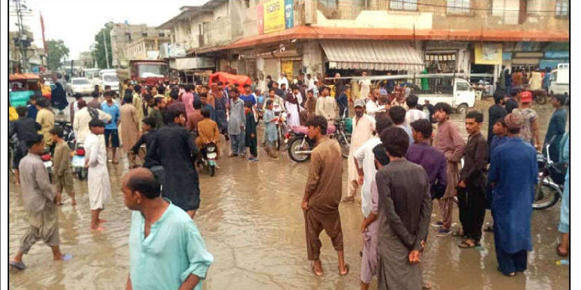
HUB: Residents of Allahabad Town are blocked road as they are holding protest demonstration against prolong electricity and sui gas load shedding in their area, at Main RCD road in Hub.

The first Shusha Global Media Forum themed "New Media in the Era of the 4th Industrial Revolution" was held on July 21-23, 2023.