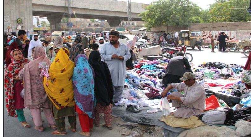
QUETTA: People are buying clothes from a stall, at a weekly bazar in Quetta.

This series of events in Quetta demonstrates PPAF's commitment to uplifting the socio-economic conditions of marginalized communities, particularly the youth and women of Balochistan. The joint venture of PPAF and the provincial government, through the Prime Minister's Youth Program, aims to bring tangible changes in the lives of deprived segments by empowering them economically.