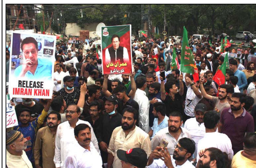
LAHORE: Activists of Tehreek-e-Insaf (PTI) are holding protest demonstration for release of PTI Founder Imran Khan, at Lahore press club.

QUETTA (INP): Recent monsoon rains in Balochistan have resulted in 10 fatalities and 31 injuries across various incidents, according to a report by the Provincial Disaster Management Authority (PDMA). The PDMA's report details significant human and material losses in several districts of the province due to the ongoing monsoon season. Since June 7, the rains have caused numerous accidents, including roof and wall collapses, leading to 10 deaths and 31 injuries, with children