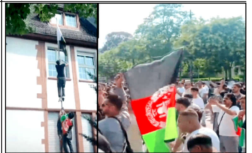
The picture shows Afghan nationals attacking Pakistan consulate in Frankfurt, Germany.

failure of the German authorities to protect the sanctity and security of the premises of its consular Mission. "Under the Vienna Convention on Consular Relations, 1963 it is the responsibility of the host government to protect the sanctity of the consular premises and ensure the security of diplomats," a statement issued by the Foreign Office said. It added that in yesterday's incident, the security of Pakistan's consulate in Frankfurt was