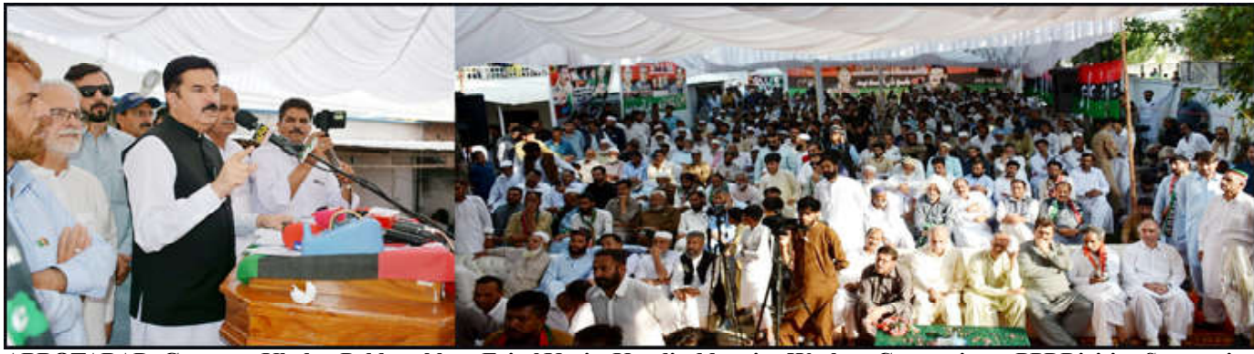
ABBOTABAD: Governor Khyber Pakhtunkhwa Faisal Karim Kundi addressing Workers Convention at PPP Division Secretariat.