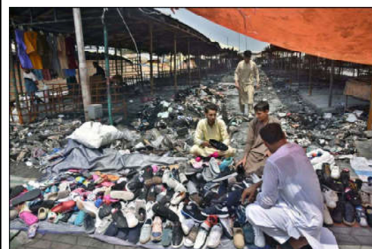
ISLAMABAD: People selecting and purchasing shoes from a makeshift stall at H-9 weekly bazaar.