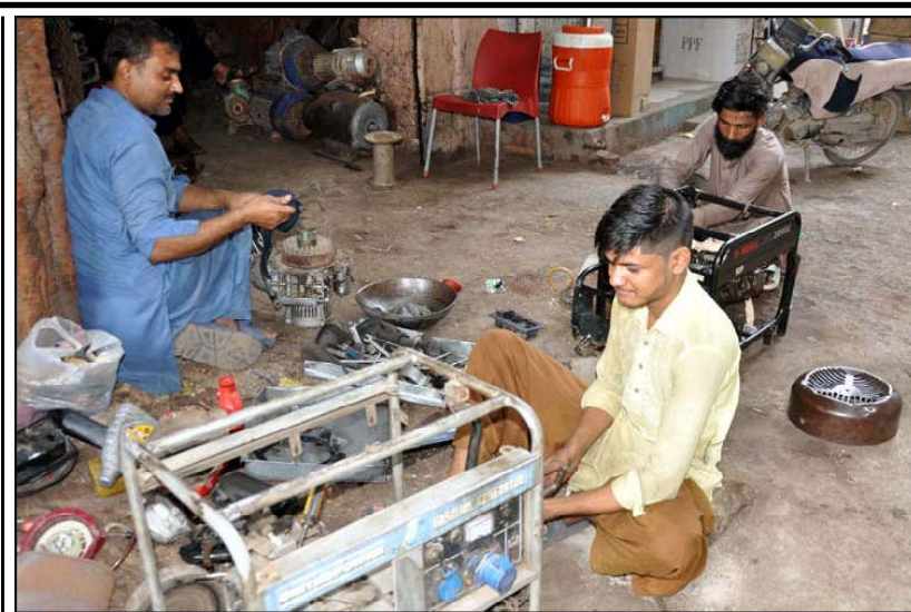
HYDERABAD: Laborers are busy in repairing works to generators to earn their livelihood for support their families, at their workplace in Hyderabad.

As per details, the development came after violent protests and an agreement was signed between the government and the Jammu Kashmir Joint Awami Action Committee (JAAC). The Azad Kashmir government has fulfilled its promise to provide affordable electricity to the public.