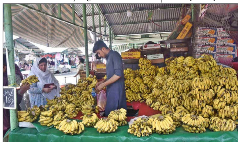
ISLAMABAD: A vendor selling bananas to customers at his stall in weekly Sunday Bazaar in the Federal Capital.

It is worth mentioning that to reduce high electricity tariffs and drain of precious foreign exchange, the Government approved Framework Guidelines for Fast-Track Solar PV Initiatives 2022.