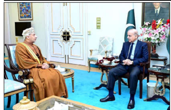
ISLAMABAD: Ambassador of the Sultanate of Oman H.E. Fahad Sulaiman Khalaf Al Kharusi called on Prime Minister Muhammad Shehbaz Sharif.