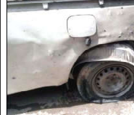
QUETTA: View of site after bomb blast on police vehicle, at Band Khushdil Khan road in Pishin area of Balochistan.

In response to criticism by a political party, the ECP while condemning and rejecting the act said that the demand for resignation was ridiculous and the Commission would continue to work in accordance with the law and the constitution without any pressure, the statement said.