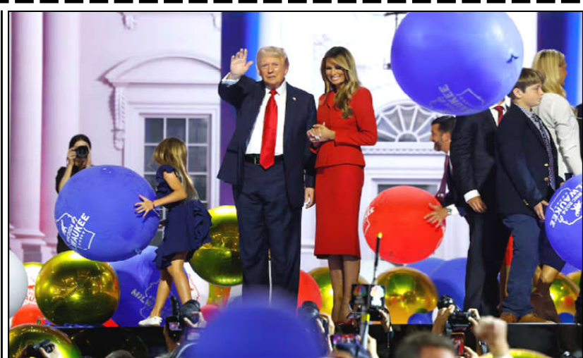
Republican presidential nominee and former U.S. President Donald Trump is joined on stage by wife Melania and other relatives after he finished giving his acceptance speech on Day 4 of the Republican National Convention (RNC), at the Fiserv Forum in Milwaukee, Wisconsin, U.S.