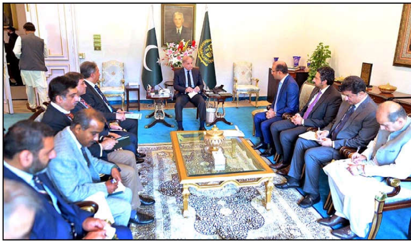
ISLAMABAD: A delegation of Abu Dhabi Ports Pakistan calls on Prime Minister Muhammad Shehbaz Sharif.