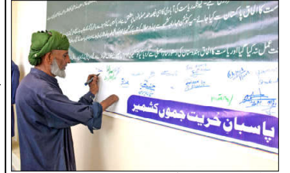
MUZAFFARABAD: Members of Pasban-e-Hurriyat Jammu and Kashmir signatures on a banner on the occasion of Youm-e-Ilhaq-e-Pakistan, in the city.

ISLAMABAD (INP): Speaker of the National Assembly Sardar Ayaz Sadiq Friday urged youth to play their role in nation-building rather than indulging in propaganda and political polarization. "Acquainting Youth with parliamentary procedures and norms is pivotal for the growth of democracy in Pakistan", he expressed these views during his keynote address to the orientation session of the Young Citizen Internship Program 2024. He also said that youth need to be acquainted with the committee system of Parliament as the standing committee plays an effective role in legislation. The speaker also informed the participants, "Pakistan Parliament is the first regional Parliament which transformed itself into the first-ever Green Parliament of the World through solarization". Member National Assembly (MNA) Dr. Nikhat Shakeel Khan, one of the pioneers of the Youth Internship Program initiated by the National Assembly graced the orientation session with her virtual presence and highlighted the importance of connecting the youth with the Parliament, imparting basic principles of democracy to youth, equipping youth with parliamentary etiquettes, processes and most importantly, directing the youth towards nation-building. Director Advocacy, Campaign, Communications and Media - Save the Children, Raza Hussain Qazi warmly greeted.