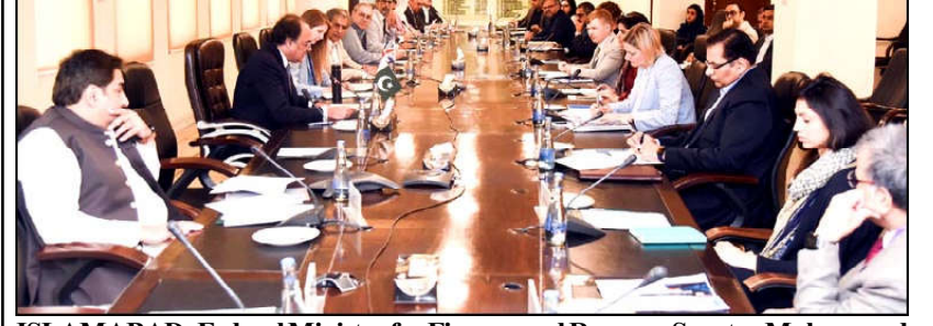
ISLAMABAD: Federal Minister for Finance and Revenue Senator Muhammad Aurangzeb is chairing the meeting on the Establishment of Programme Steering Committee (PSC) for the UK-Funded REMIT Programme.