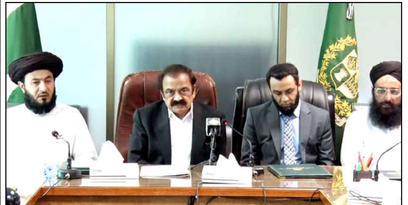
ISLAMABAD: Adviser to Prime Minister on Political Affairs Rana Sanaulah alongside Minister for Information and Broadcasting Attaullah Tarar, Islamabad Capital City administration and representatives of Tehreek-i-Labbaik Pakistan addressing a joint news conference.

The Chief Minister appreciated the services of Principal and academic staff of the College and assured them of his every