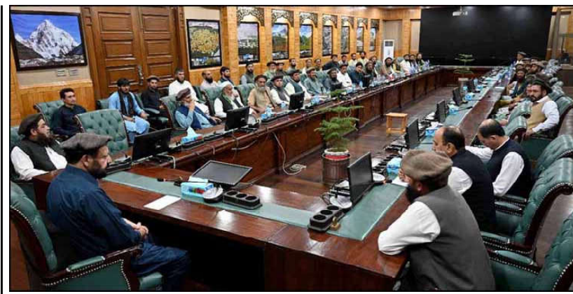
GILGIT: Chief Minister Gilgit-Baltistan Haji Gulbar Khan meets with affected individuals from the Dasu Hydro Power Project at the CM Secretariat.

and efforts would be made to bring tribesmen into the national mainstream of development. He said that voice would be raised at available forums for the facilitation of tribal people and to provide them opportunities for growth and development. He also urged locals and the young generation to support the efforts of security forces in maintaining peace in the area.