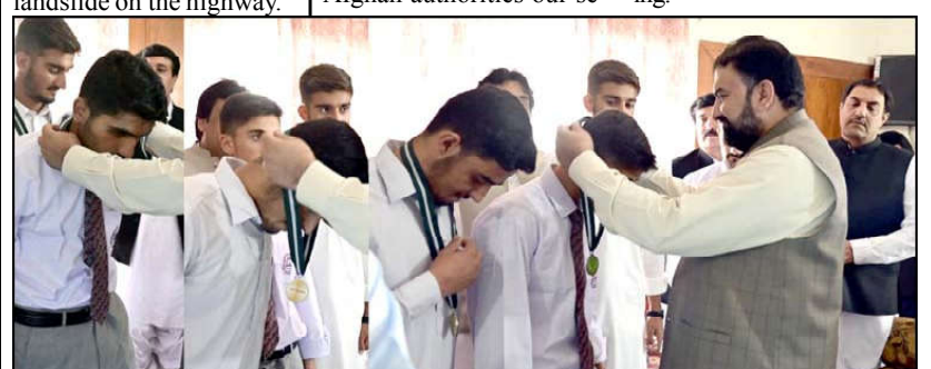
LORALAI: Chief Minister Balochistan Mir Sarfaraz Ahmed Bugti giving away medals to students during his visit to Balochistan Residential College Loralai