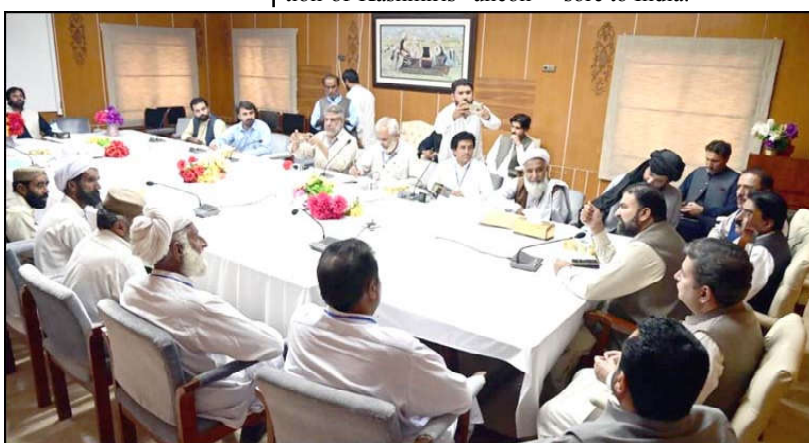
LORALAI: Office bearers of different political parties and representatives of civil society meeting with Chief Minister Balochistan Mir Sarfraz Ahmed Bugti

MIRPUR (AJK): (APP): Azad Jammu and Kashmir Prime Minister Chaudhry Anwar ul Haq, while terming Pakistan as the center of Kashmiris' hopes, has said that the historical day of July 19 had special significance in the history of freedom struggle of Kashmir. "It was on this day in 1947 when Kashmiri leadership decided to align their destiny with Pakistan", he said in his message issued on the occasion of Kashmir's accession day to Pakistan being observed today (Friday). The prime minister said that observance of day on both sides of the Line of Control (LoC) was a reflection of Kashmiris' unconditional love and faith with the state of Pakistan. "Those who laid down their lives in pursuit of this ideology are our real heroes", he said, adding that love for Pakistan ran in the blood of every Kashmiri. Anwar ul Haq said that Kashmiris had rendered matchless sacrifices to materialize the dream that was envisioned by their ancestors much before the creation of Pakistan. He expressed the optimism that the day was not far off when the Kashmiris' struggle and sacrifices would bear fruits. Terming Kashmiris' unconditional love for Pakistan as the biggest eyesore to India.