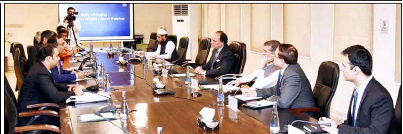
ISLAMABAD: Federal Minister for Finance and Revenue Senator Muhammad Aurangzeb in a meeting with the delegation of Pakistan Mobile Phone Manufacturers Association (PMPMA).

According to the statement, the meeting concluded with a mutual agreement on the need for a strategic and supportive policy framework aimed at fostering local manufacturing and enhancing export potential, thereby contributing to the broader goals of national economic growth and digital transformation.