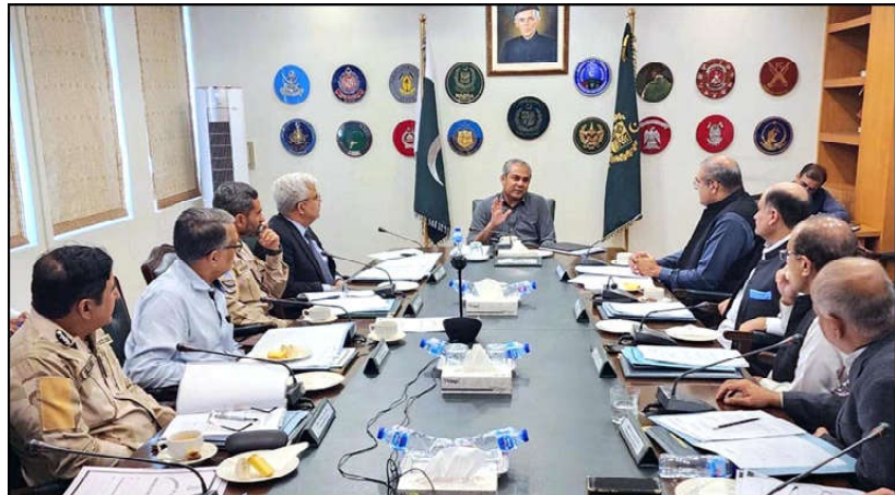
ISLAMABAD: Federal Minister for Interior and Narcotics Control Mohsin Naqvi chairing a meeting of Committee regarding National Drug Survey.

The National Drug Survey will be a comprehensive and authoritative exercise, covering homes, educational institutions, slums, and other areas. The data collected will enable policymakers to make informed decisions in the fight against narcotics.