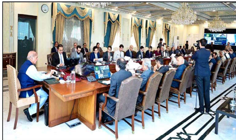
ISLAMABAD: Prime Minister Muhammad Shehbaz Sharif chairing a review meeting on the reforms and digitisation of the Federal Board of Revenue.