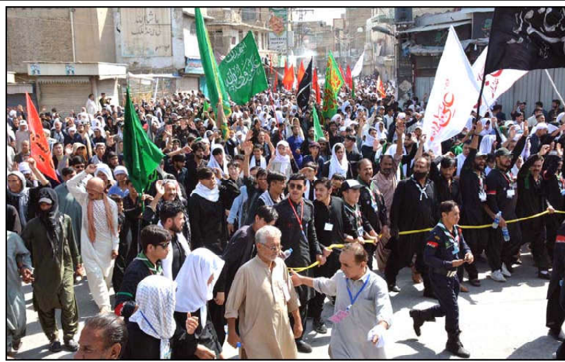
QUETTA: Shiite Muslims mourners to Imam Hussain (R.A) are participating religious procession to show their devotion and respect for cradle as they remember the martyrs of Karbala, during Ashura mourning procession in connection of 10th Muharram-ul-Haram, in Quetta.