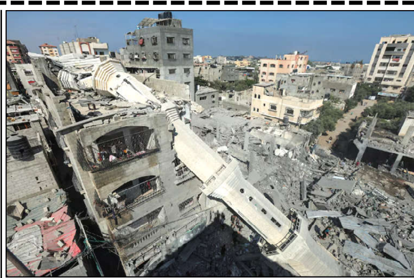
The collapsed minaret of Abdullah Azzam mosque leans against a house after the mosque was hit by an Israeli strike, amid the Israel-Hamas conflict, in Nuseirat refugee camp in the central Gaza Strip.