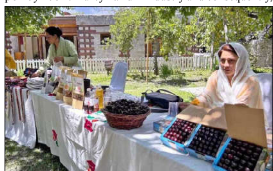
HUNZA: Business women of local community displaying cherry for selling purpose for tourists.