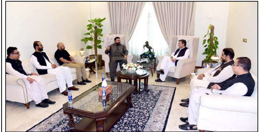
QUETTA: A 3-members delegation of AEOs meeting with Chief Minister Balochistan Mir Sarfraz Ahmed Bugti. Chief Secretary Balochistan Shakeel Qadir Khan is also present

"We are not behind them in intelligence and ability," he asserted. "But if we do not open our eyes, we will not be even counted in the global competition."