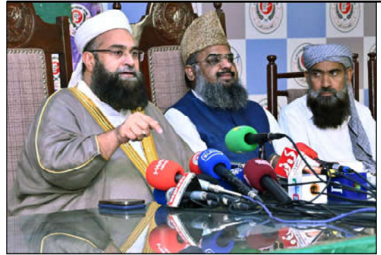
LAHORE: Chairman Pakistan Ulema Council Allama Tahir Ashrafi addressing a press conference at Press Club.

significance of Khyber Pakhtunkhwa, emphasizing its rich natural resources. He expressed his commitment to alleviating poverty in the province through sustainable development initiatives harnessing its natural wealth. The Governor said that efforts related to youth engagement, women empowerment, education, and healthcare were also underway. He said that plans for establishing a task force to address educational and healthcare challenges in the province were included in priorities.