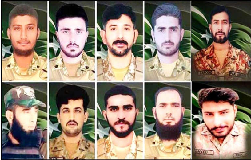
RAWALPINDI: Photos of security officials martyred during attacks in Bannu and DI Khan.

Ph: 2841470/2841473 Vol: XX No. 16, Muharram 10, 1446 AH Wednesday July 17, 2024, Pages 04, Price Rs.15