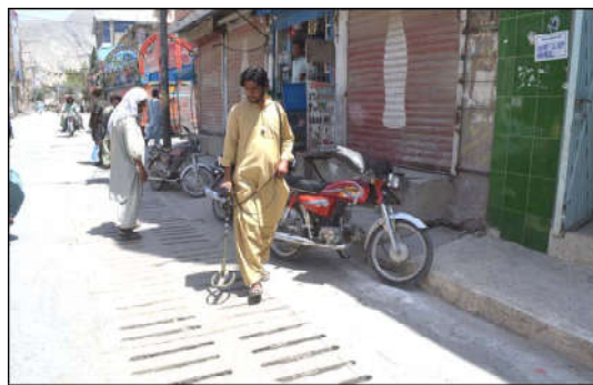
QUETTA: Officials of bomb disposal squad searching routes of 10th Muharram-ul-Haram procession

Independent Report QUETTA: Tough security measures have been adopted for the Ashura-e-Muharram procession being taken out in the provincial metropolis today (Wednesday). The officials informed that over 5,000 personnel of law enforcement agencies mainly police have been deployed to ensure security of the procession in the metropolis. Besides, the Frontier Corps (FC) and Levies force would also remain deployed in different parts mainly on the route of procession and its surrounding areas. The route of Ashura procession has already been sealed on Tuesday evening with the passages leading to it. Similarly, the shops and business concerns located on route of the procession have also been sealed. As per the schedule, the Ashura procession would start at around 08:30 AM today from the Rehmatullah chowk, Alamar road. The procession would pass through Alamar road, Bacha Khan chowk, Liaquat Bazaar, Junction chowk, McComy road, Saeed Ahmed road before its termination back at the Alamar road. The special passes have been issued to the personnel of law enforcement agencies deployed on Muharram security. The entry to the procession route would be made through specific points. Except these points, entry of the people would not be allowed to the route. In addition to this, the surveillance of Ashura procession would be carried out through CCTV cameras installed on the route and other areas of the metropolis.