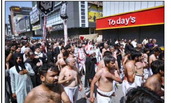
PESHAWAR: A large number of mourners attending the 9th Muharram Zuljinnah procession passes through Saadar Road.