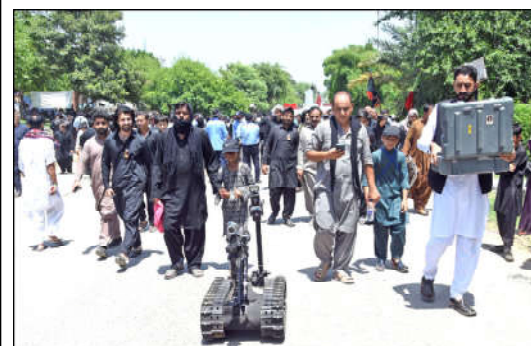
ISLAMABAD: Security personals using a Mechanical Robot Unit during 9th Muharram UH Haram procession at Imam Bargah Asna Ashri, in the Federal Capital.