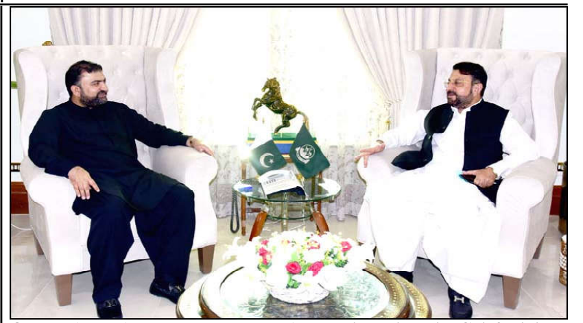
QUETTA: MPA Engr. Zamrak Khan Achakzai meeting with Chief Minister Balochistan Mir Sarfraz Ahmed Bugti