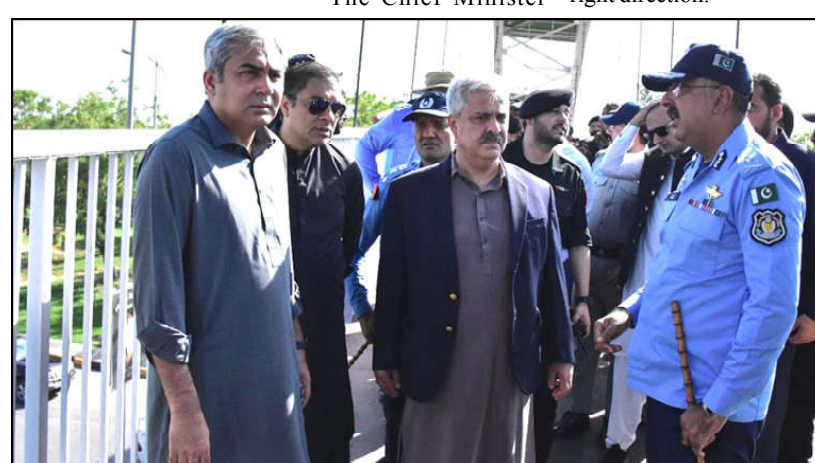
ISLAMABAD: Federal Interior Minister Mohsin Naqvi visiting main procession of the 9th of Muharram and personally reviewed the security arrangements put in place to protect mourners.

Ataullah Tarar appreciated the arrangements and expressed his satisfaction over it. He said that the administration was in contact with all schools of thought for the maintenance of law and order in the holy month. Police and administration are on alert to maintain peace during Muharram, he said.