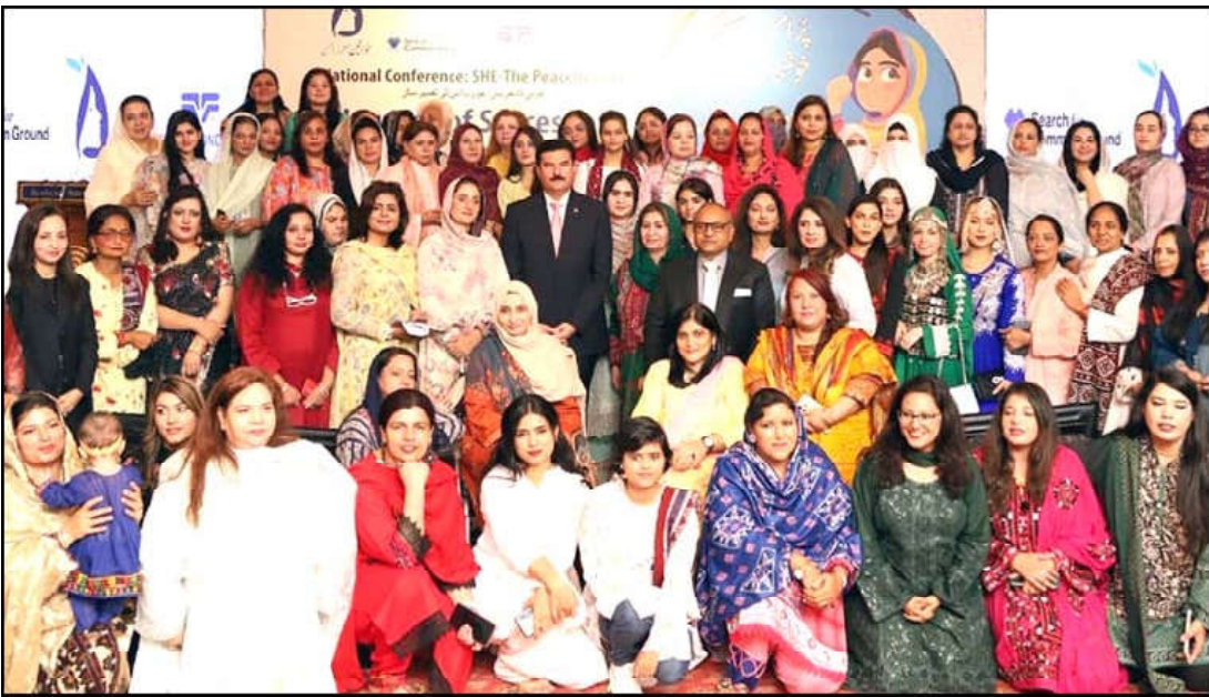
Chief guest Governor Khyber Pakhtoonkhwa Faisal Karim Kundi and Deputy Speaker Balochistan Assemy Ghazala Gola in a group photo during national conference of Aurat Foundation.