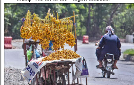
ISLAMABAD: A street vendor displaying dates on his handcart at roadside setup to attract customers at Lehar Road.