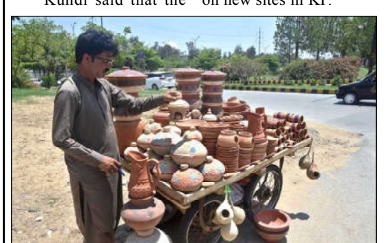
ISLAMABAD: A vendor arranging and displaying clay pottery on handcart to attract the customers at his roadside setup in the Federal Capital.

The MD PSO said that PSO had a big market and they were also working on new sites in KP.