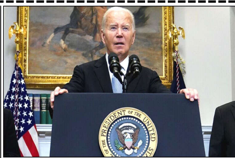
US President Joe Biden delivers a statement a day after Republican challenger Donald Trump was shot at a campaign rally, during brief remarks at the White House in Washington, US.