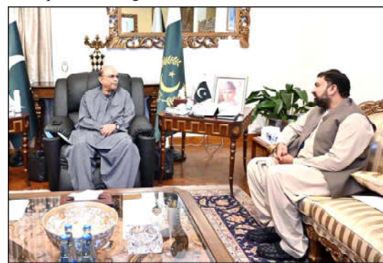
ISLAMABAD: Chief Minister Balochistan, Mir Sarfaraz Ahmed Bugti, called on President Asif Ali Zardari, at Aiwan-e-Sadr.