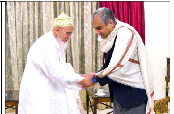
KARACHI: Interior Minister Mohsin Naqvi meeting with the Leader of Dawoodi Bohra Community Syedna Mufaddal Saifuddin.

In line with PFA's orders, as many as 73 flour mills in Gujranwala and more than 60 mills in Multan ceased their operations.