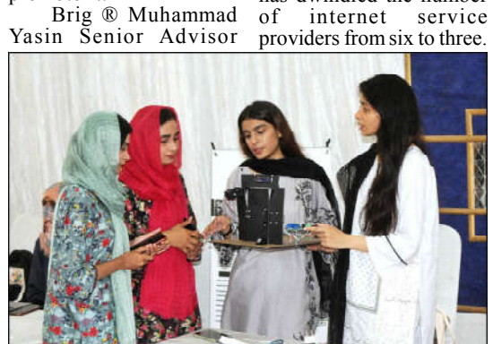
MULTAN: Students visiting different stalls during the Tech Expo 2024 organized by the Institute of Computer Science and Information Technology at the Jinnah Hall.

Emeritus at SDPI, highlighted the critical role of the telecom sector as the backbone of the country's economy, impacting education, health, industry, defence, and agriculture. He emphasized the need for a robust and competitive environment, meaningful regulations, and collaborations among service providers to foster sector development. He also noted that infrastructure sharing among telecom operators could reduce business costs and improve service delivery, especially in rural areas where competition has dwindled the number of internet service providers from six to three.