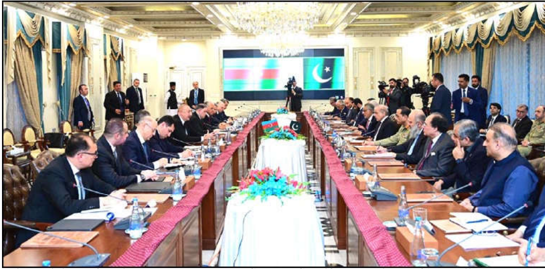
Prime Minister of Pakistan H.E. Muhammad Shehbaz Sharif and President of Azerbaijan H.E. Ilham Aliyev leading their respective delegations during bilateral talks in Islamabad.

Ph: 2841470/2841473 Vol: XX No. 12, Muharram 05, 1446 AH Friday July 12, 2024, Pages 04, Price Rs.15