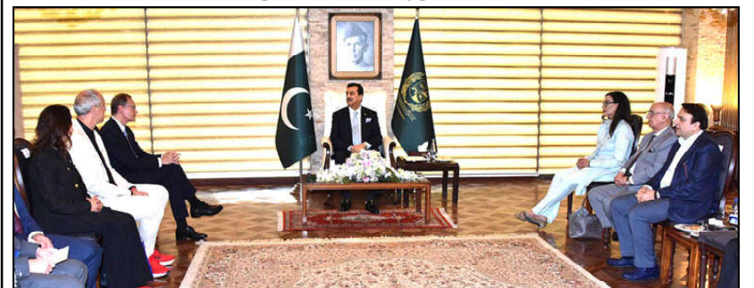
ISLAMABAD: Chairman Senate, Syed Yusuf Raza Gilani in a meeting with German Parliamentary delegation headed by Friedrich Ebert Stiftung (FES) at Parliament House.