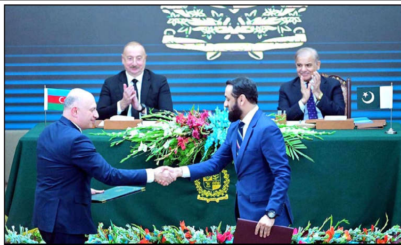
ISLAMABAD: President of Azerbaijan H.E. Mr. Ilham Aliyev and Prime Minister of Pakistan H.E. Muhammad Shehbaz Sharif witnesses the signing of MoUs and Agreements in various sectors between Pakistan and Azerbaijan.