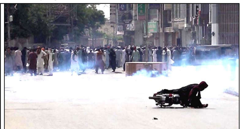
QUETTA: A view of tear gas seen during clash between Police and Baloch For Missing Person.

To a question, Mumtaz Zahra Baloch said Pakistan and the United States have a multifaceted and a robust partnership. She said she believe that this relationship should move forward on the basis of mutual respect, sovereign equality and non-interference in each other's internal affairs.