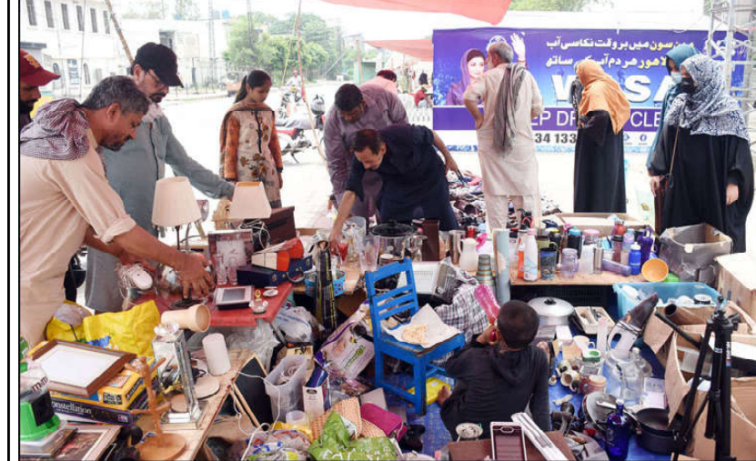
LAHORE: People are buying used items from a roadside vendor at Shadman area in the Provincial Capital.

importance of diversifying imports from Indonesia beyond palm oil and exploring opportunities for Pakistani exports in diverse sectors. He announced FPCCI's plans to organize single-country exhibition in Indonesia.