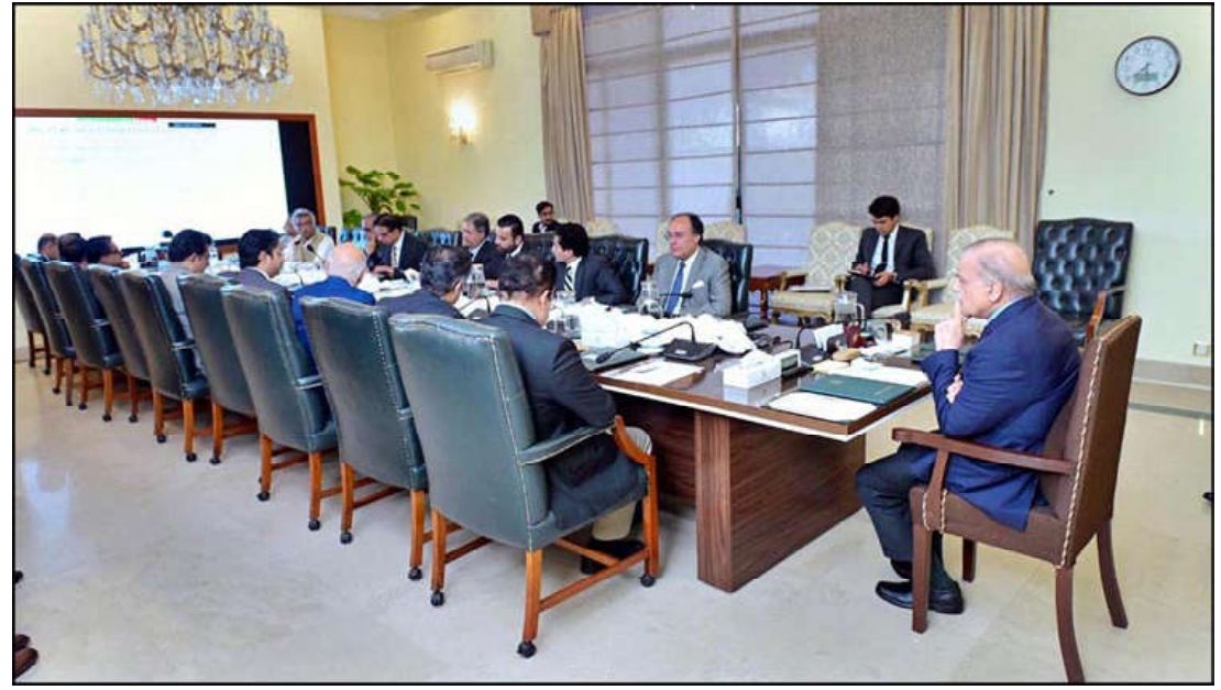
ISLAMABAD: Prime Minister Muhammad Shehbaz Sharif chairs a meeting regarding the Federal Board of Revenue.

The prime minister emphasized the need for a third-party audit of the web-based one-customs system (WeBOC). During the briefing on customs operations, it was reported that Pakistan Customs