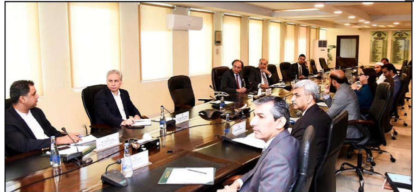
ISLAMABAD: Federal Minister for Finance and Revenue Senator Muhammad Aurangzeb chairing the Advisory Committee Meeting on Release of International Mobile Telephony (IMT) Spectrum for Next-Generation Mobile Broadband Services in Pakistan.