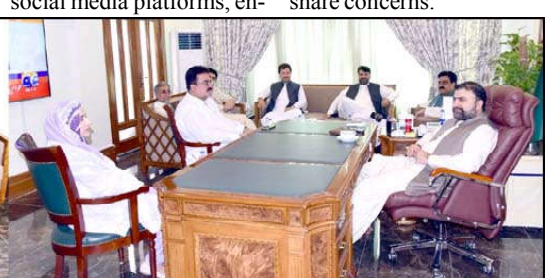
QUETTA: Parliamentary Secretaries and MPAs meeting with Balochistan Chief Minister Mir Sarfraz Ahmed Bugti.

ISLAMABAD (APP): Minister for Planning, Development and Special Initiatives Professor Ahsan Iqbal on Tuesday highlighted the significance of social media, calling it an "essential tool" in promoting citizen engagement, transparency and participation in government and political processes. "Citizens' engagement, transparency and participation in government and political processes have been revolutionized by social media platforms, enabling instant communication, mobilization, and dissemination of information," he said. The minister expressed these views while addressing an event titled "Digital Democracy in Action: Enhancing Engagement through Social Media," organized by the United Nations Development Programme (UNDP). He said social media platforms provided spaces for dialogue, enabling people from all walks of life to voice their opinions, share concerns,