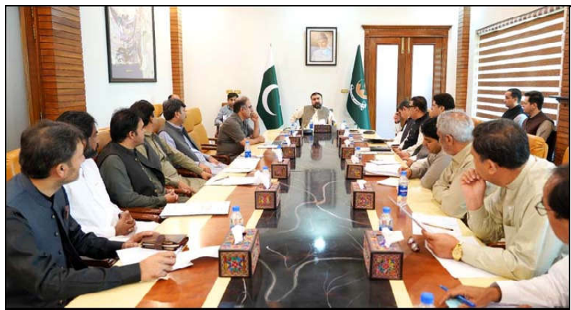
QUETTA: Balochistan Chief Minister Mir Sarfraz Ahmed Bugti presides over a meeting to review the departmental affairs of Culture, Tourism and Archeology.