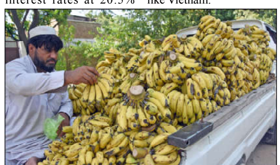
ISLAMABAD: A vendor is displaying Bananas attraction for customers on his loading van alongside a road, in the Federal Capital.

In a statement here on Tuesday, he highlighted that exorbitant taxes, high power costs, and a poor law and order situation severely impact the economy and could further accelerate unemployment. There was no justification for maintaining exorbitant interest rates at 20.5%