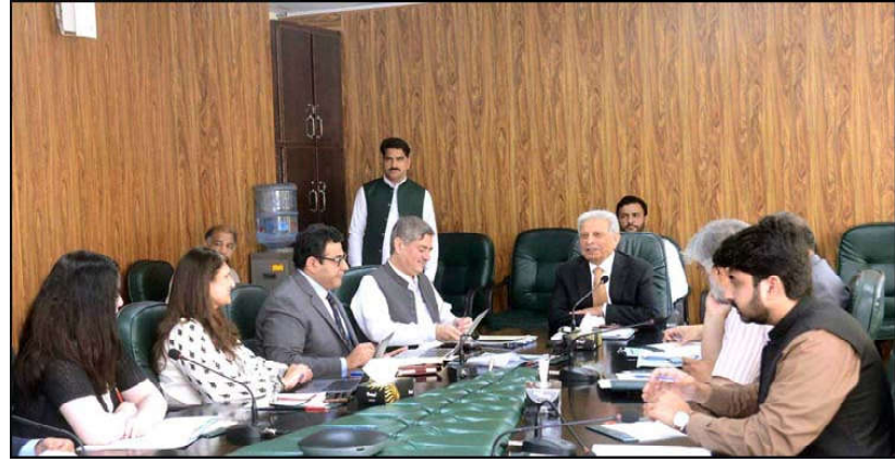
ISLAMABAD: Federal Minister for Industries and Production, Rana Tanveer Hussain chairing 11th meeting of the National Coordination Committee on Small Medium Enterprises Development.