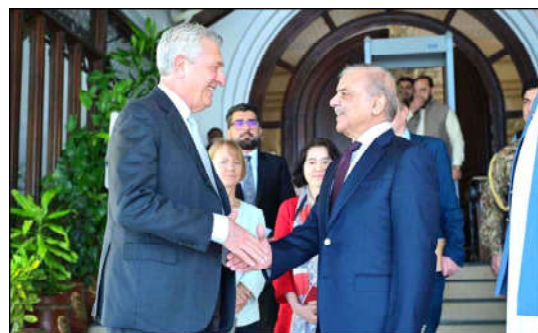
ISLAMABAD: UN High Commissioner for Refugees Filippo Grandi called on Prime Minister Muhammad Shehbaz Sharif.

ISLAMABAD (APP): Prime Minister Shehbaz Sharif on Tuesday urged the international community to recognize the burden being shouldered by Pakistan while hosting such a large refugee population and demonstrate collective responsibility. The prime minister, in a meeting with the United Nations High Commissioner for Refugees (UNHCR) Filippo Grandi at the PM House, reaffirmed Pakistan's commitment to address the protection and safety needs of people in vulnerable situations and underscored that the international community needed to be mindful of the socio-economic challenges and security threats