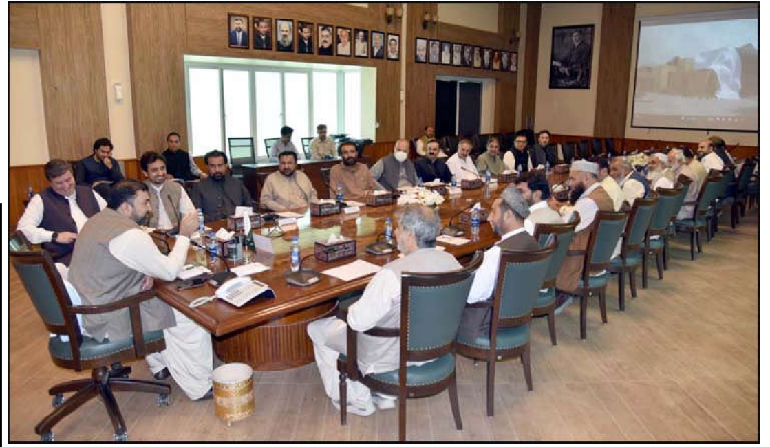
QUETTA: A delegation of representative of Zamindar Action Committee meeting with Balochistan Chief Minister Mir Sarfraz Ahmed Bugti. Provincial Ministers and Parliamentary Secretaries are also present.

Syed Yawar Ali and Afaq Ahmed Tiwana appreciated the government for prioritizing agriculture and livestock in its policy framework.