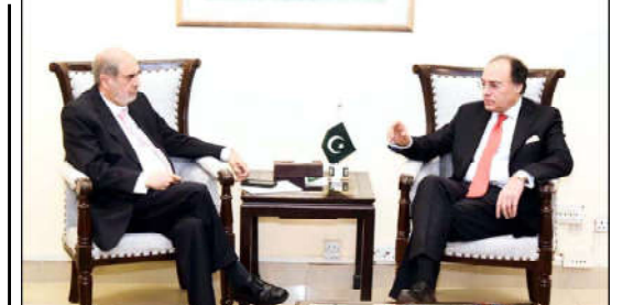
ISLAMABAD: Federal Minister for Finance & Revenue Senator Muhammad Aurangzeb in a meeting with the Chairman Nestle Pakistan and Ex-President Farmers Association of Pakistan.

The state minister said that the government was working on establishing a robust regulatory framework to safeguard consumer interest's post-privatization. The government is working to enhance corporate governance and auditing practices in the DISCOs.