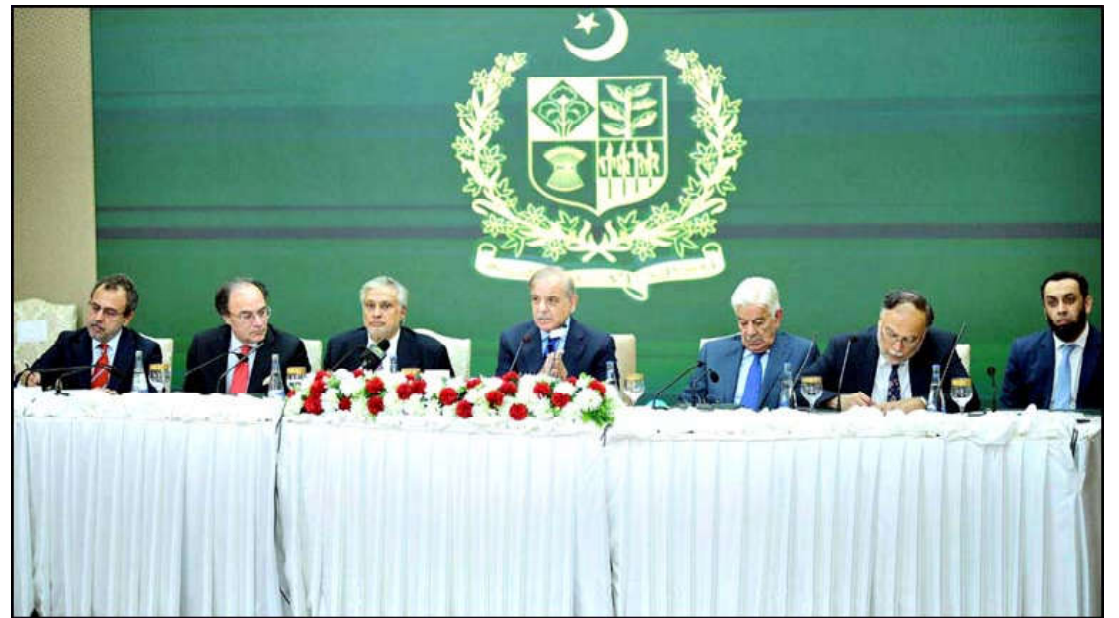
ISLAMABAD: Prime Minister Muhammad Shehbaz Sharif briefing parliamentarians regarding power sector reforms.

taxing the elite class, expanding the tax net, closing the non-performing entities and plugging the holes, causing financial leakages. He told the gathering of federal ministers and senior government officers that during its previous 16-month stint, the coalition government saved the country from default by putting its politics at stake.