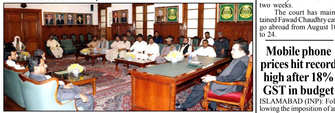
QUETTA: A delegation from different walks of life meeting with Balochistan Governor Jaffar Khan Mandokhail.