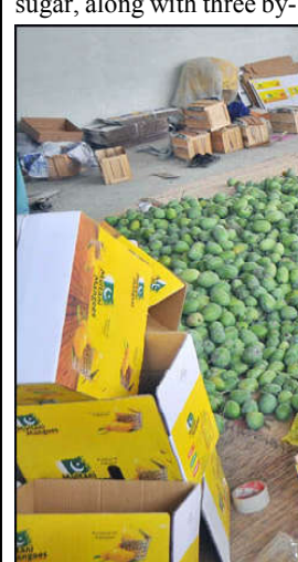
MULTAN: A worker weighing and packing good quality mangoes into the boxes for delivery to the other City.

JKSM is a private limited company with the business of production and sale of sugar or related products in Pakistan, said a press release issued here on Tuesday.