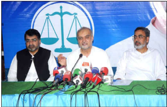
MULTAN: Ameer Jamaat-e-Islami Hafiz Naeem ur Rehman addressing a press conference at Islamic Center.