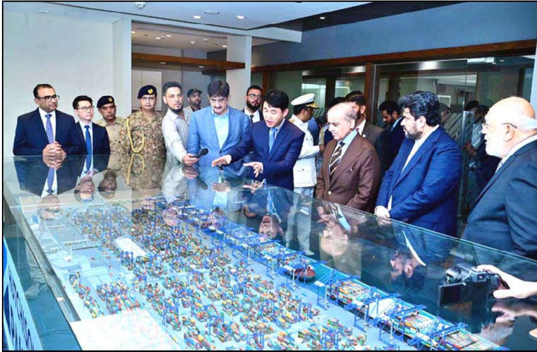
KARACHI: Prime Minister Muhammad Shehbaz Sharif receives briefing about Hutchison Ports Pakistan Terminal at Karachi Port.

Ph: 2841470/2841473 Vol: XX No. 08, Muharram 01, 1446 AH Monday July 08, 2024, Pages 04, Price Rs.15