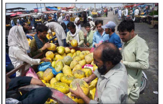
ISLAMABAD: People purchasing seasonal fruit displayed by vendor at Fruit and Vegetable Market in the Federal Capital.

He assured of resolving these issues promptly, promising to engage with the Higher Education Commission's officials for necessary actions.