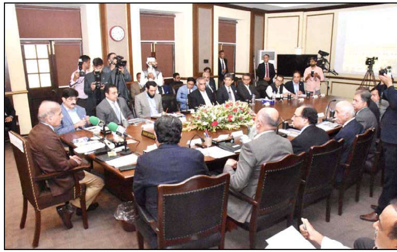
KARACHI: Prime Minister Muhammad Shehbaz Sharif chairs a meeting regarding Karachi Port Trust, Port Qasim Authority and Pakistan National Shipping Corporation.

maximum benefits and subsidy towards the peasants, Naeem ur Rehman stated. He stated that government should investigate wheat scandal and punished the persons involved in the scandal. Ameer Jamat-e-Islami also stressed for initiating talks with owners of IPPs in order to lower electricity tariff. Responding to a question about democracy, he stated that JI believed democracy in letter and spirit. He however added that other political parties lacked democracy within their ranks. Local government bodies should be given proper constitutional cover and these should operate independently, without interference of provincial governments as it could help resolve masses problems. Hafiz Naeem ur Rehman also supported reforms in judiciary to solve public problems.