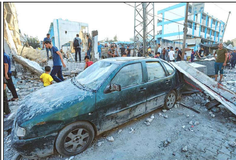
Palestinians gather at the site of an Israeli air strike on a UN school sheltering displaced people at Nusairat in central Gaza Strip.