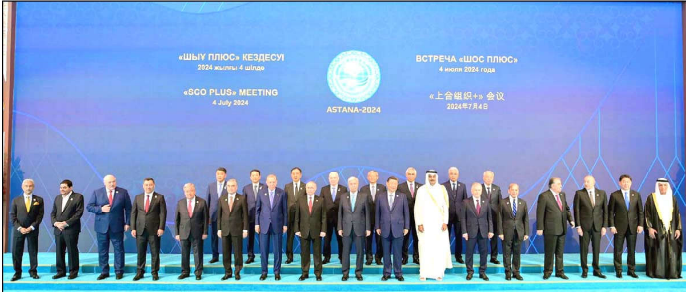
ASTANA: Prime Minister, Muhammad Shehbaz in a group photo with the Shanghai Cooperation Organization Plus Summit, held in Astana.

Ph: 2841470/2841473 Vol: XX No. 06, Zil Hajj 28, 1445 AH Friday July 05, 2024, Pages 04, Price Rs.15