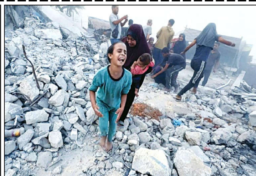
Palestinians react, following an Israeli strike near a UN-run school sheltering displaced people, in Khan Younis.

amid fierce fighting with Palestinian militants overnight, residents said. At least 12 people were killed in new strikes in central and northern Gaza, health officials said. Israeli leaders have said they are winding down the phase of intense fighting and would soon shift to more targeted operations in the nearly nine-month-war. But fighting continued overnight in two locations at the centre of Rafah, where tanks have seized several districts and advanced further west and north of the city in recent days, and concerns about the plight of hundreds of thousands of displaced people are growing. In Maghazi refugee camp in central Gaza, two Israeli airstrikes killed five Palestinians, health officials said. In Shejaia an airstrike killed four and wounded 17, medics said. Another airstrike hit a car in the southern city of Deir Al-Balah, killing three people, officials said.