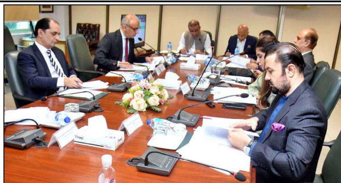
ISLAMABAD: Federal Minister for Privatisation / Chairman Privatisation Commission, Abdul Aleem Khan chairing 220th meeting of the Privatisation Commission Board.

meeting and a negotiation session was held with business group interested in purchase of the HBFC along with the officers of the Privatization Commission. Minister for Privatization Abdul Aleem Khan directed that all proposals for privatization should be opened in front of cameras in the presence of the media so that there should be no question on its transparency. Finance Minister Muhammad Aurangzeb and Law Minister Azam Nazir Tarrar also emphasized on the privatization.