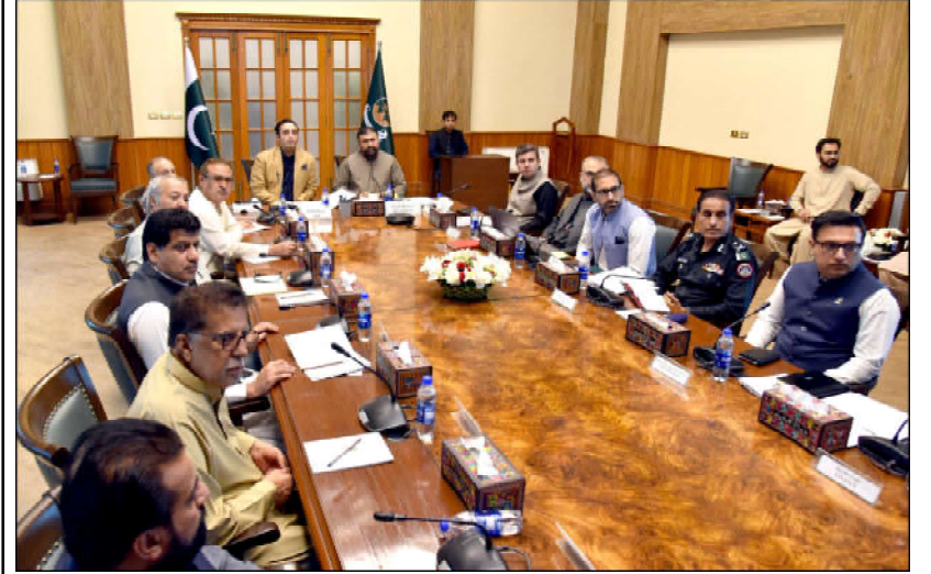
QUETTA: Chairman PPP Bilawal Bhutto Zardari and Chief Minister Balochistan Mir Sarfraz Bugti being briefed about law and order situation and development projects. Provincial Ministers and senior officials are also present