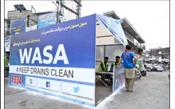
RAWALPINDI: Water and Sanitation Agency (WASA) establish Flood Response Unit at Guwalmandi near Nullah Lai as pre-monsoon spell is expected to start from Thursday to Sunday and assured that all necessary arrangements have been made in this regard by Rawalpindi Development Authority (RDA).