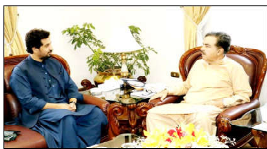
QUETTA: Provincial Finance Minister Mir Shoaib Naushervani meeting with Governor Balochistan Sheikh Jaffar Khan Mandokhail

Balochistan on the behest of enemy country, India. He urged the human rights organizations to raise wholehearted voice against these terrorists organizations taking notice of their inhuman acts. He mentioned that the terrorists organizations are attacking the armless and innocent Balochs, security forces and national installations in Quetta and other rural areas of province for their nefarious designs. He inquired that whether the state or government can be silenced against those massacring the innocent Baloch peoples?